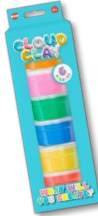
SUPER SOFT CLAY