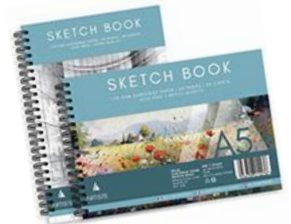
A5 ARTIST PAD