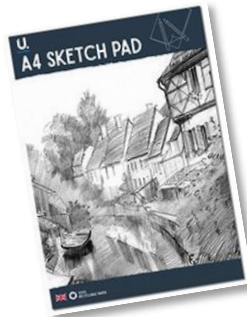
A4 ARTIST PAD