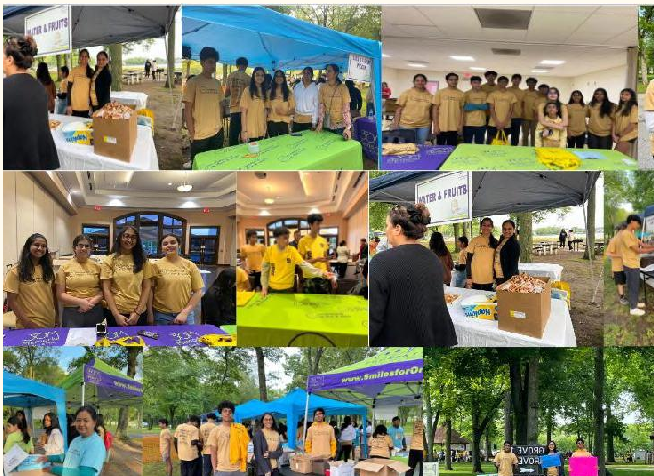
LEAD participants supported the 5K Run/Walk in New Jersey

Sewa International's Central Jersey Chapter has partnered with local organizations and nonprofits for the past two years to support OM Foundation's "OM Memorial 5K Run/Walk" in Monroe Township, New Jersey. This event raises funds for and awareness about childhood cancer research.