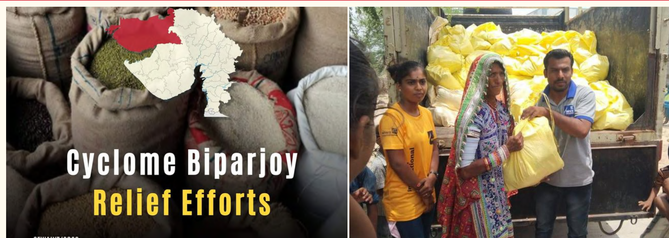
The Cyclone Biparjoy-affected families in Gujarat receiving essential kits

Sewa has distributed 140 essential ration kits to the affected families in Gujarat. Additionally, volunteers are serving cooked meals to those in need. Gujarat is currently facing the devastating aftermath of Cyclone Biparjoy.