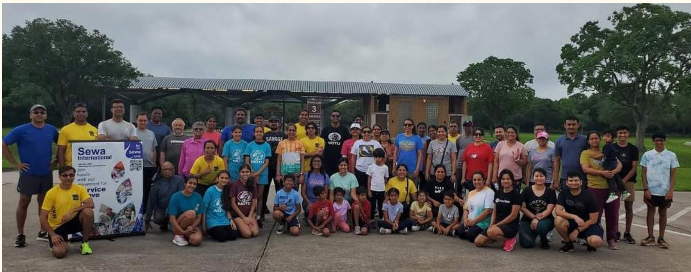
Houston's SELF Team at 5k walk/run annual event in League City, TX

Sewa International Houston's SELF Team, in collaboration with the Indian Cultural Center of Clear Lake (ICCL), Sanatan Dham, and the Jain Business Group, hosted their highly anticipated twenty-seventh 5k walk/run event recently, at Challenger Seven Memorial Park in League City.