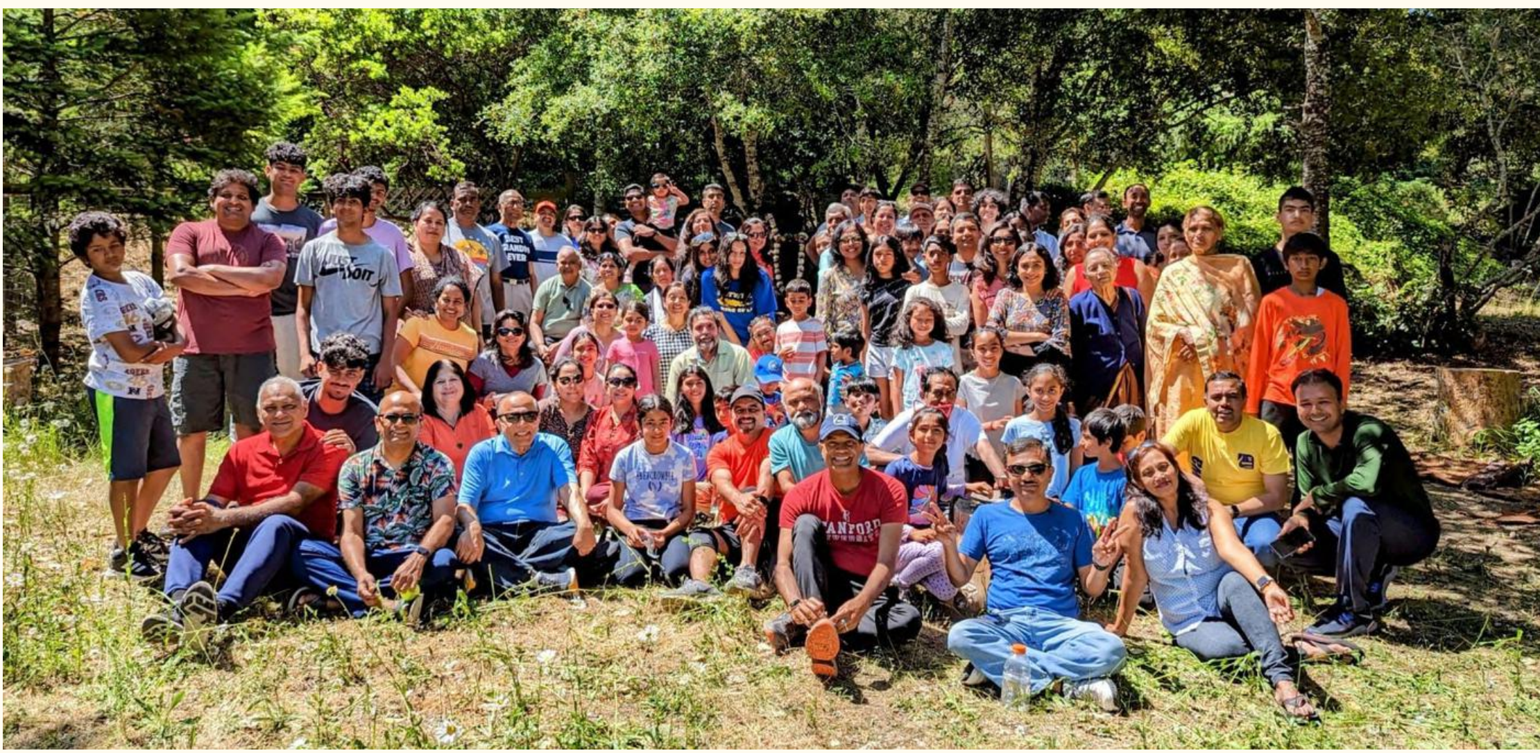
Participants of weekend family camp at redwood forest in Piercy, CA

A recent weekend family camp organized by the Sewa Bay Area Chapter at the serene Chinmaya Mission Krishnalaya brought more than a hundred people together. The redwood forest in Piercy, CA, became the backdrop for the gathering during the weekend.