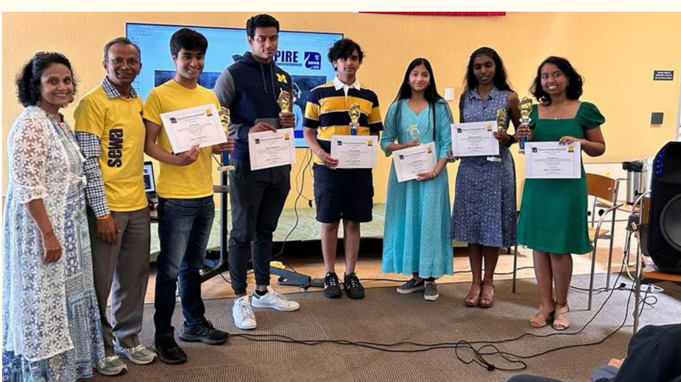
ASPIRE volunteers in an orientation program

The event celebrated the contributions of six dedicated young volunteers who had excelled in the ASPIRE program. These students, graduating from high school and moving on to college/university, are exceptional individuals who shared their volunteering experiences, highlighting how they impacted them and the communities they served.