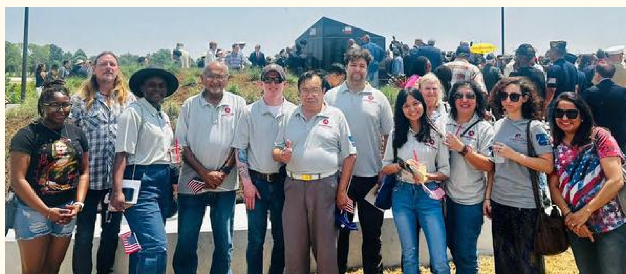
Sewa Houston AmeriCorps Members