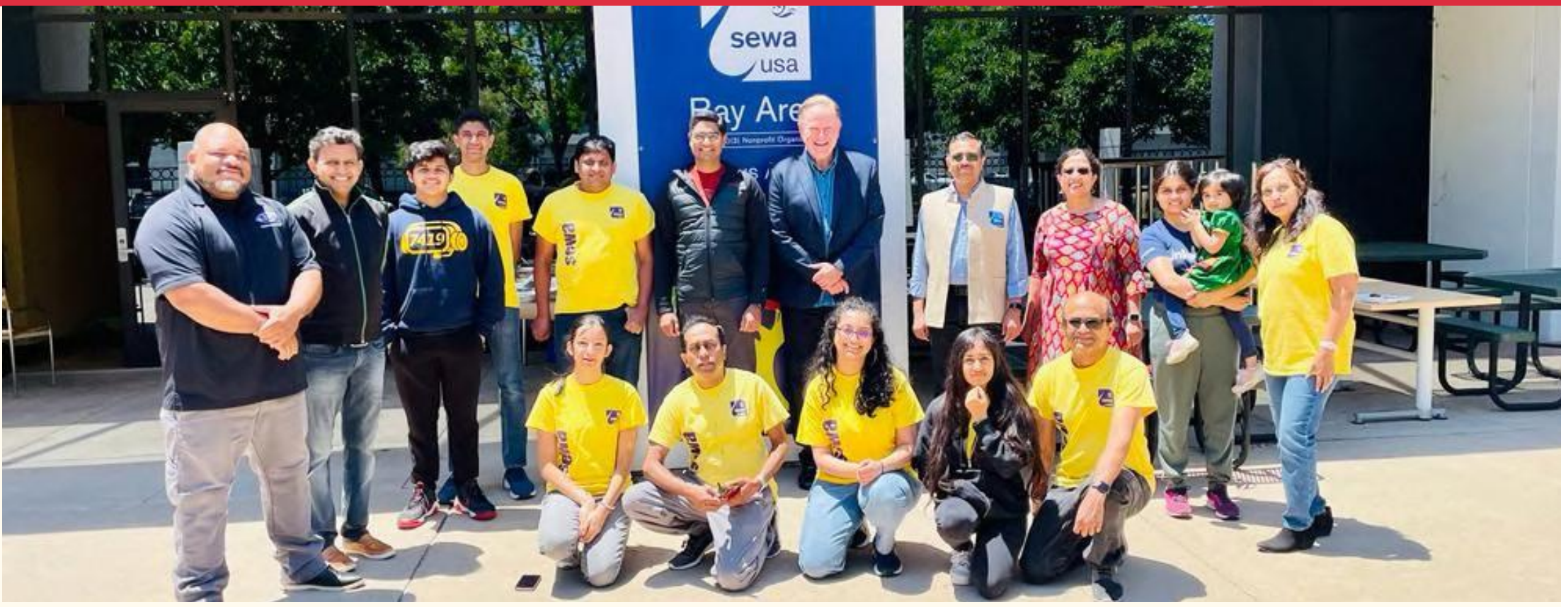
Attendees at Design to Lead (DTL) symposium in Bay Area, CA

Sewa Bay Area Chapter hosted the Design to Lead (DTL) symposium centered around "Addressing Inequities in Underserved Communities," at the Sewa Community Center (SCC) on June 25, 2023.