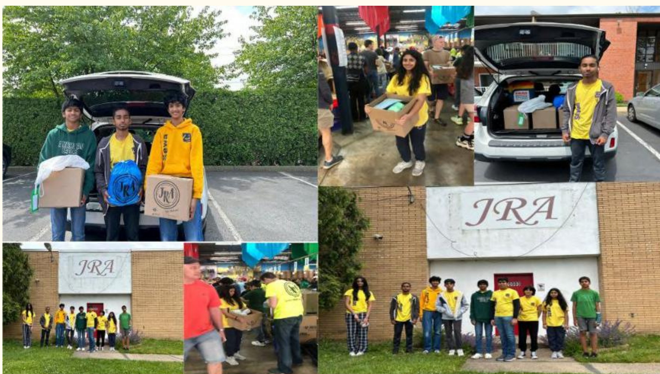
LEAD volunteers at work in various food banks in New Jersey

Sewa's LEAD members (Leadership Development through Community Engagement) from Central Jersey were involved in serving and working at various food banks, food pantries, and food shelters in their commitment to serving their local communities.