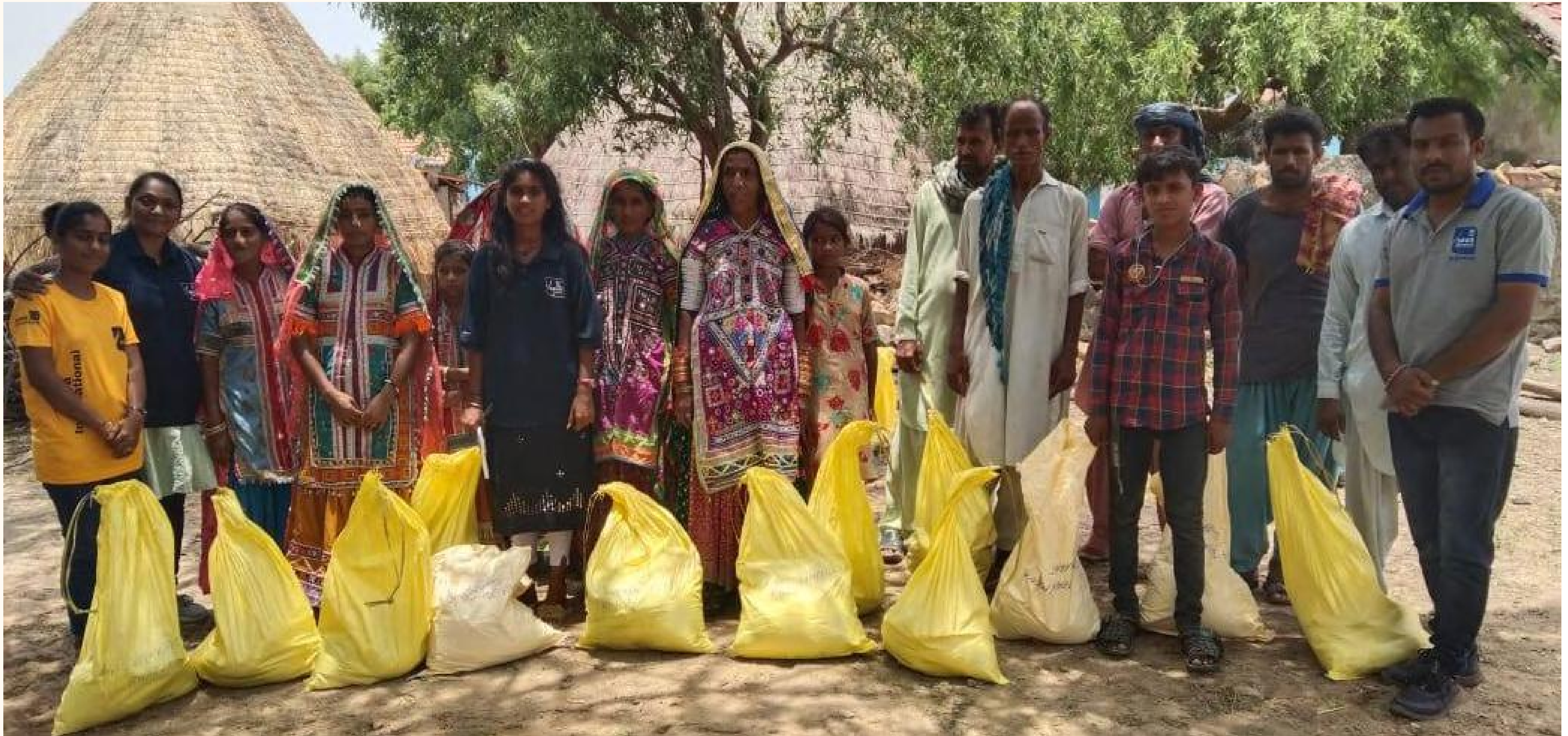
Sewa volunteers distributed essential item kits to the families affected by Cyclone Biparjoy in Gujarat, India

Sewa International has raised nearly $70,000 through its fundraising campaign for three relief efforts. To support Balasore train victims, Sewa raised about $40,000. For Manipur relief efforts, it collected almost $22,000, and nearly $7,000 to assist the Cyclone Biparjoy-affected families of Gujarat. Sewa provides food, medicine, and other essential items to affected families through its relief program.