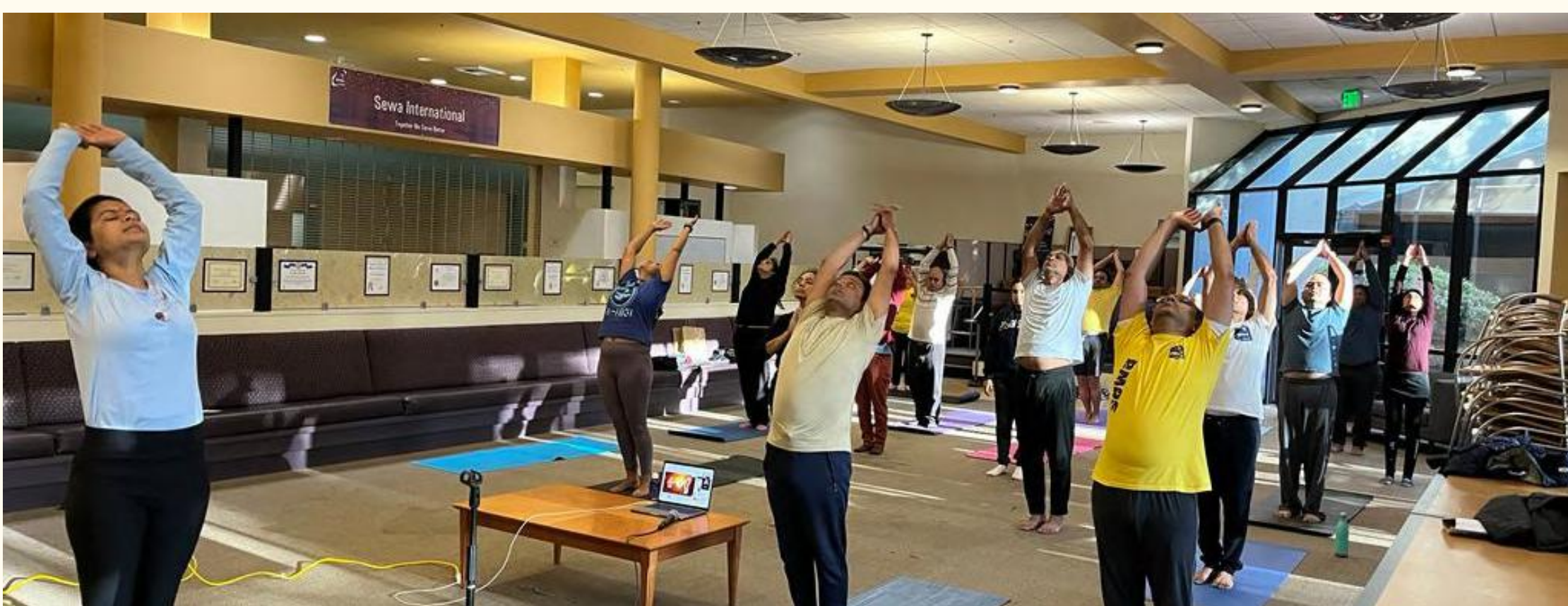
Bay Area SELF team performing surya namaskar

Sewa International's Bay Area SELF (Sleep, Exercise, Living in the Present / Lifestyle Practices, Food and Diet) team celebrated International Yoga Day to enumerate the benefits of yoga.