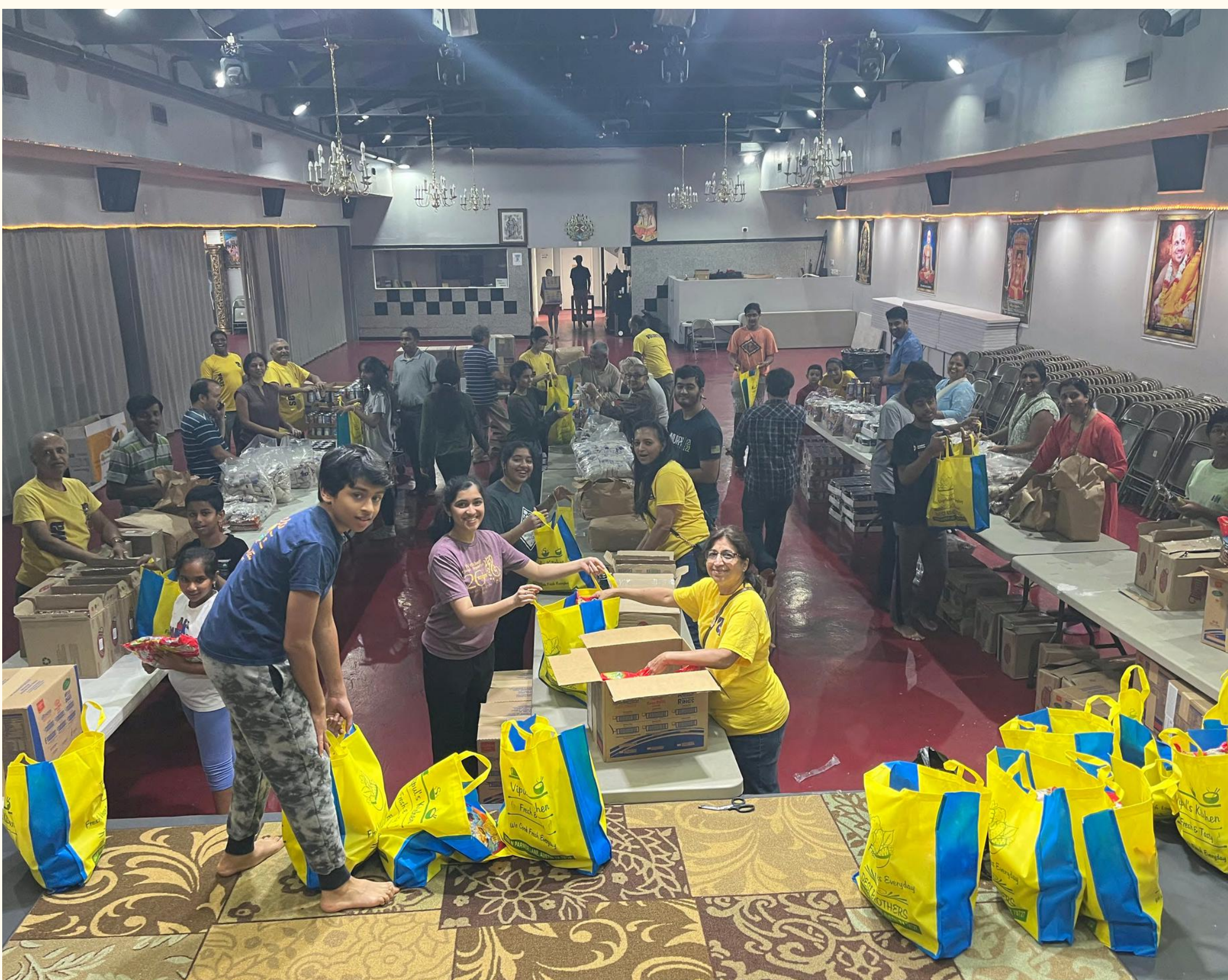
Houston Chapter volunteers involved in a food distribution drive

With the generous support of Fort Bend County Judge's office, Sewa's Houston Chapter successfully conducted a series of food distribution drives in June 2023.