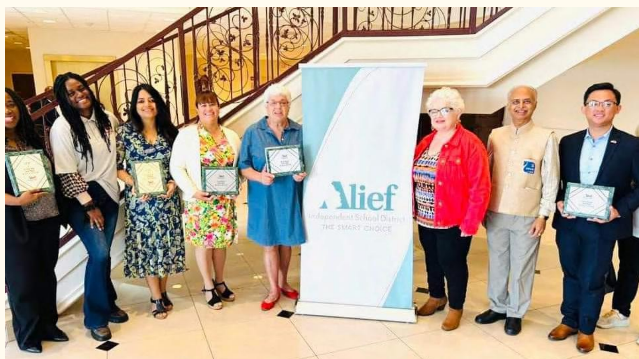
Sewa volunteers with Alief ISD officials in Houston, TX

Alief Independent School District of Texas has recognized Sewa International as their “Diamond Partner in Education” for the academic year 2022-2023.