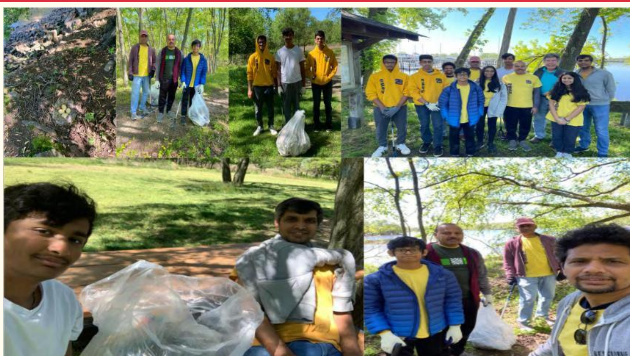
Central Jersey LEAD volunteers cleaned up parks in Riverside, NJ

Amico Island in Riverside, NJ, a beautiful park, has been faced with the problem of littering. In response, the Burlington County Department of Solid Waste organized a cleanup recently to address the issue.