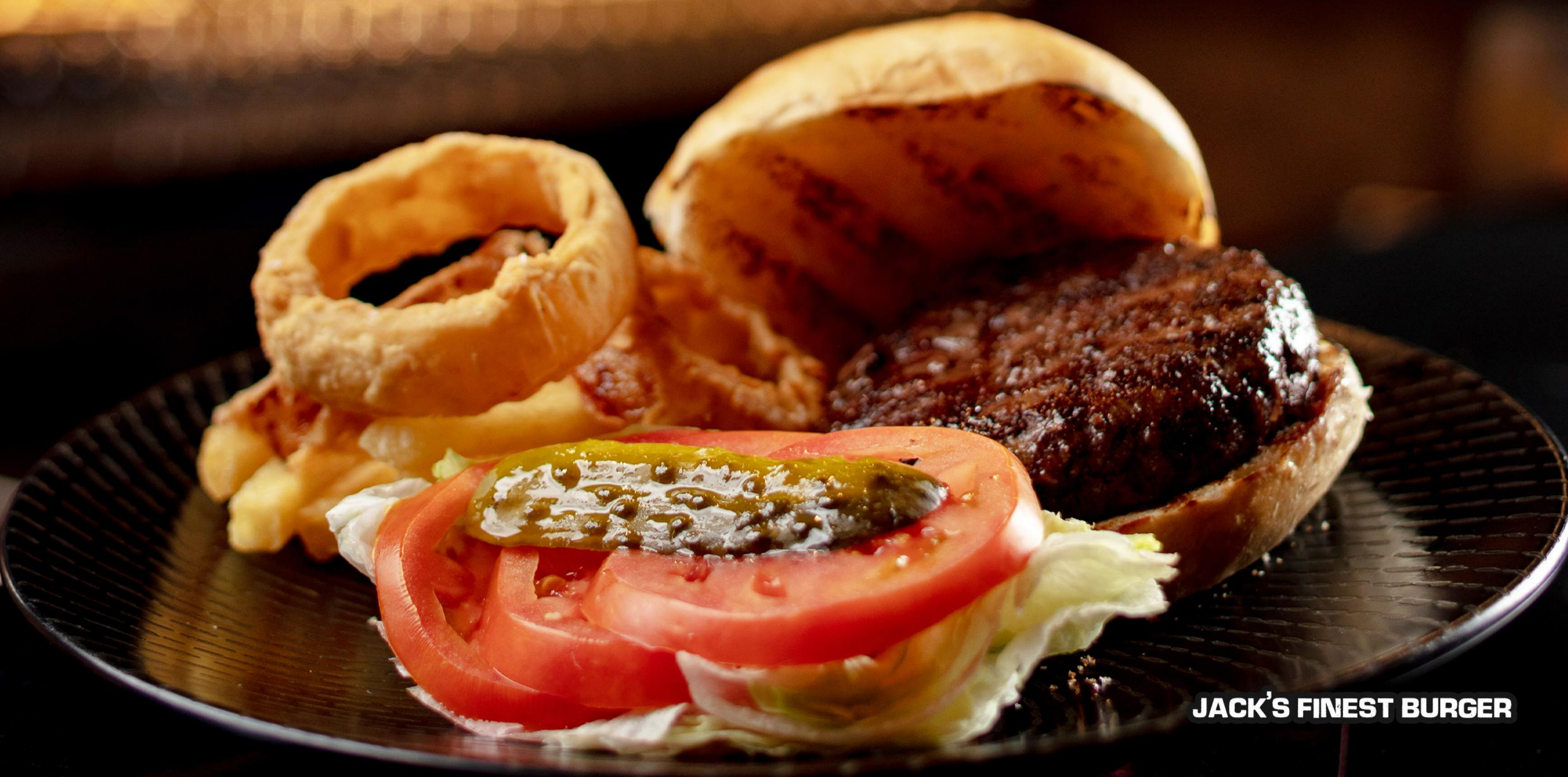
JACK'S FINEST BURGER