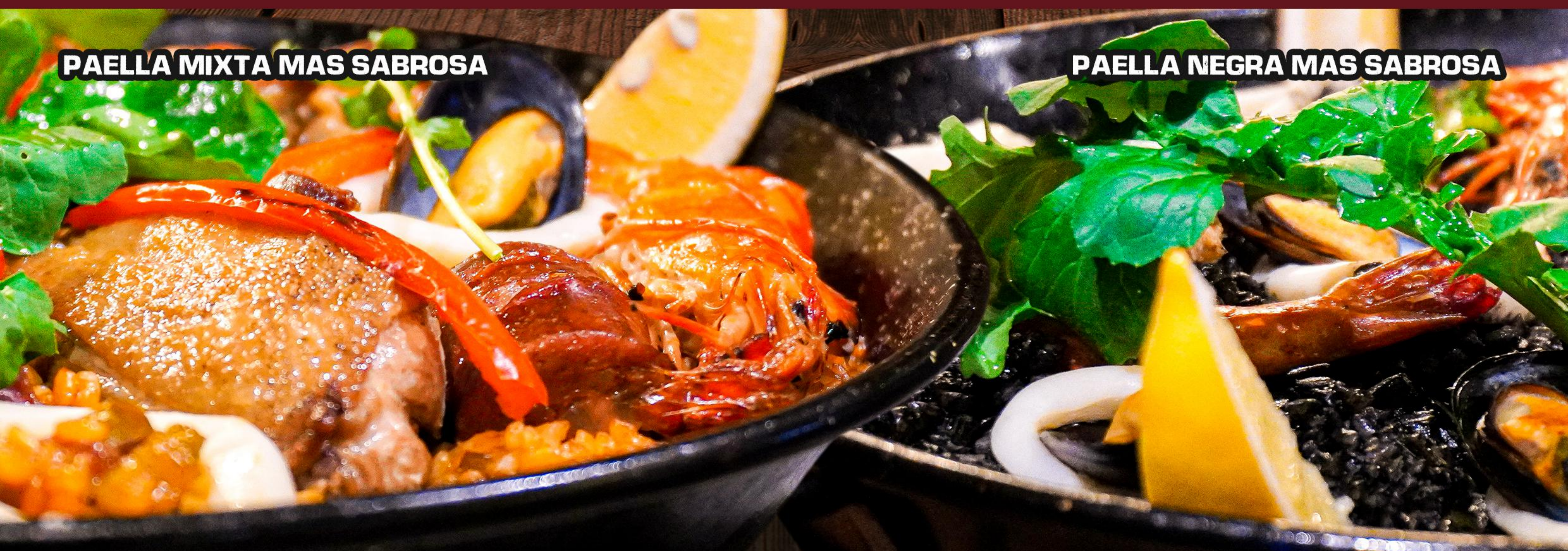
PAELLA MIXTA MAS SABROSA