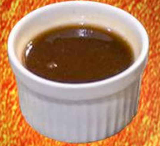
MAPLE GLAZED SAUCE