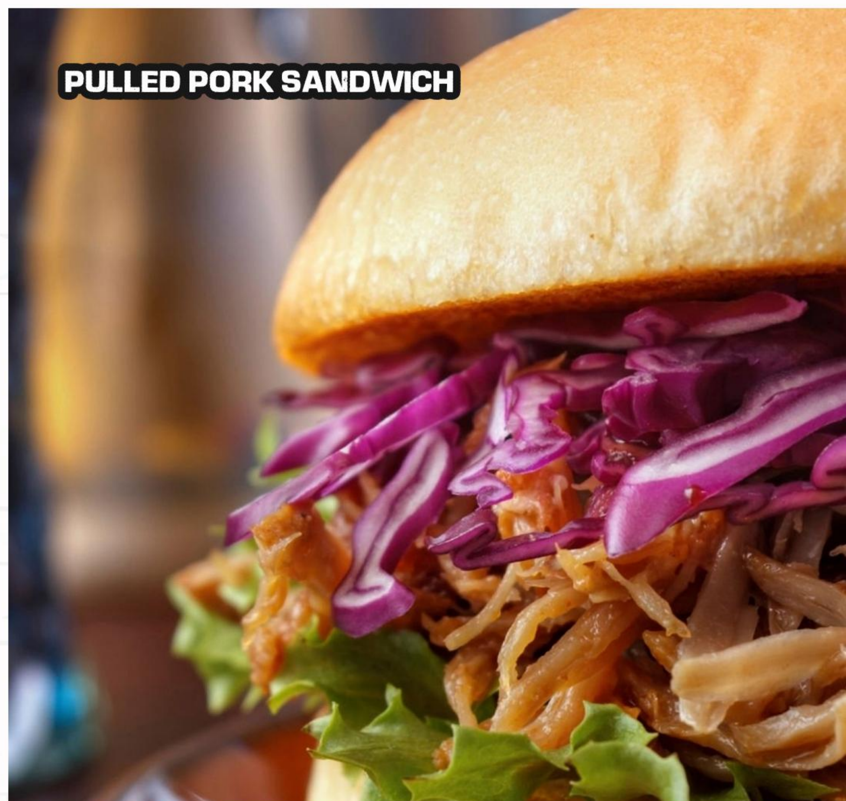
PULLED PORK SANDWICH

bratwurst, cheddar cheese, pickled cabbage..... P440