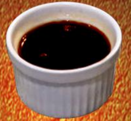
JACK DANIEL'S GLAZED SAUCE