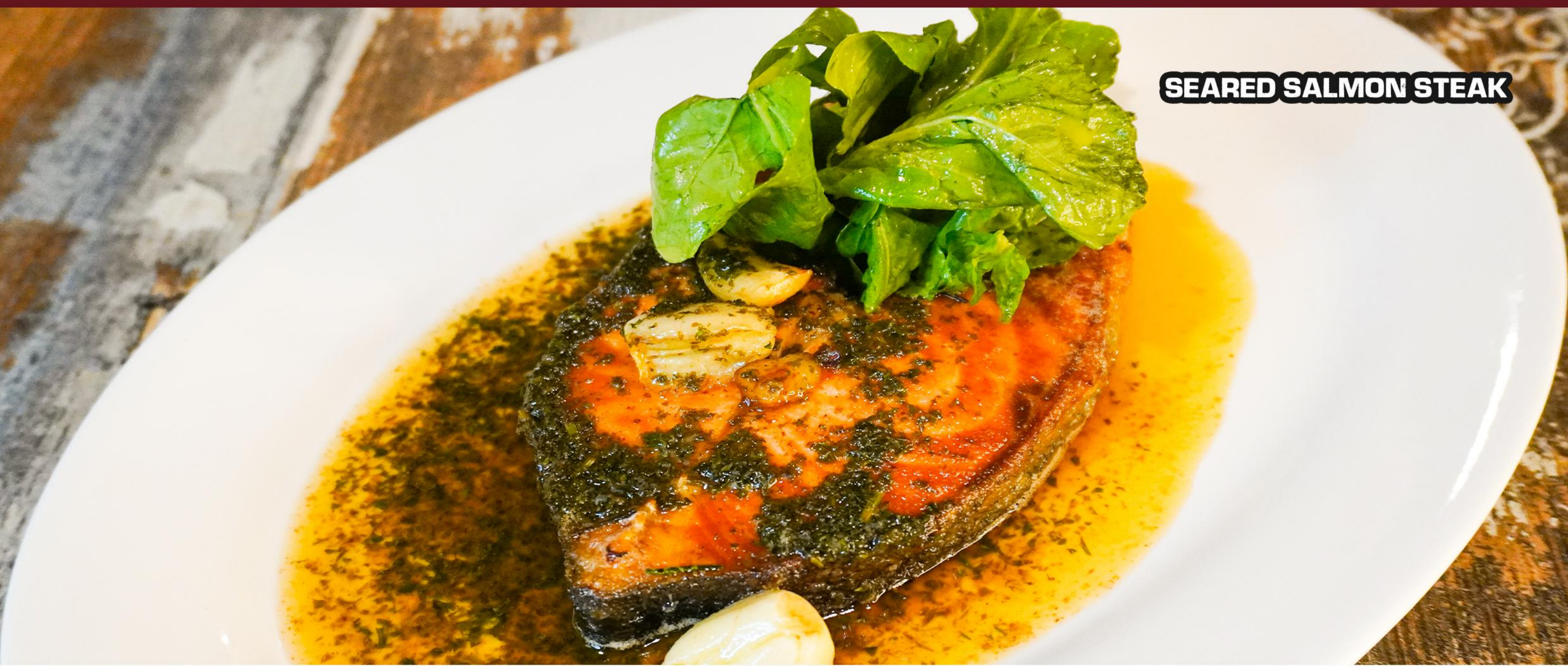
SEARED SALMON STEAK