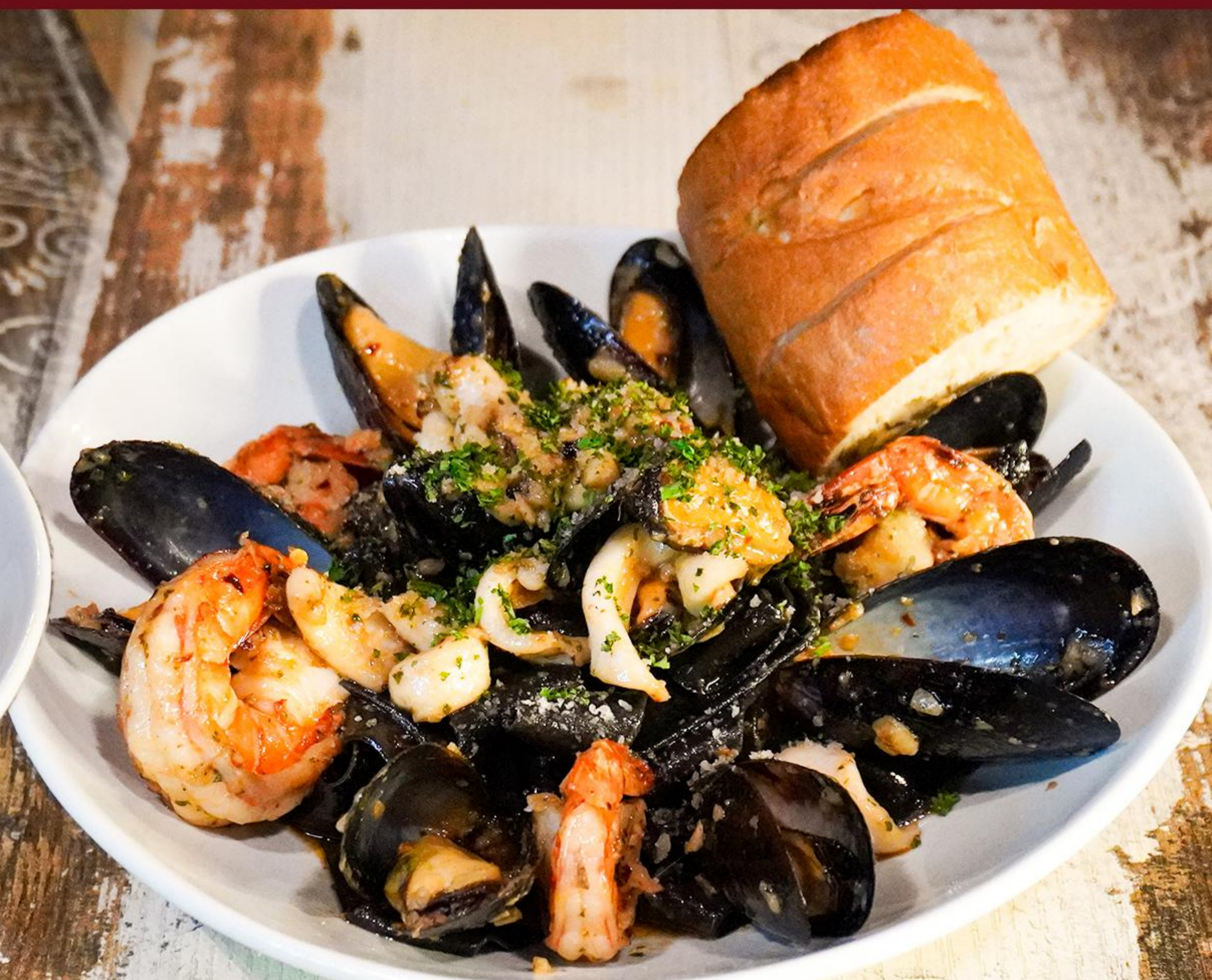
SEAFOOD AGLIO OLIO