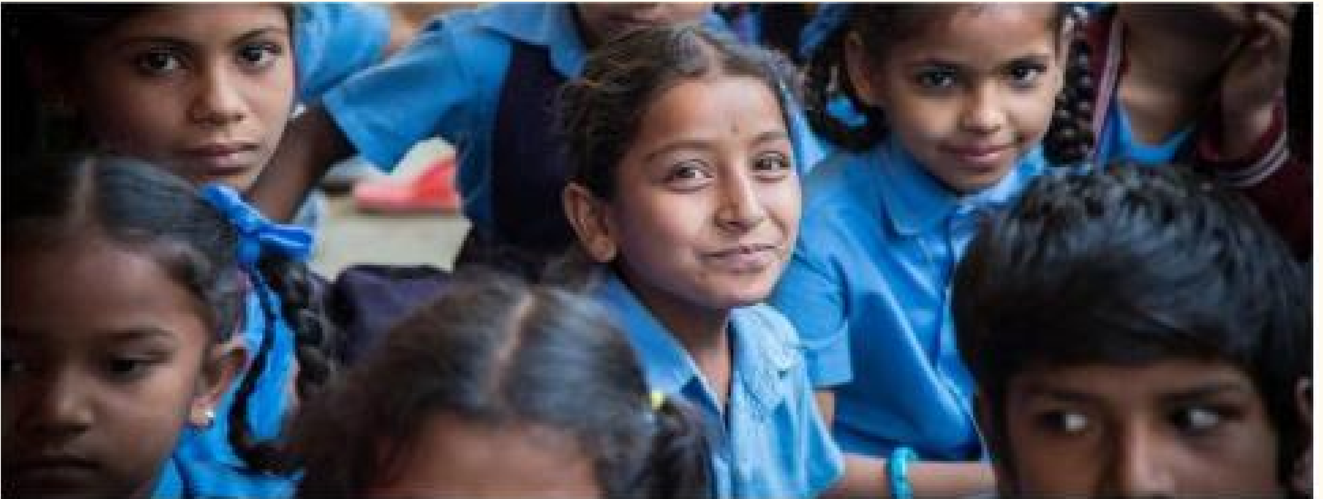
The 'SHE' Project -- Sanitation, Hygiene, and Empowerment -- focuses on building toilets in government and non-profit schools in India.

Sewa International's 'SHE' project for the girl child was conceived to provide sanitation and hygiene facilities for underprivileged girls who belong to vulnerable sections of Indian society. Along with sanitation facilities, the program focuses on menstrual hygiene, education, and empowering women and girl child through skill development workshops. Here, is an Impact Story from "108 Impact Stories" - Google for Toilets: Some of North Karnataka's Successful Projects.