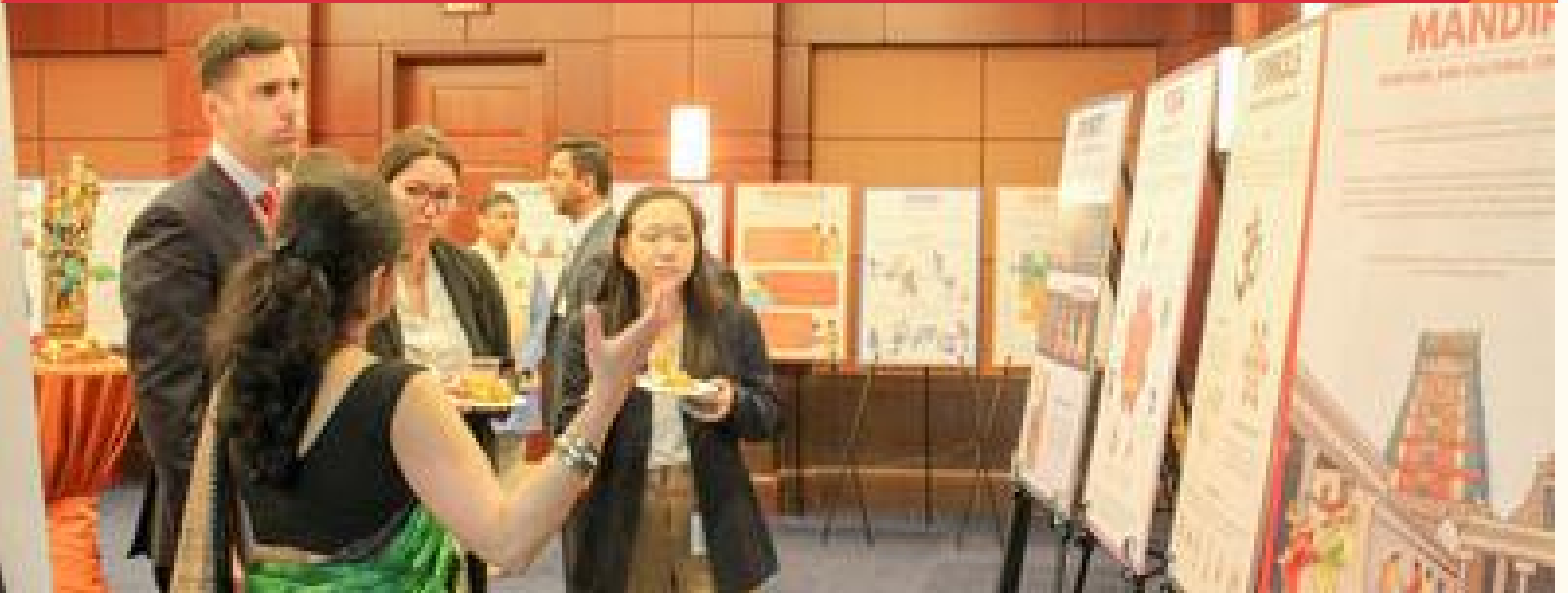
A volunteer describes the posters on display at the 'Darshana' exhibition on Hindu civilization at the Capitol in Washington D.C., May 2022.

Darshana – a Glimpse into the Hindu Civilization is a traveling exhibition that provides a close look at many aspects of Hindu civilization. Designed and developed by the volunteers of Hindu Swayamsevak Sangh (HSS), a non-profit, voluntary, cultural and community organization, 'Darshana' was hosted in 200 cities across the United States.