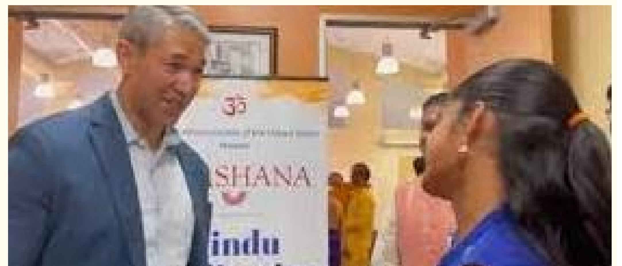
A visitor listens intently to a volunteer at the 'Darshana' exhibition at the Capitol in Washington D.C.

Ancient Hindu civilization had world-renowned schools and universities that catered to a diverse student body, where various sections of the society were well represented, and established forms of leadership where women could obtain positions of power and leadership.