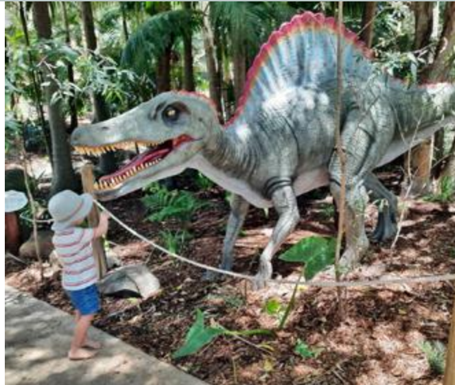
A Spinosaurus dinosaur greets visitors on Currumbin's Extinction Trail