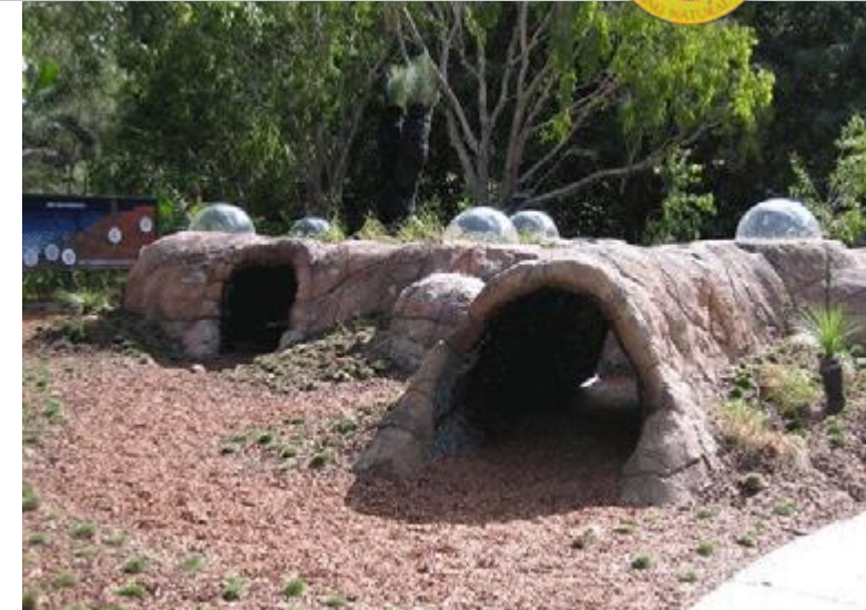
Discovery play tunnels with viewing domes