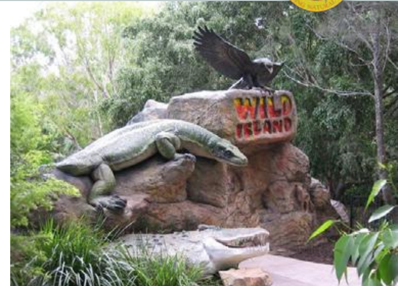
Wild Island entry with a crocodile, komodo dragon, eagle & thylacine