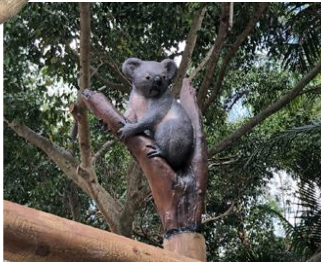
Koala sculpture in a tree fork

Contact Natureworks to see how our sculptures and props can help you create natural magic!