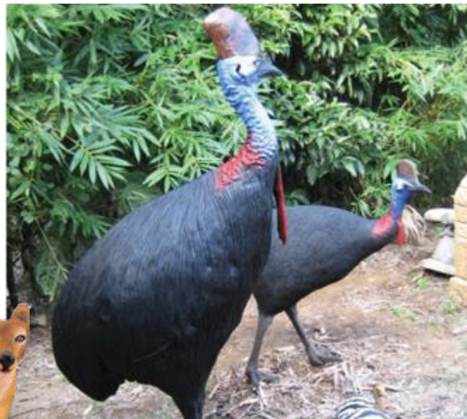
Cassowary sculptures in the garden