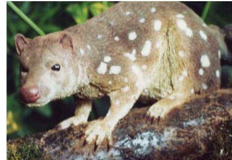
Have you spotted the spotted quoll?