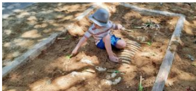
Children love the fossil dig sandpit