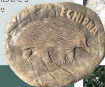
Wildlife stepping stone

Similarly, artificial landscape elements are a practical way to design an immersive environment that meets the needs of visitors, staff and wildlife alike.