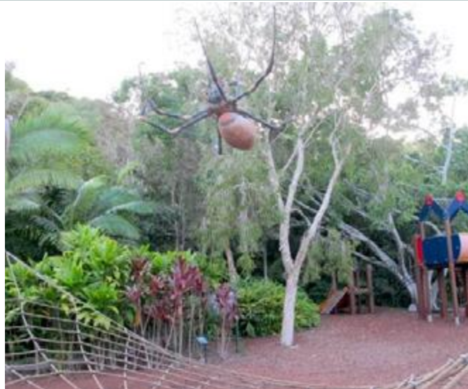
Giant Golden Orb Weaving Spider above the play area