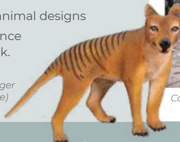
Tasmanian Tiger (Thylacine)