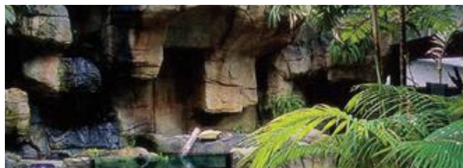
Artificial rockwork provides shade and shelter