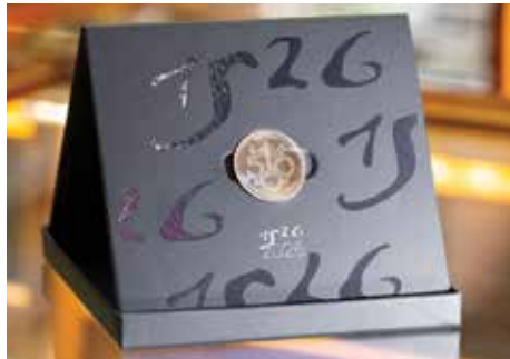
Buy a new Beretta in 2026, and the company will give you a commemorative 500th anniversary medal.

For complete program information, visit beretta500.com/en/be-part-of .