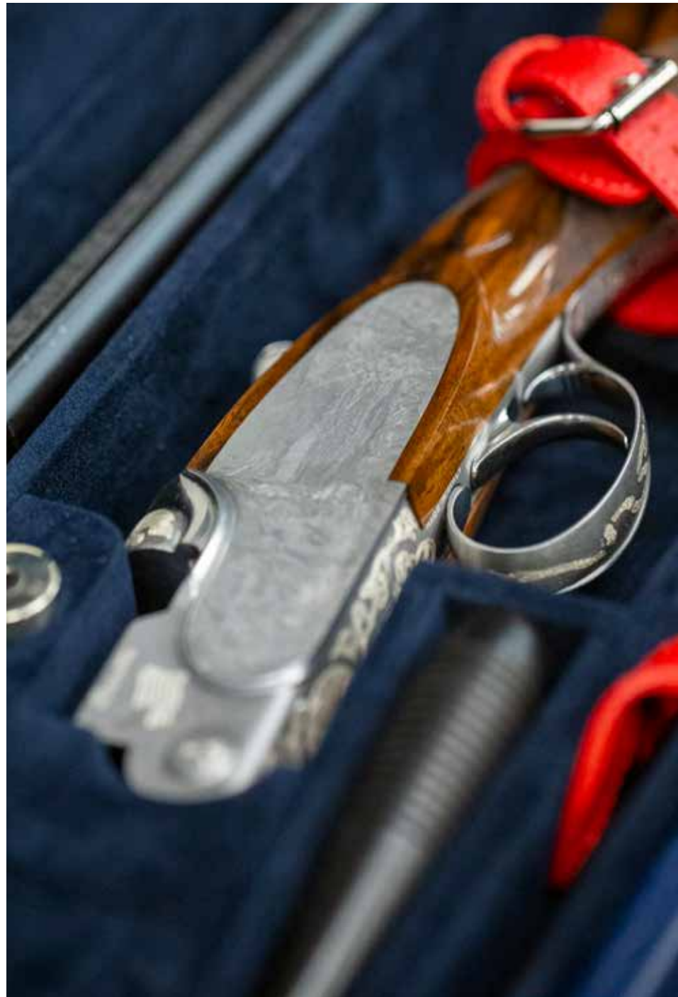
The firearms are stored in custom cases that are works-of-art in themselves.

One sideplate shows George Washington in the first clandestine mission motif, his crossing of the Delaware River