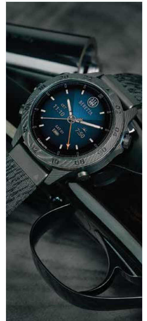
The Garmin MARQ Commander (Gen 2) Beretta Edition is on display at Beretta's Convention booth. The watch is limited to 500 individually crafted watches and represents the meeting of two brands defined by precision, performance and legacy.

SCI attendees can explore the newest commercial firearms and accessories introduced earlier this year, fresh from the SHOT Show. A selection of firearms, as well as clothing and accessories, will