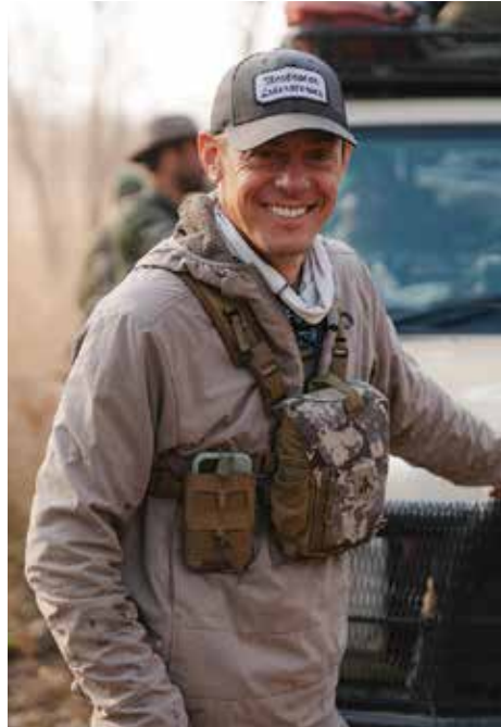
Steve Rinella, MeatEater media founder, hunted in Africa for the first time in 2025. "I cannot believe it took me 50 years to get here," said Rinella during his Tanzania safari.

His writing has appeared in many publications, including the Wall Street Journal , Outside , The New York Times and Men's Journal . Rinella also appeared in