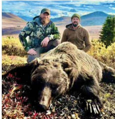
Alaska brown bear hunt up for auction.