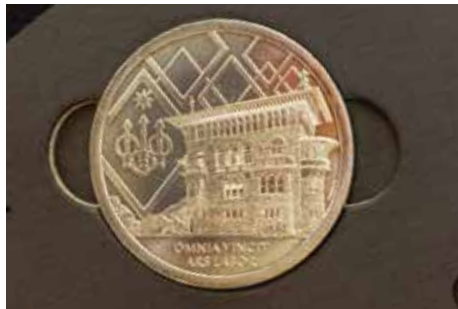
The commemorative medal is designed in partnership and manufactured by the Istituto Poligrafico and Zecca delle Stato, the Italian State Mint. It honors the world's oldest firearms manufacturer and its enduring "Made in Italy" heritage.