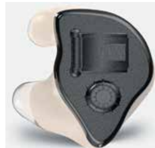
ESP Apex is a state-of-the-art hearing protection and enhancement aid that provides hunters with 360-degree situational awareness.

For a free fitting and to learn more about exclusive show specials, visit booth 3236.