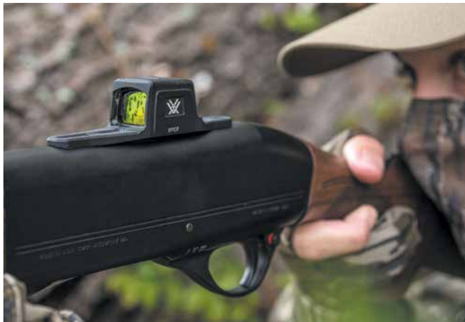
The Vortex Viper Enclosed Green Dot mounts directly to the receiver to reduce felt recoil and improve cheek weld.

We tried it out during the 2025 turkey season. It was good to shoot with such a low sight, and the cheek weld was solid. It's hard to judge and measure felt