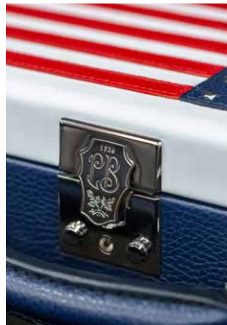
The "PB" on the Pietro Beretta Selection logo is engraved onto case latches.