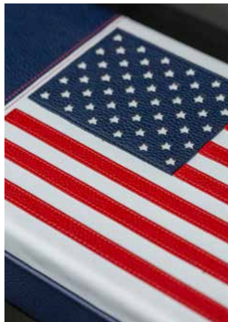
The flag of the United States lies over the top of the firearms' cases.