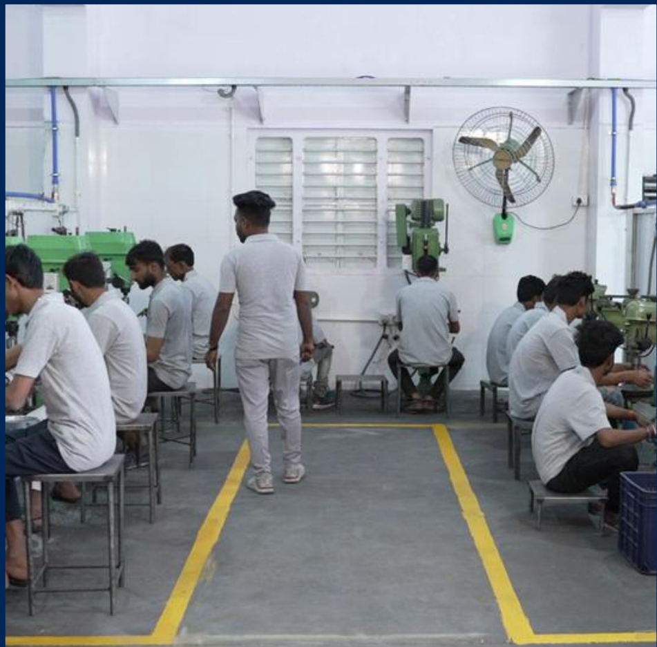
Drilling – Tapping & Conventional Shop