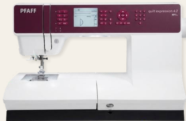
quilt expression 4.2