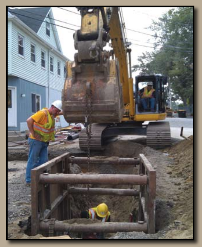
Crew installing a water gate, part of the water main upgrade portion of the Coburn St. project, Framingham, MA.