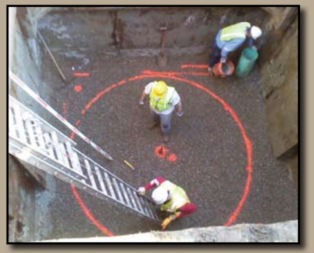
Workers are getting ready to install a submersible pumping station in Scituate, MA.

proximately 400 jobs. The major goal for this project will be a catalyst for other development and investment in the area and provide new tax revenues for the City of Lawrence. Finally, the project will improve the environment and public health by removing contaminated soils and eliminating untreated runoff into the Merrimack River.