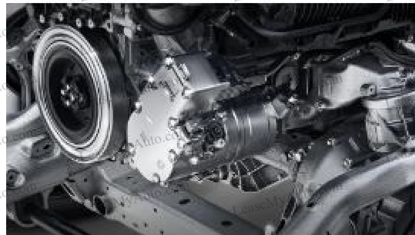
Hybrid Integrated Starter-Generator