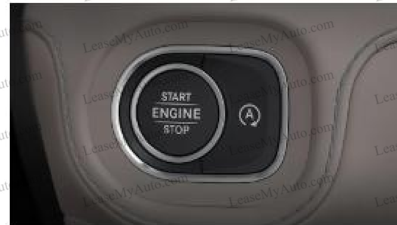
ECO Start/Stop system