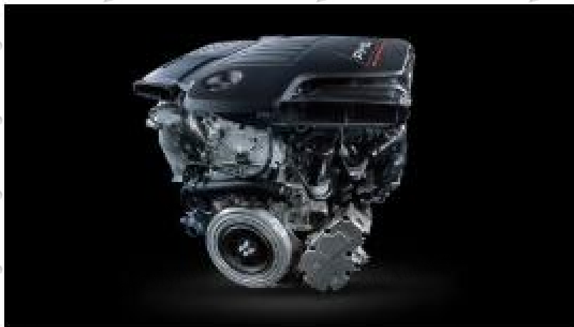
AMG-enhanced 3.0L inline-6 turbo engine with hybrid assist