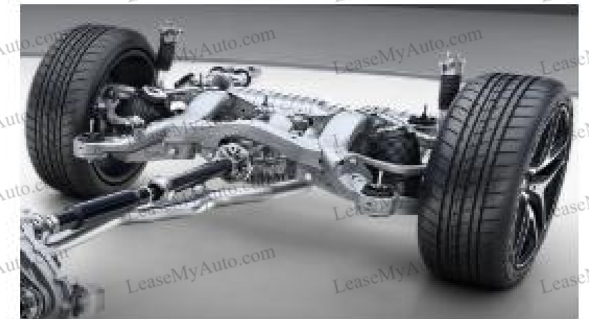
AMG Performance 4MATIC+ all-wheel drive