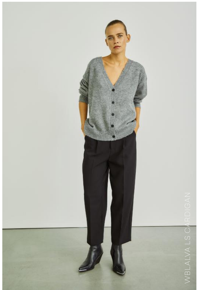
WBLALVA LS CARDIGAN