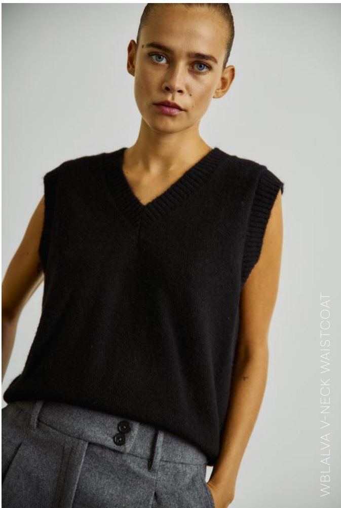
WBLALVA V-NECK WAISTCOAT