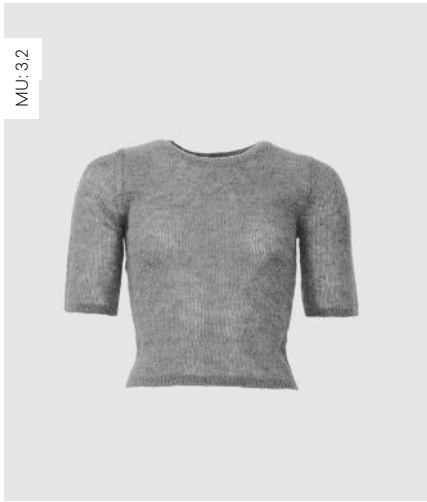
WBLAXELLE HALF SLEEVE PULLOVER Grey Melange 51% Wool, 18% Alpaca, 31% Polyamide RRP 59,99 EUR | WHS 18,75 EUR