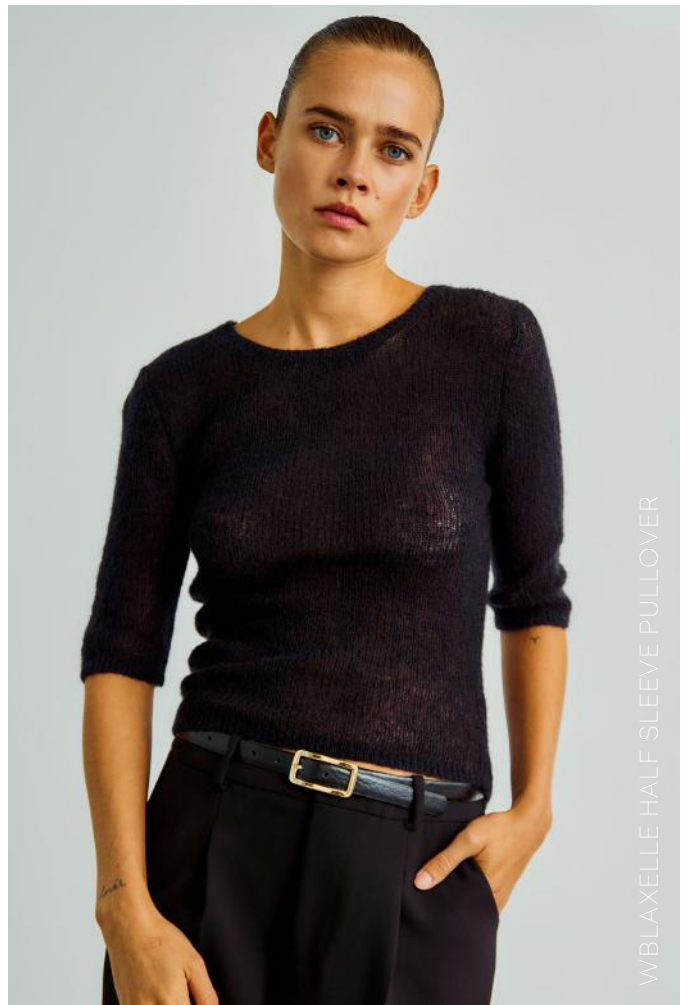
WBLAXELLE HALF SLEEVE PULLOVER