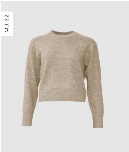
MU: 32 WBLALVA LS O-NECK PULLOVER Silver Lining Melange | 55% Polyester, 28% Acrylic, 15% Wool, 2% Elastane RRP 59,99 EUR | WHS 18,75 EUR