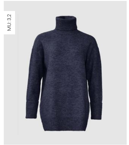
MU: 32 WBLALVA LONG ROLL NECK SWEATER Country Blue Melange | 55% Polyester, 28% Acrylic, 15% Wool, 2% Elastane RRP 69,99 EUR | WHS 21,87 EUR