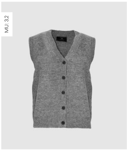
MU: 32 WBLALVA BUTTON WAISTCOAT Grey Melange | 55% Polyester, 28% Acrylic, 15% Wool, 2% Elastane RRP 59,99 EUR | WHS 18,75 EUR