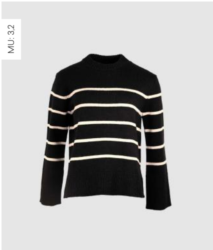
WBLCASSIDY LS STRIPED PULLOVER Silver Lining Stripe 100% Wool RRP 99,99 EUR | WHS 31,25 EUR