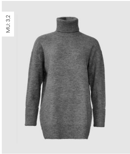
MU: 32 WBLALVA LONG ROLL NECK SWEATER Mid Grey Melange | 55% Polyester, 28% Acrylic, 15% Wool, 2% Elastane RRP 69,99 EUR | WHS 21,87 EUR