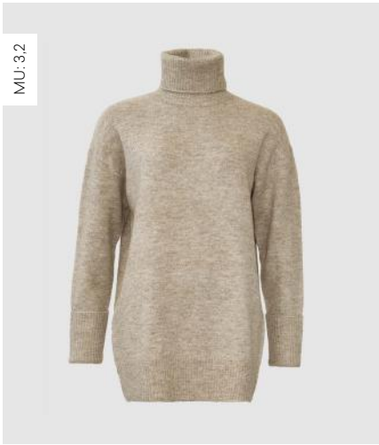
MU: 32 WBLALVA LONG ROLL NECK SWEATER Silver Lining Melange | 55% Polyester, 28% Acrylic, 15% Wool, 2% Elastane RRP 69,99 EUR | WHS 21,87 EUR