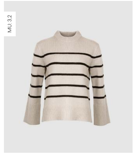
WBLCASSIDY LS STRIPED PULLOVER Black Stripe 100% Wool RRP 99,99 EUR | WHS 31,25 EUR