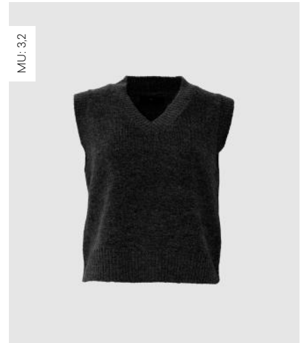
MU: 32 WBLALVA V-NECK WAISTCOAT Black | 55% Polyester, 28% Acrylic, 15% Wool, 2% Elastane RRP 49,99 EUR | WHS 15,62 EUR