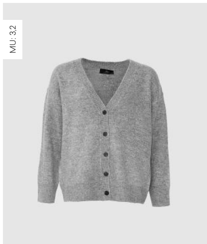
MU: 32 WBLALVA LS CARDIGAN Grey Melange | 55% Polyester, 28% Acrylic, 15% Wool, 2% Elastane RRP 69,99 EUR | WHS 21,87 EUR