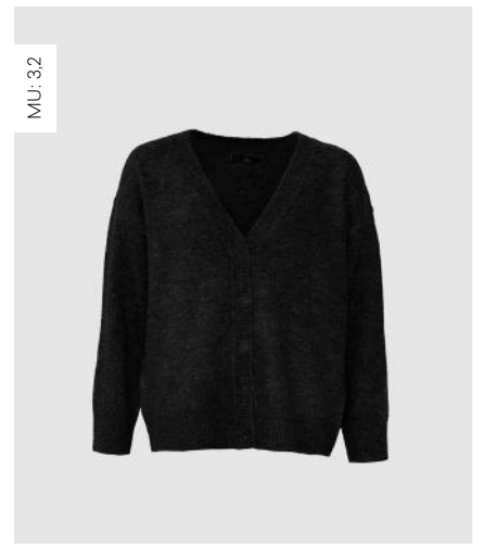
MU: 32 WBLALVA LS CARDIGAN Black | 55% Polyester, 28% Acrylic, 15% Wool, 2% Elastane RRP 69,99 EUR | WHS 21,87 EUR