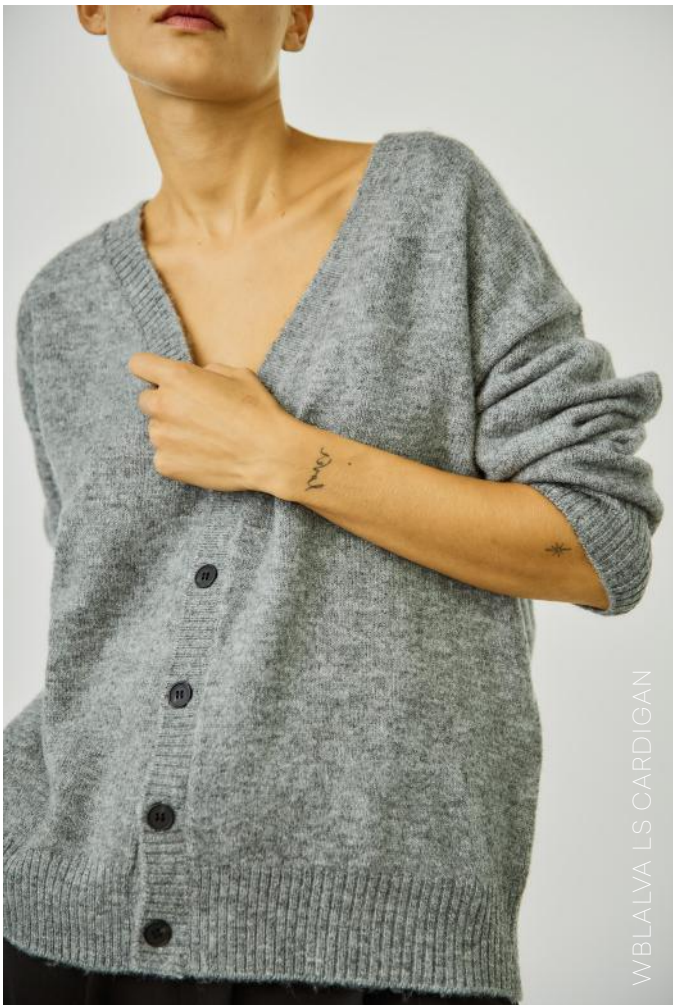
WBLALVA LS CARDIGAN