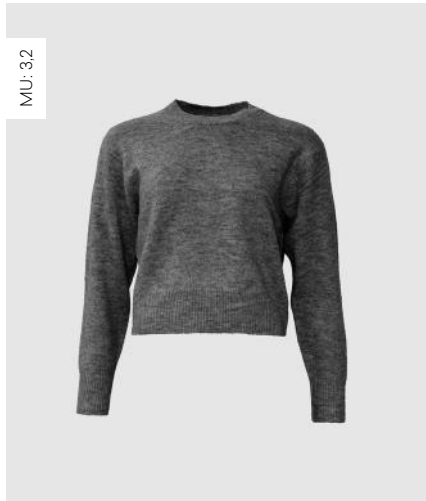
MU: 32 WBLALVA LS O-NECK PULLOVER Mid Grey Melange | 55% Polyester, 28% Acrylic, 15% Wool, 2% Elastane RRP 59,99 EUR | WHS 18,75 EUR