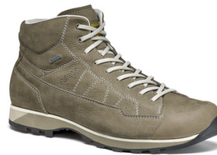
WOMAN A38027 00 A415 sage