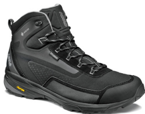
MAN A26036 00 A778 black-black