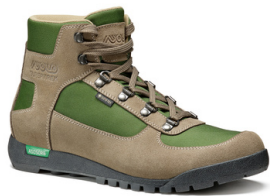
MAN A25500 00 B160 wool-garden green