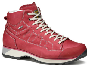
WOMAN A38027 00 A897 gerbera