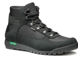
WOMAN A25500 00 A778 black-black