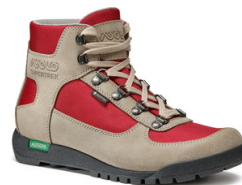
WOMAN A25501 00 B154 earth beige-chili red