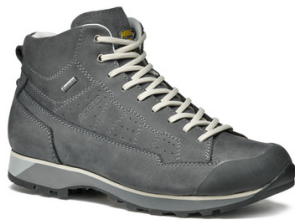
MAN A38026 00 A608 shark-grey