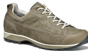
WOMAN A38029 00 A415 sage