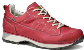
WOMAN A38029 00 A89715 gerbera