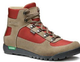
MAN A25500 00 B157 wool-black cherry