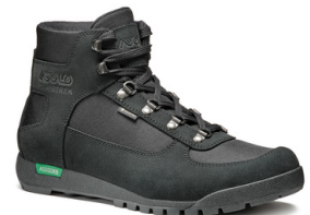
MAN A25500 00 A778 black-black