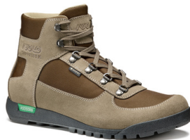
MAN A25500 00 B159 wool-desert beige