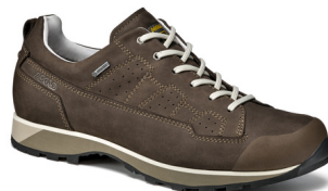
MAN A38028 00 A551 dark brown