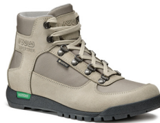
WOMAN A25501 00 B152 earth beige-beige