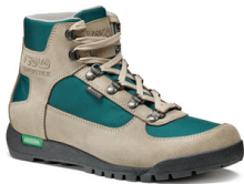
WOMAN A25501 00 B155 earth beige-deep teal