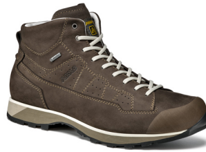
MAN A38026 00 A551 dark brown