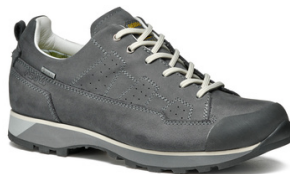
MAN A38028 00 A608 shark-grey