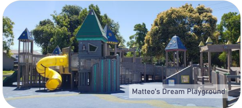
Matteo's Dream Playground