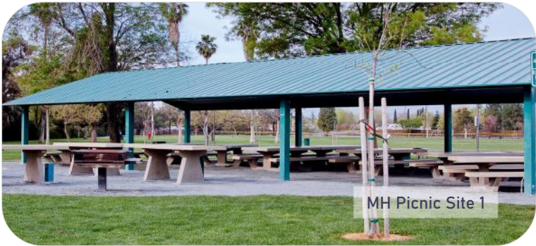
MH Picnic Site 1

Meadow Homes Park (MH) is a 12-acre park that offers a spray park featuring water play areas for tots, tweens, and teens during designated hours. Also located in the park are a playground, multi-use sports fields, and basketball courts.