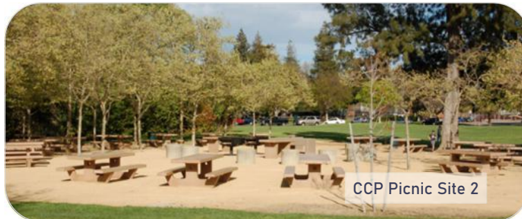
CCP Picnic Site 2