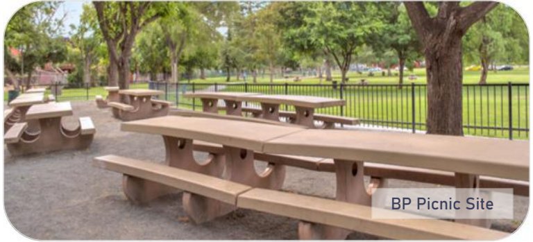
BP Picnic Site