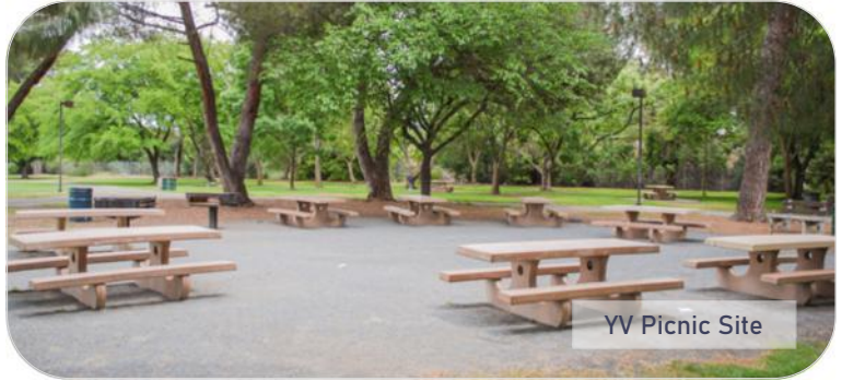
YV Picnic Site