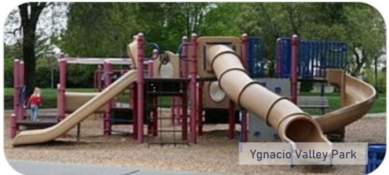
Ygnacio Valley Park