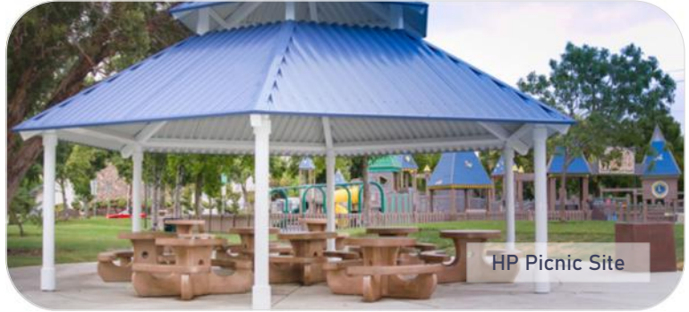
HP Picnic Site

A creek running through the park is being restored with native vegetation to stabilize the banks and re-establish the natural riparian habitat. A Korean War Memorial is located in a quiet corner of the park near a pond and redwood grove.