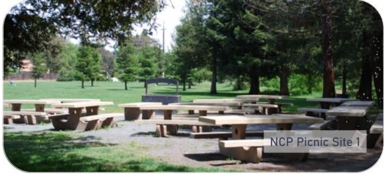
NCP Picnic Site 1

Newhall Community Park (NCP) is a 122-acre park along Galindo Creek with ball fields, ponds, dog park, a play structure, and open space trails for hiking and equestrian use.