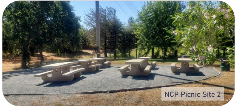
NCP Picnic Site 2