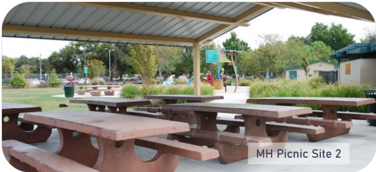
MH Picnic Site 2