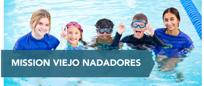
MISSION VIEJO NADADORES