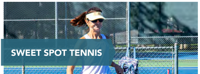
SWEET SPOT TENNIS