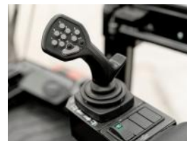
Ergonomic & Serviceable Joystick (Standard)