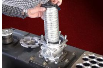
Spin-on Breather, Wire Mesh Strainer & Replaceable Internal Element (Standard)