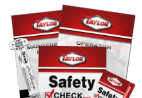
Vehicle Information Package "VIP" (Standard)