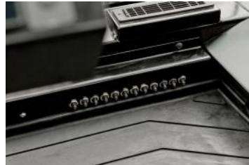
Heavy Duty Circuit Breakers/Reset Switches (Standard)