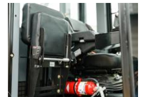
Fully Adjustable Mechanical Seat (Standard)