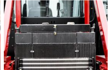
3-Section Bolted Radiator (Each section can be serviced separately)