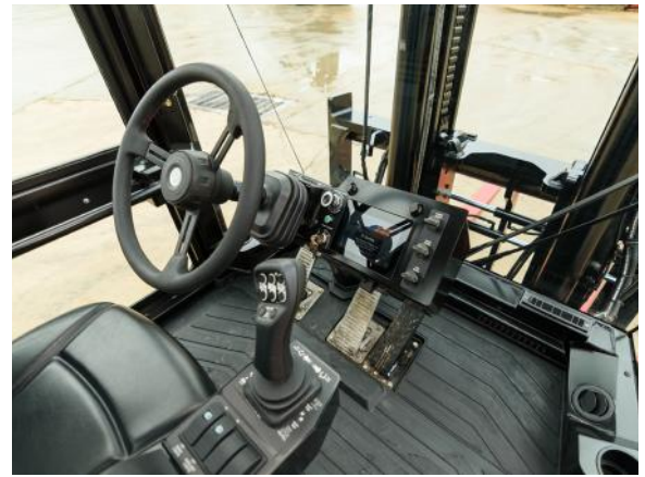
Fully Enclosed 2-Door Cab with Multiple Climate Control Configurations Available (featured cab is shown with available options)