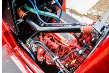
Easy Access to Drive Train & Hydraulics