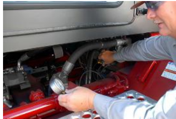
Service & Inspection from Ground Level