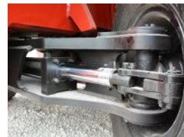
Industry's Toughest Steer Axle (Standard)