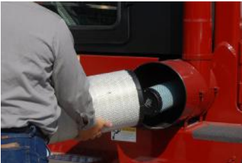
Donaldson Air Cleaner with Safety Element (Standard)