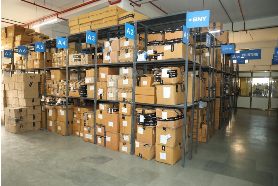
AISLE A1-A7 · MULTI-CLIENT RACKS

Client Stocking Section - Aisle-coded racking for multi-client SKUs — organised, traceable, scalable.