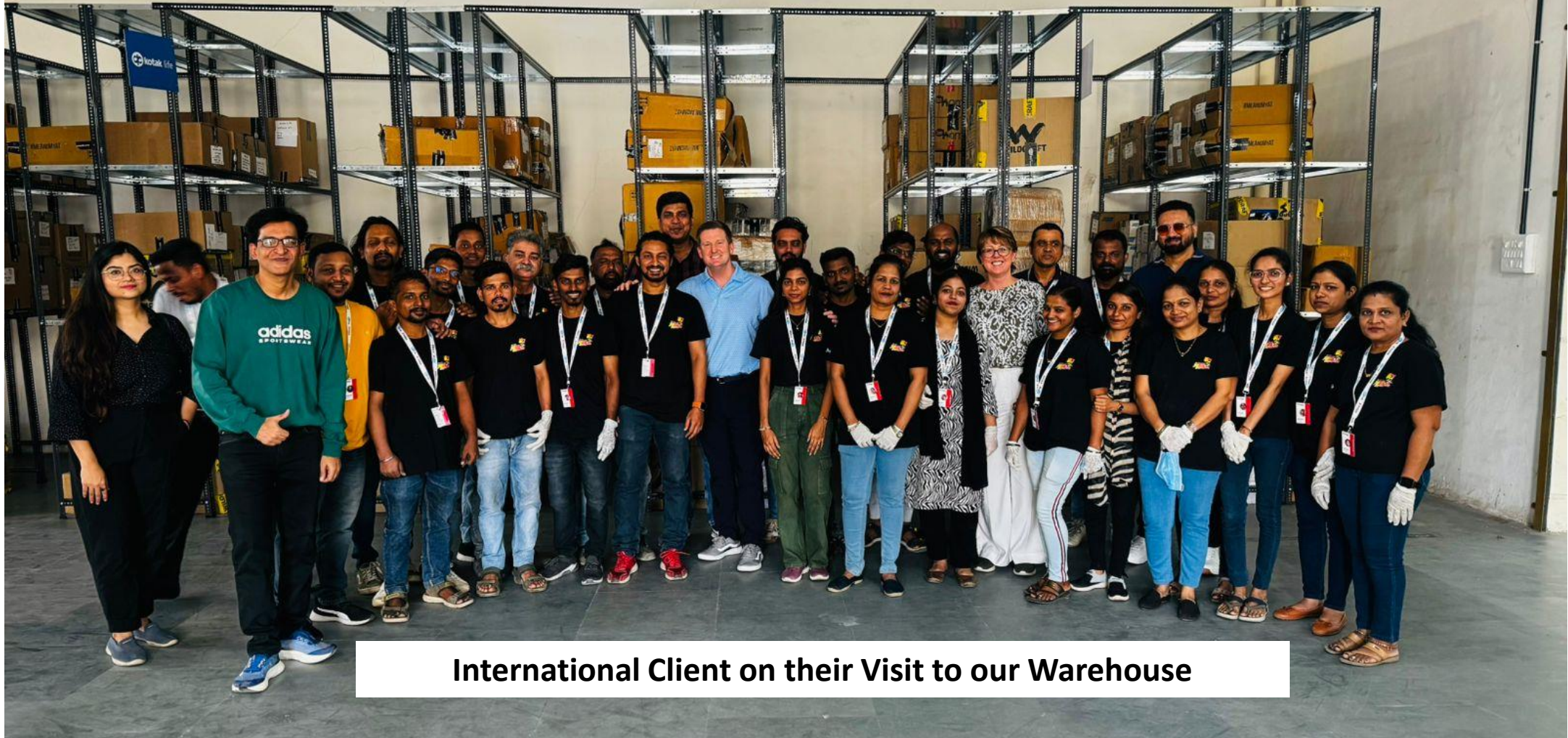
International Client on their Visit to our Warehouse

We'd love for you to see it for yourself.