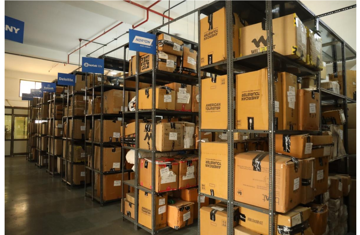
BRANDED CLIENT BAYS

"Your inventory, always within reach — organized by client, traceable by SKU, scalable by demand."