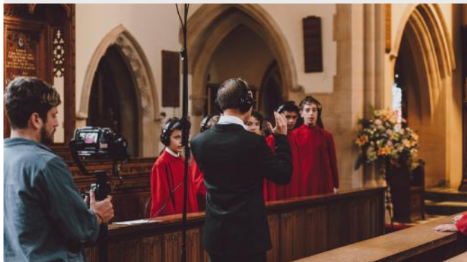
Choristers recording the Remembrance single in Chapel