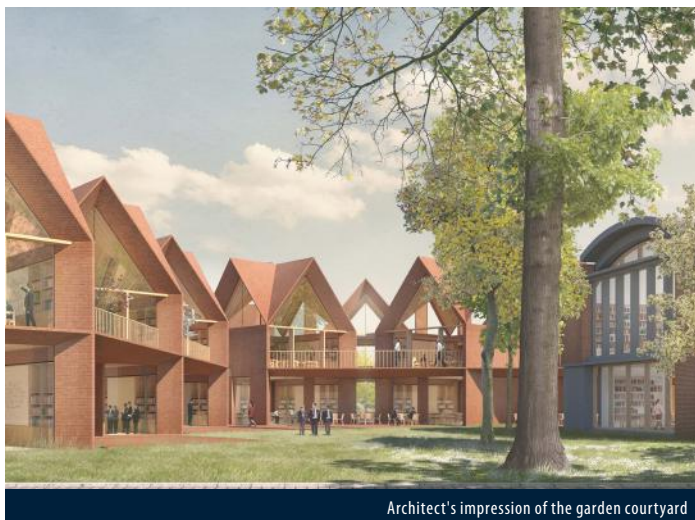
Architect's impression of the garden courtyard

We look forward to welcoming visitors to the school through a newly designed entrance and presenting this ambitious new development as early as 2025. It promises to be a modern and striking facility that embodies our commitment to prepare boys for their futures, yet one that also fittingly complements the stunning architecture of the existing estate: a future focus and proud heritage intertwined.