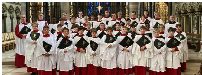
The Chapel Choir at Salisbury Cathedral