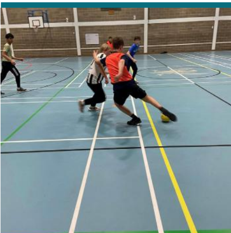
Houses compete together in the new five-a-side tournament

Visit the school website to find out more.