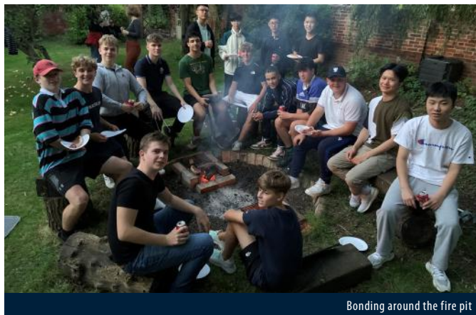
Bonding around the fire pit