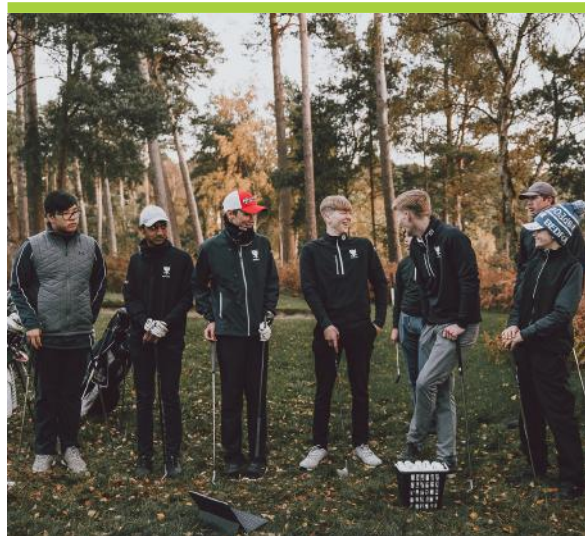
Bedford School's golf scholars