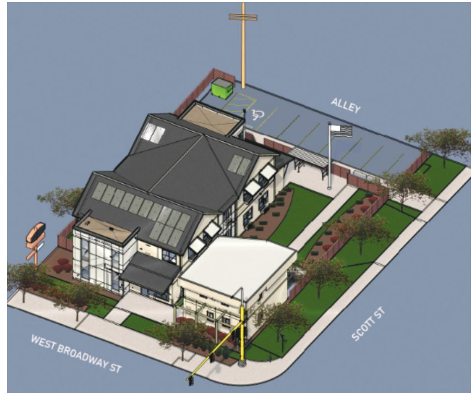
The Poverello Center in Missoula has acquired the former 17-room Clark Fork Inn on West Broadway and is planning to renovate the property and relocate its veterans housing. Above is a rendering of the planned changes to the facility, the future home of the Housing Montana Heroes program.