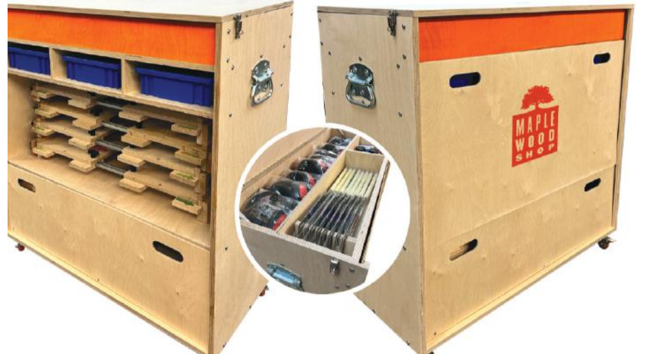
A grant from the Town Pump Charitable Foundation allowed WorkshopMT to purchase a mobile tool kit that will allow them to travel to teach woodworking skills