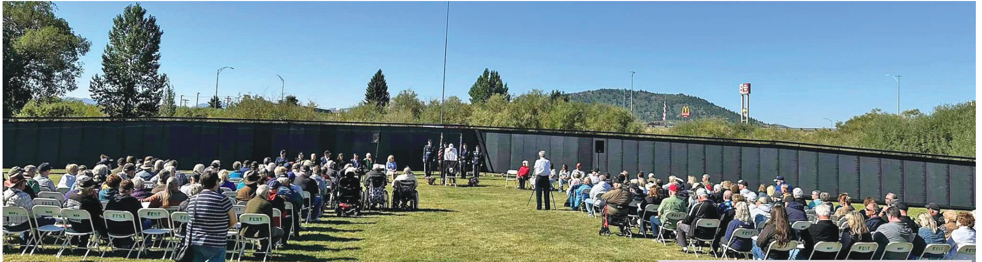
The opening ceremony for The Wall That Heals drew a huge crowd of veterans, their families and other supporters

Thousands of people from our region and from across the country experienced the solemn but uplifting aura that The Wall That Heals brought to Butte Aug. 28 to Sept. 1.