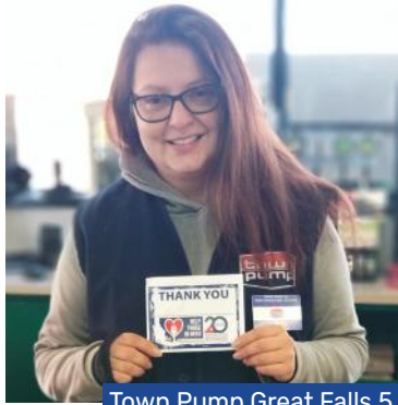
Town Pump Great Falls 5