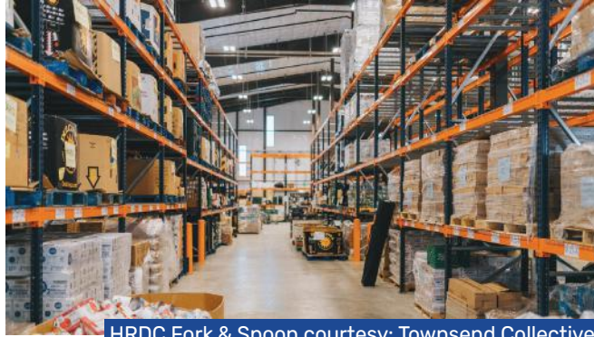
HRDC Fork & Spoon