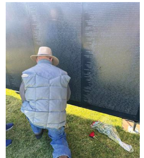
A visitor kneels to get a closer look at names on The Wall That Heals in Butte