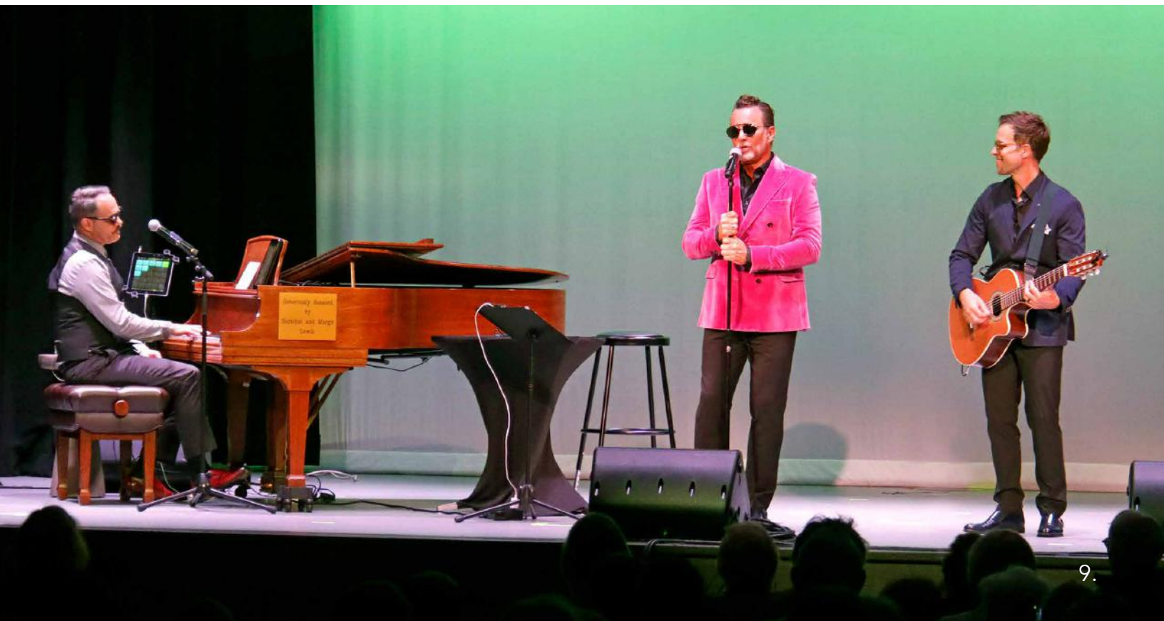
The Undercovers on stage in their performance of Richie, Rogers and Robinson.

Well done Undercovers. Thanks for the journey back in time to the songs we fondly remember.