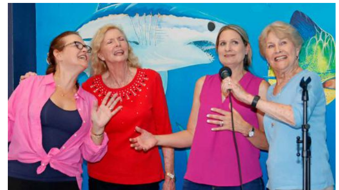
Karaoke Night at JKV: Page 14.