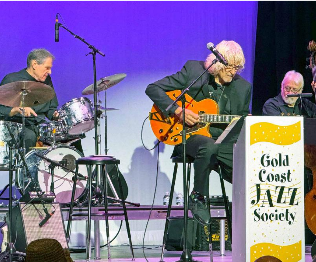
The Gold Coast Jazz Society