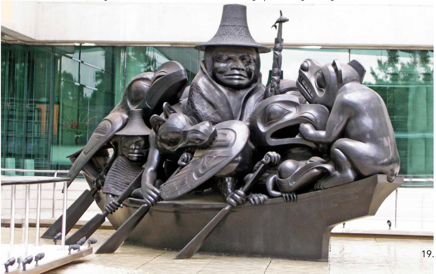
Spirit of Haida Gwaii, the Black Canoe, by Bill Reid, outside the Canadian Embassy in Washington, D.C.

Want to learn more about what John Knox Village has to offer? Contact us today to take a tour, or for a no-pressure conversation with one of our Life-Plan Consultants. Call 954-871-2655.