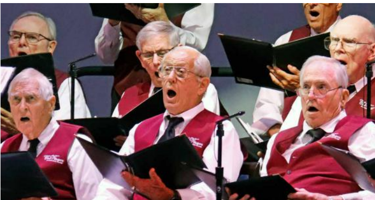
JKV Choirs Spring Concert: Page 10.