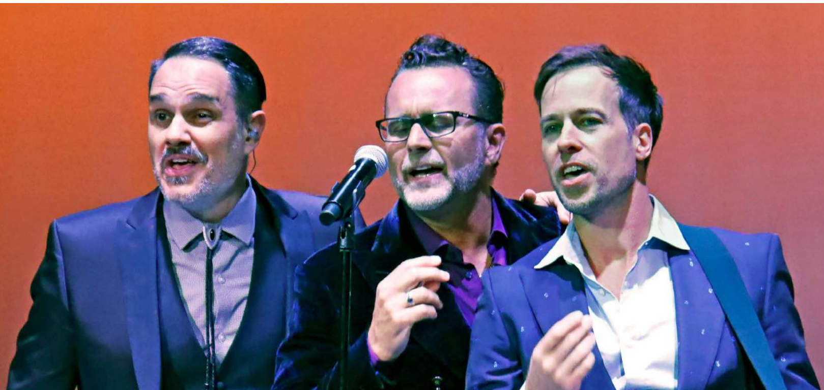
The Undercovers, a trio of talented Canadian singers on stage at the Cultural Arts Center.

The Undercovers Reprise Hits from Three Great Vocalists