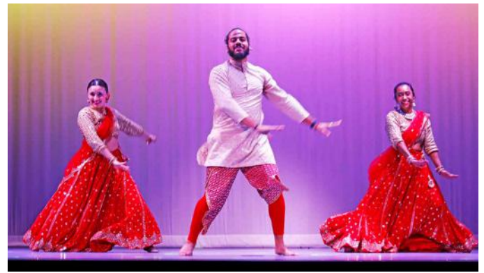
Hooray for Bollywood: Page 12.

The John Knox Village Gazette ACE (Arts • Culture • Entertainment) is published on ODD-NUMBERED months in an easy-to-read horizontal digital magazine format. The Gazette ACE focuses on Arts, Culture and Entertainment, not only at JKV, but in South Florida as well. The Gazette ACE is a publication of John Knox Village, 651 SW 6th St., Pompano Beach, FL 33060.