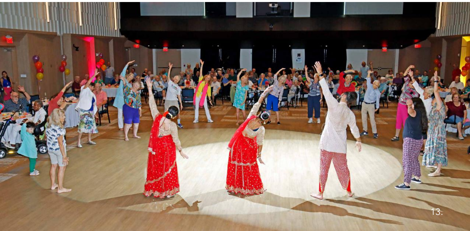
JKV residents join with the Nara Bollywood Dance Academy staff to learn some traditional Indian moves.

From all appearances, JKV residents have found a new cultural love for all things Bollywood. For more information visit: www.narabollywood.com