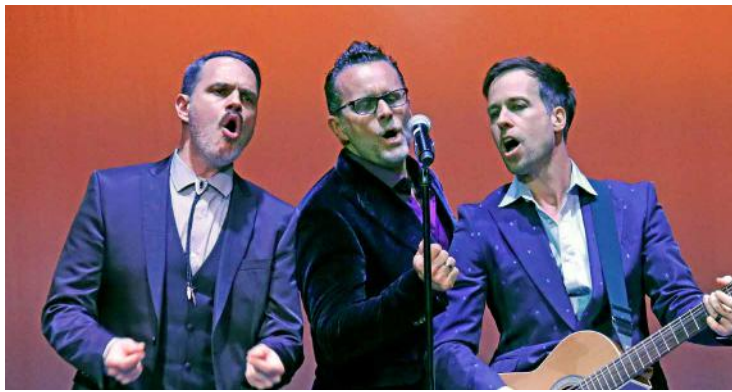
Richie, Rogers and Robinson: Page 8.