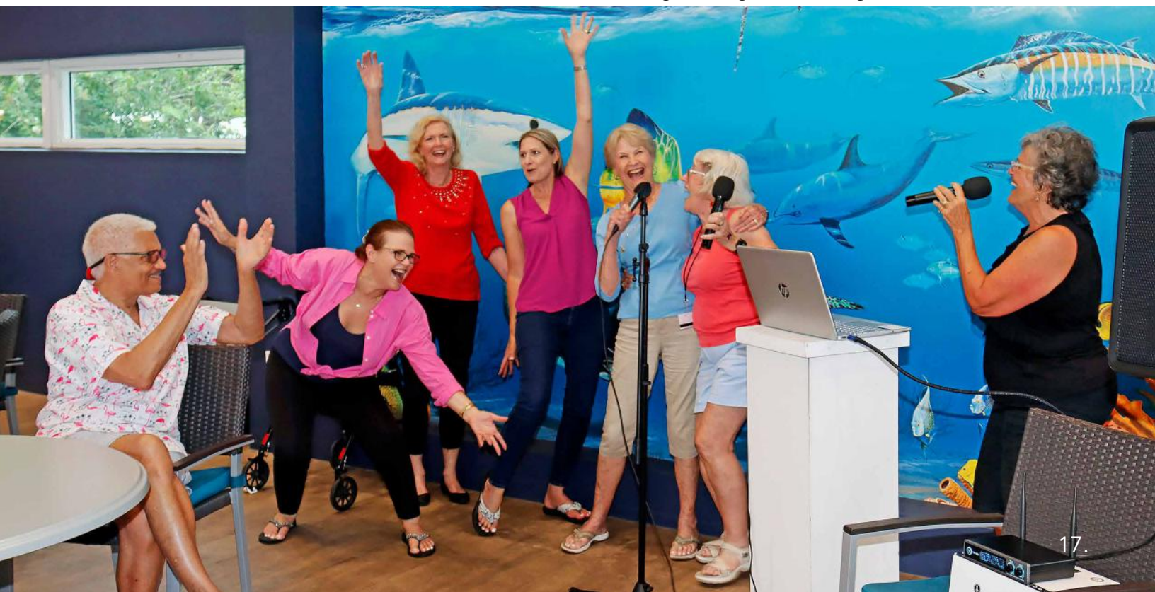
The Prat ladies and friends take over the stage during Karaoke Night.