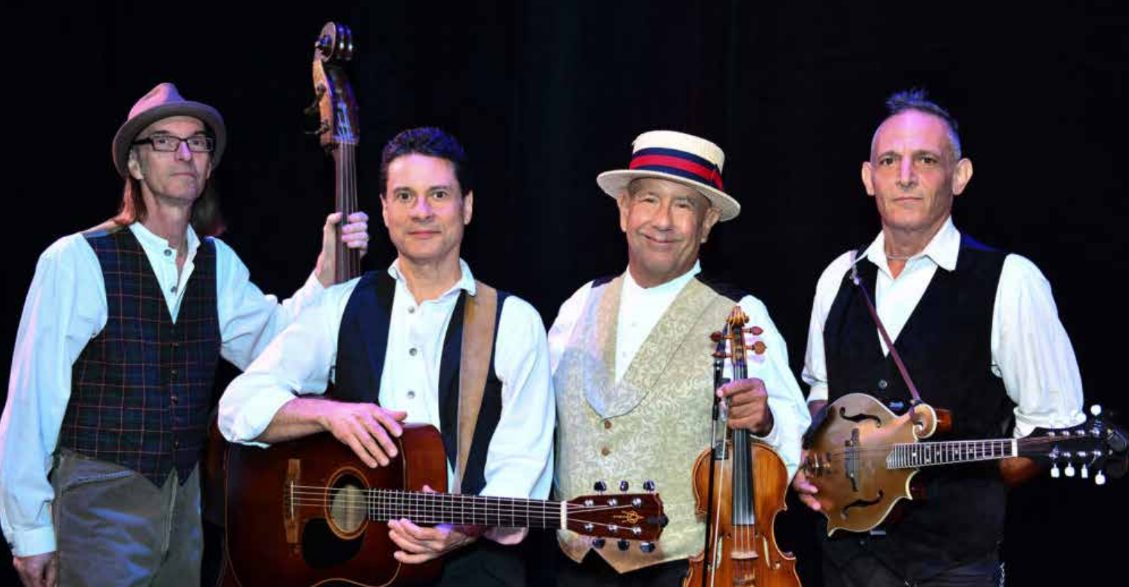
The Rambling String Band will perform a special Independence Day concert in the JKV Cultural Arts Center.