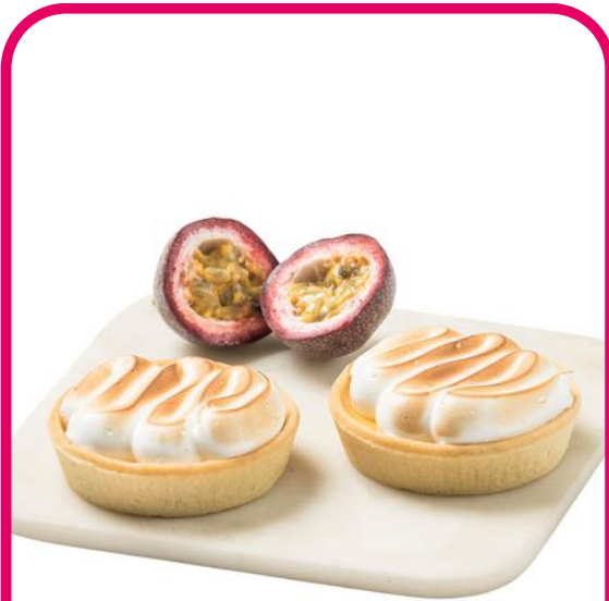
Passionfruit Meringue ☀️

An apple and raspberry custard filling decorated with golden crumble baked in a small crispy butter shortbread tart.