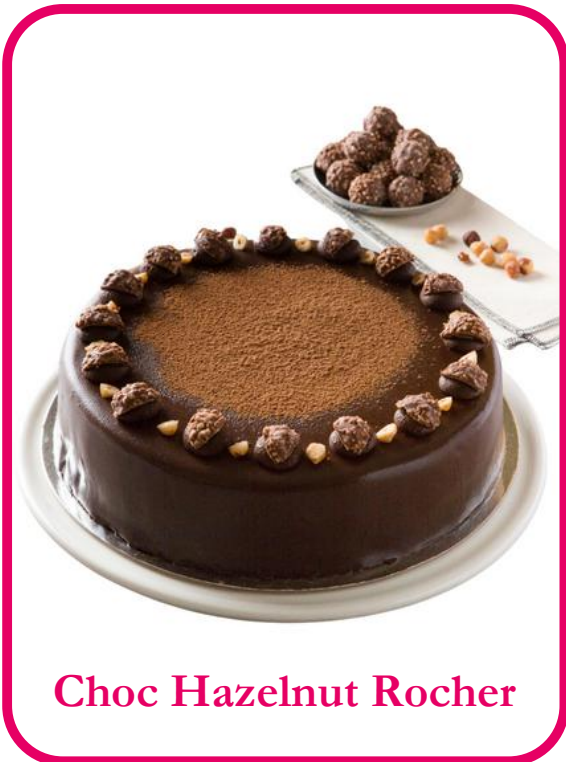
Choc Hazelnut Rocher

Our signature chocolate mud cake layered with chocolate mousse and caramel and finished with smooth chocolate ganache and a piped chocolate and caramel border.