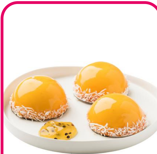
Mango Passionfruit Dome

Coffee mousse filled shortbread tart, with a Biscoff mousse dome, and topped with Biscoff spread, white chocolate drizzle, and a Biscoff cookie.