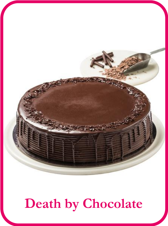
Death by Chocolate

Chocolate lovers rejoice with our popular decadent chocolate mud cake covered in dripping chocolate ganache and shavings.