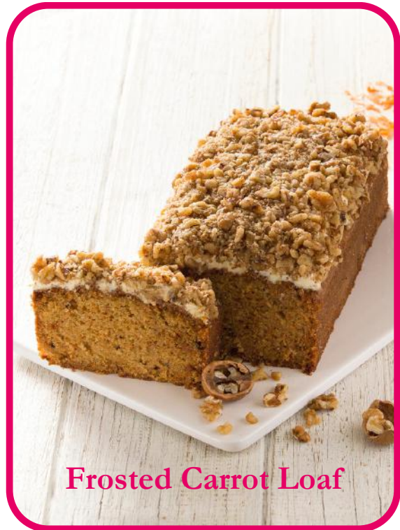
Frosted Carrot Loaf

A traditional moist and sweet banana bread loaf infused with a generous serving of fresh banana.