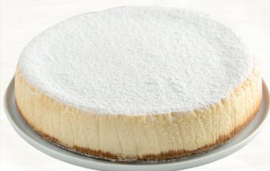
New York 🚫

An irresistible baked flourless tangy lemon cheesecake made with Neufchâtel cream cheese and decorated with lemon curd and piped cream cheese.