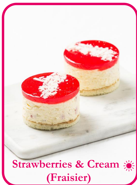
Strawberries & Cream ☀ (Fraisier)

Smooth vanilla cream swirled with Oreo biscuit pieces and decorated with a cream rosette and an Oreo biscuit.