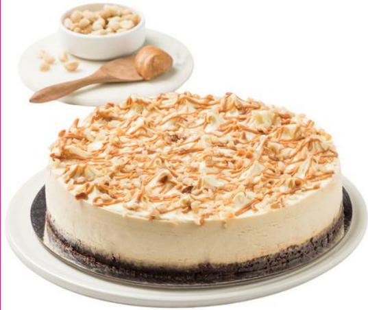
Caramel Macadamia 🚫

A baked flourless caramel flavoured cheesecake on a fine chocolate biscuit base garnished with a caramel drizzle and roasted macadamia crumble.