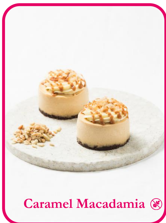
Caramel Macadamia 🚫

Setting the trend with a baked flourless caramel flavoured cheesecake on a fine chocolate biscuit base garnished with a caramel drizzle and roasted macadamia nuts.