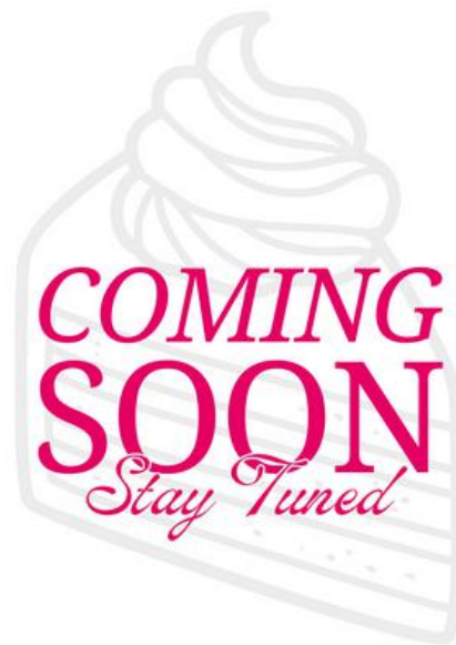
Exciting new products

A classic black forest cake combining layers of chocolate sponge and vanilla cream with maraschino cherry filling and chocolate flakes.