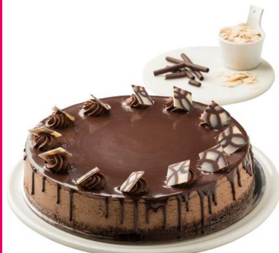
Toblerone 🚫 ☀️

Traditionally baked flourless smooth and creamy cheesecake made with premium Neufchâtel cream cheese and finished in the classic New York style with snow sugar.