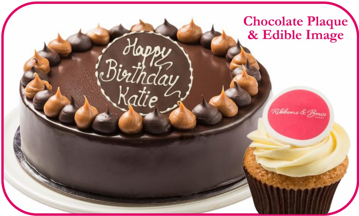
Chocolate Plaque & Edible Image

Create a personalised message on a cake with a chocolate plaque and white chocolate writing or an edible image on icing paper - perfect for any business, social or other celebration event.