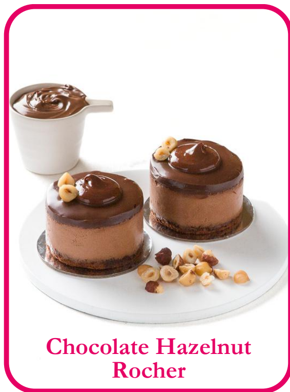
Chocolate Hazelnut Rocher

Classic creamy chocolate mousse finished with chocolate ganache and creamy chocolate rosette.