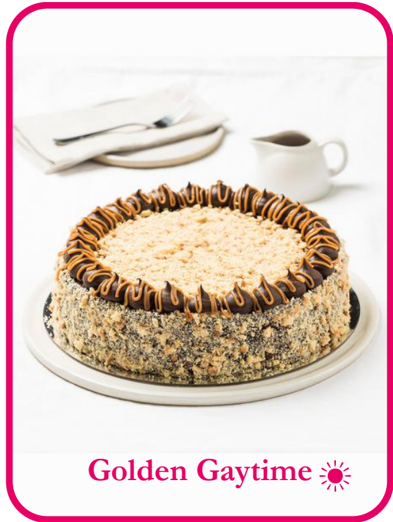
Golden Gaytime ☀

The ultimate indulgence of moist red velvet mud cake and smooth Neufchâtel cream cheese sprinkled with red velvet crumble.