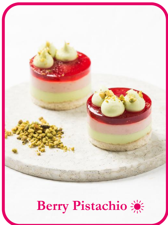
Berry Pistachio ☀

A colourful trio of creamy pistachio mousse, raspberry mousse and sparkling raspberry glaze on a soft vanilla sponge base topped with pistachio crunch.