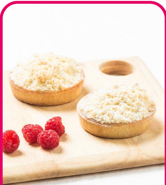
Apple Raspberry Crumble

An apple and raspberry custard filling decorated with golden crumble baked in a small crispy butter shortbread tart.