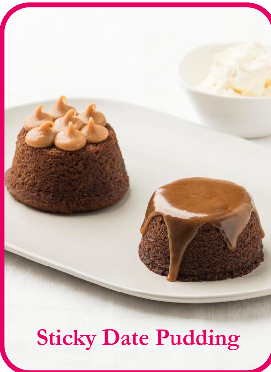
Sticky Date Pudding

A moist raspberry infused cake with a clear glazed top and finished with raspberry compote and crushed pistachios.