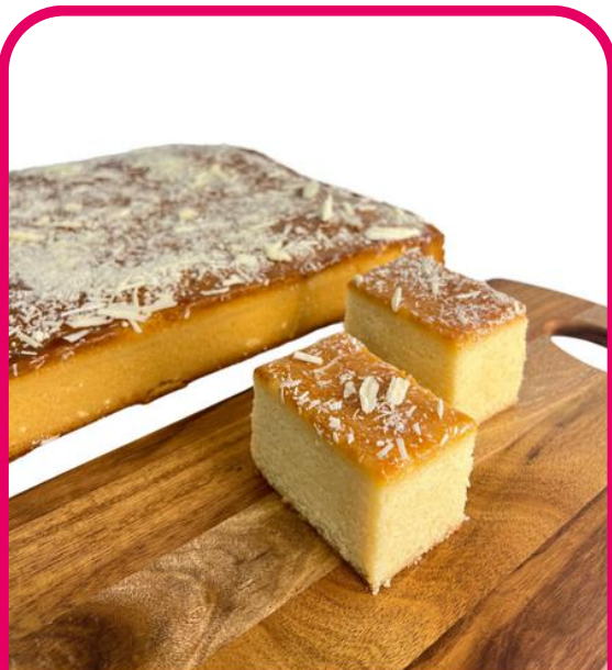
Lemon White Chocolate

A delightful white chocolate mud cake finished with a zesty lemon glaze and white chocolate flakes.