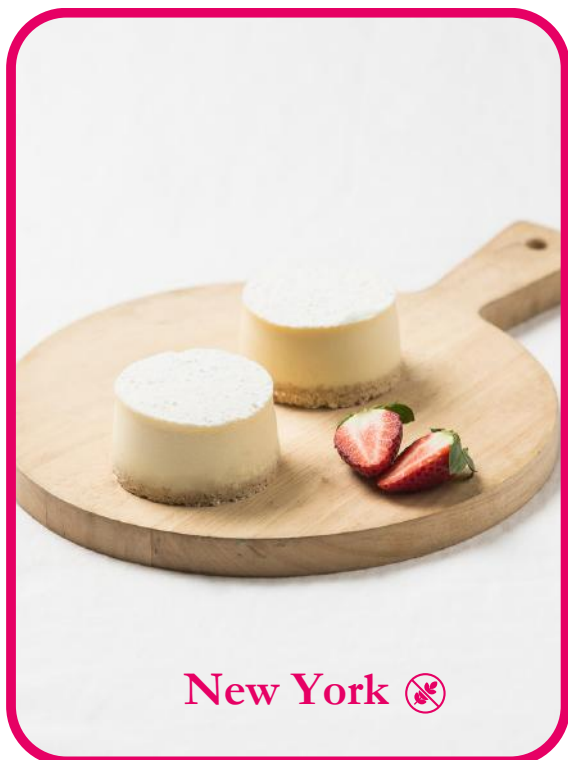
New York 🚫

A traditional baked flourless New York style creamy cheesecake made with Neufchâtel cream cheese, and dusted with snow sugar.