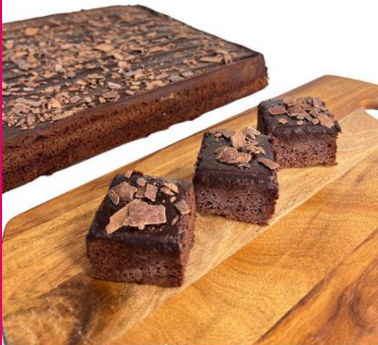
Death by Chocolate

A moist flourless glazed orange cake with toasted almond flakes.