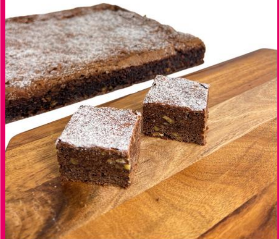
Choc Walnut Brownie

A classic indulgence of chocolate mud cake coated with dark chocolate ganache and chocolate shavings.