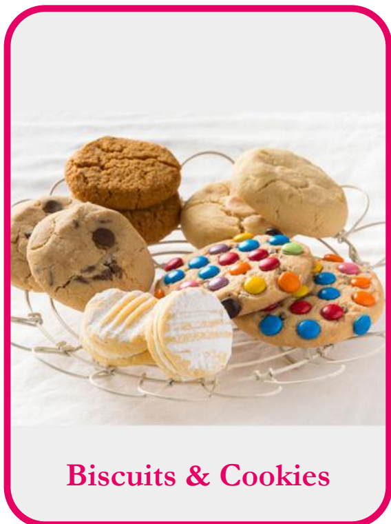
Biscuits & Cookies

Delicious strawberry or chocolate dipped moist sponge filled with a layer of raspberry jam and smothered in shredded coconut.