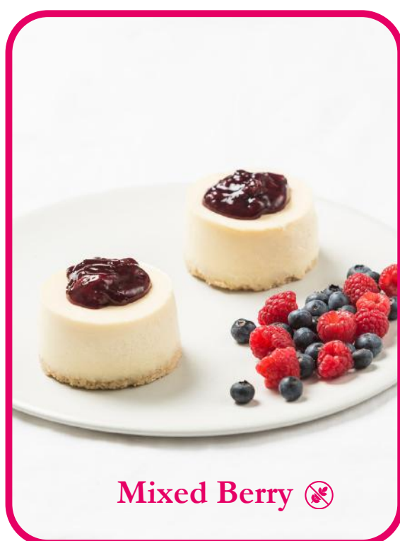
Mixed Berry 🚫

Setting the trend with a baked flourless caramel flavoured cheesecake on a fine chocolate biscuit base garnished with a caramel drizzle and roasted macadamia nuts.