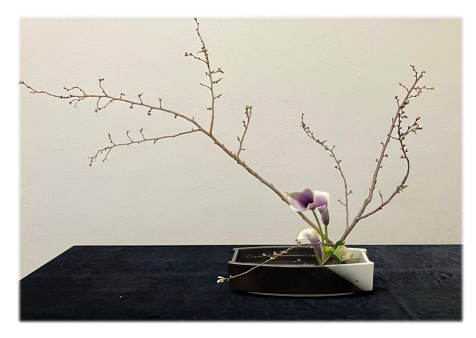
Cherry blossom branches and calla lilies are arranged at precise angles, showcasing the beauty of simplicity and negative space in the arrangement.

Ikebana is the Japanese art of floral arrangement. It is characterized by its minimalist and harmonious compositions while emphasizing balance, simplicity, and the appreciation of natural beauty. Ikebana arrangements often incorporate elements such as line, form, and space to create striking visual expressions that reflect the changing seasons and invoke a sense of tranquility.