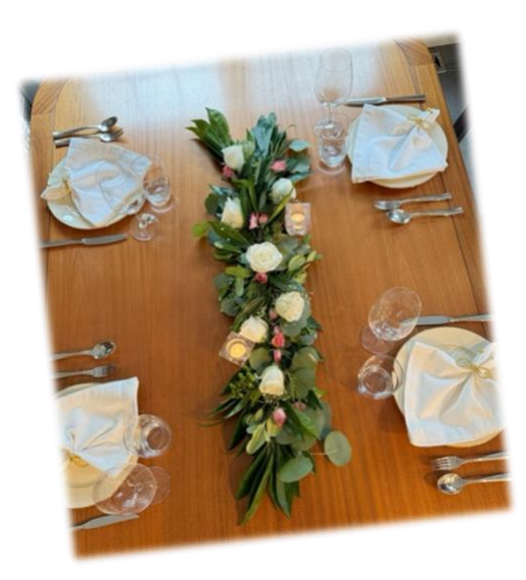
This garland is intricately wired with eucalyptus, wax flower stems, hypericum berries, and gypsophila, topped off with lovely white