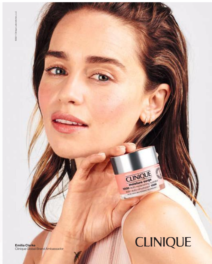
Emilia Clarke Clinique Global Brand Ambassador

The product packaging does not contain cellophane.