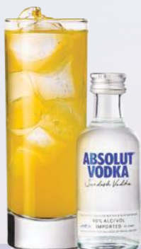
Vodka & Orange €9.50