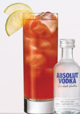
Bloody Mary €9.50