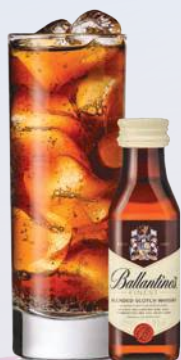
Whisky & Coke €9.50