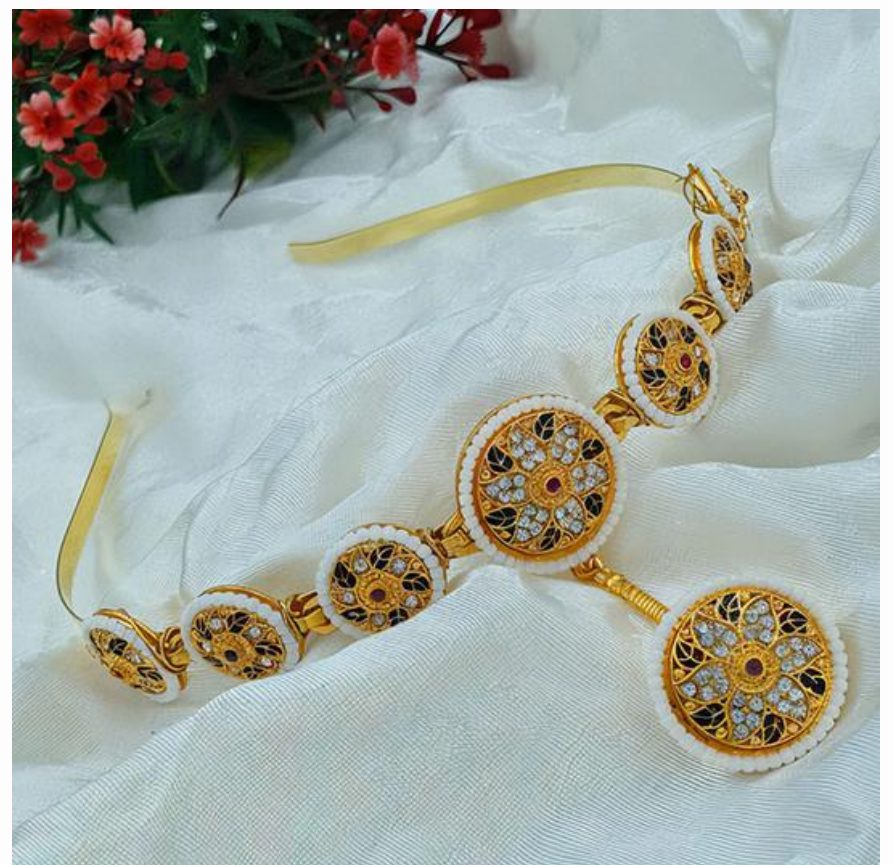
FANCY HAIR BAND