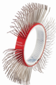
BRISTLE BLASTER® BELT, STAINLESS STEEL, 11 MM