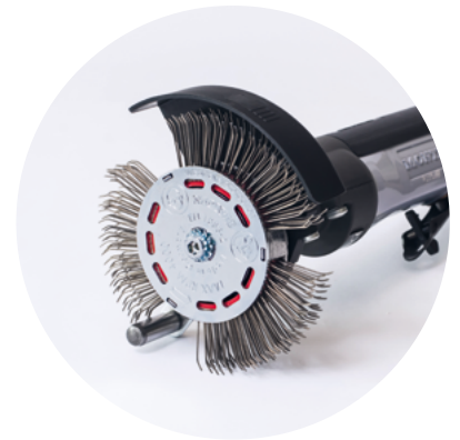
BRISTLE BLASTER® AXIAL