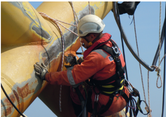
Bristle Blaster® on an offshore platform

Absolutely Gründlich stands for a thorough and sustainable long-term protection of your assets. MontiPower®-preparation from scratch!