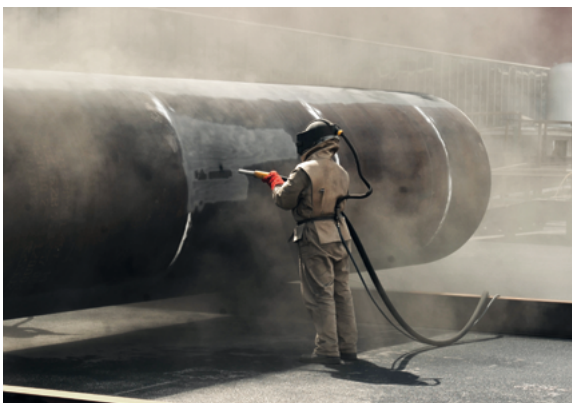
Conventional grit blasting