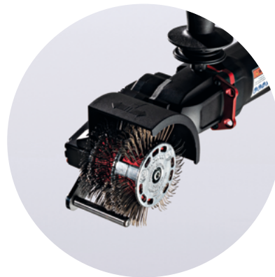
BRISTLE BLASTER® DOUBLE