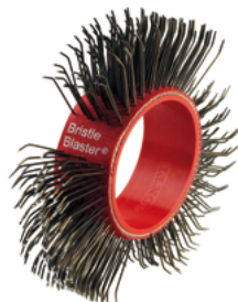
BRISTLE BLASTER® BELT, STEEL, 23 MM