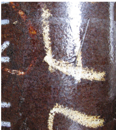
API 5L Piping