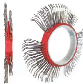
BRISTLE BLASTER® AXIAL BELT, STAINLESS STEEL, 11 MM, RIGHT