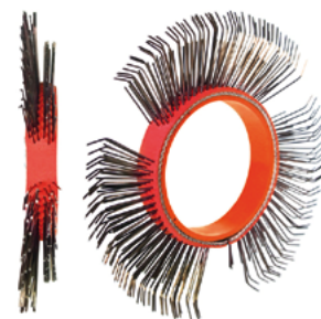
BRISTLE BLASTER® AXIAL BELT, STEEL, 11 MM, RIGHT