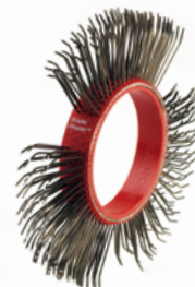
BRISTLE BLASTER® BELT, STEEL, 11 MM