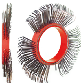
BRISTLE BLASTER® AXIAL BELT, STEEL, 11 MM, LEFT