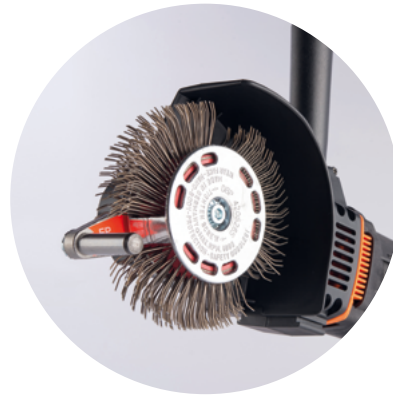
BRISTLE BLASTER® ELECTRIC