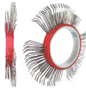
BRISTLE BLASTER® AXIAL BELT, STAINLESS STEEL, 11 MM, LEFT