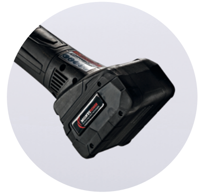
BRISTLE BLASTER® CORDLESS