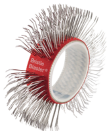
BRISTLE BLASTER® BELT, STAINLESS STEEL, 23 MM