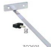
302691 Guide Optional Accessory