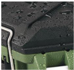
IP65 Water & Dust Protection

MULTI CRUISER is an interchangeable and interlocking modular storage system that's versatile, customisable and makes transporting of tools and equipment easy. MULTI CRUISER is constructed from rugged impact resistant material to withstand harsh environments and designed to provide users extra flexibility and tool protection. MULTI CRUISER offers a growing range of inner trays, cases, and accessories to support a wide range of configurations to suit your storage transportation requirements.