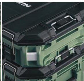
Quick Secure Stacking Latches

Creates a water tight seal against dust, soil, water and rain