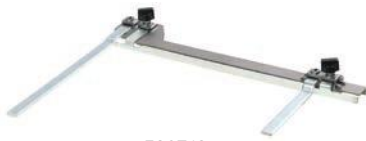
380742 Guide Rail Adaptor Optional Accessory