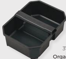
379494 Organiser Tray