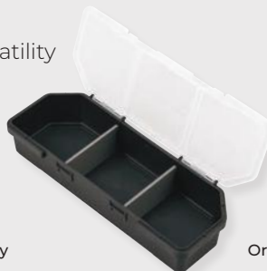
379495 Organiser Case