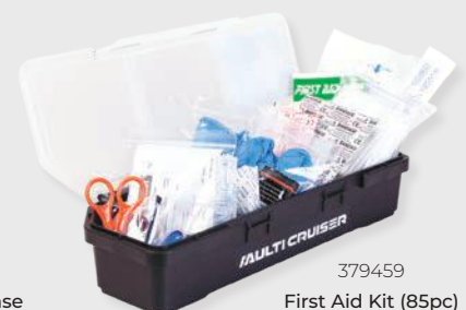
379459 First Aid Kit (85pc)