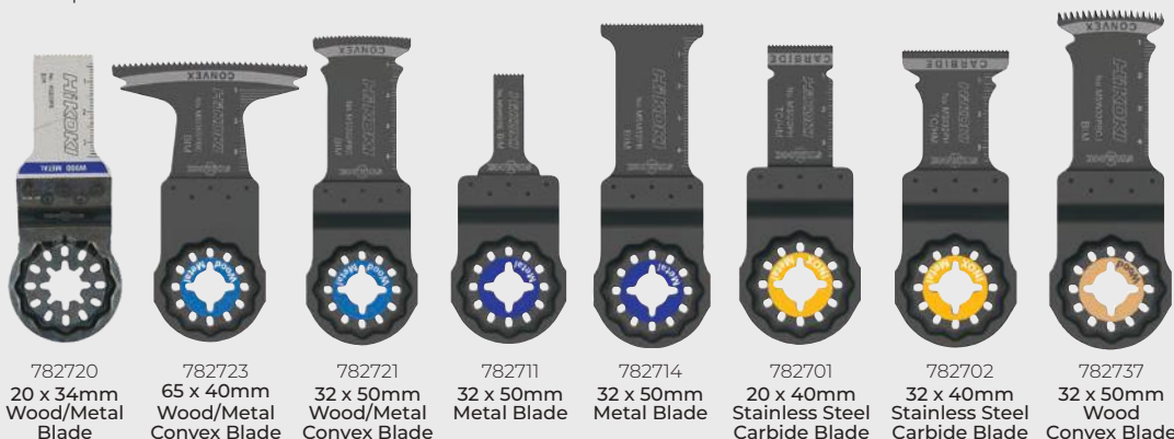
782720 20 x 34mm Wood/Metal Blade

Compatible with HiKOKI CV18DBL & CV18DA Multi Tools.