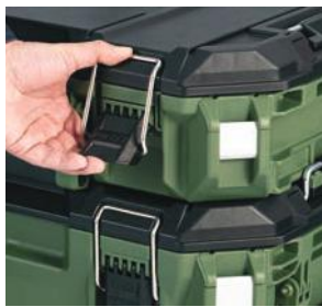
Heavy-duty Large Latch System

Durable construction designed to protect contents against harsh elements