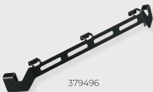
379496 Tool Hooking Rail

Accessorise your Multi Cruiser Storage to maximise versatility