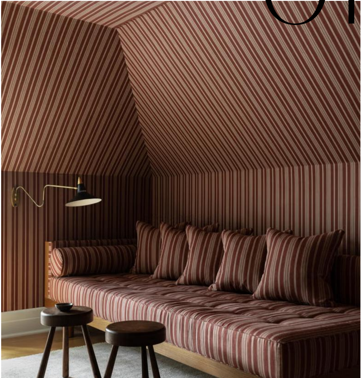
Wendy Labrum, Photographed by Aimee Mazzenga