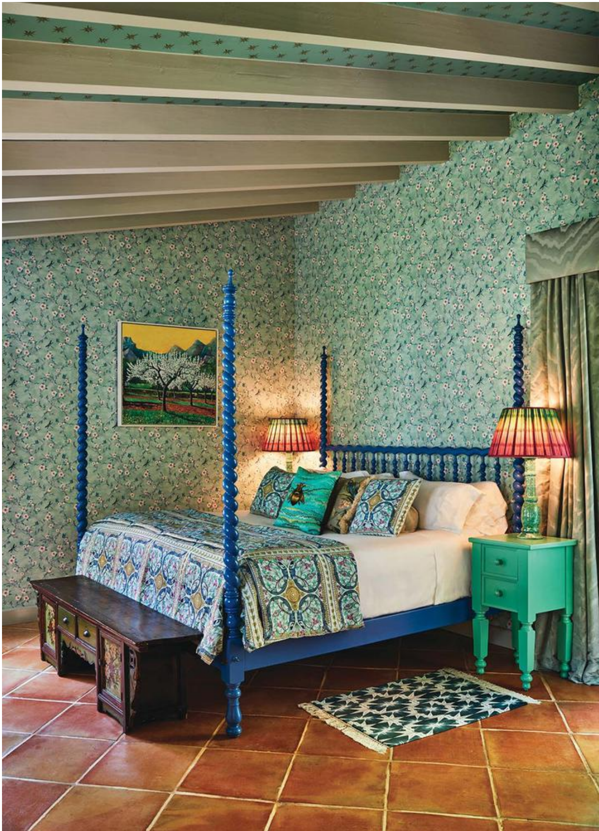
Matthew Williamson, Belmond La Residencia