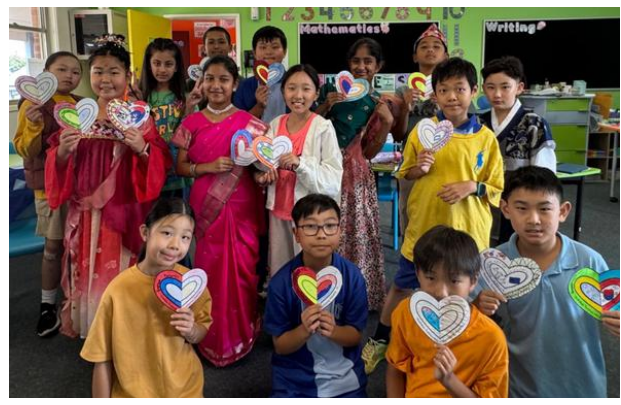
Images: Above, students in 'Magnetic Island' celebrate Harmony Day. Below, Construction of the new GWPS Preschool started this term.