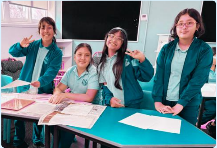
Image: GWPS Students were excited to return to school for 2026

Welcome to the new pre-school. Teachers said that they took a quarter of the grass space in the 3-6 playground to make space for the preschool.