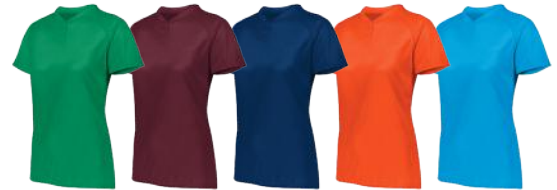
KELLY 030 MAROON 745 NAVY 065 ORANGE 029 POWER BLUE 812