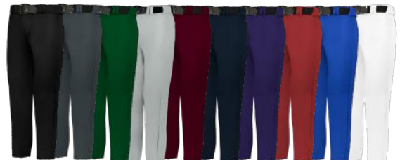
BLACK B080 CHARCOAL SOLID F488 FOREST F005 GREY F489 LIGHT MAROON F491 NAVY F010 PURPLE F012 RED F013 ROYAL F014 WHITE B005