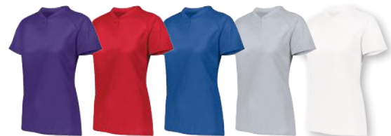
PURPLE 747 RED 040 ROYAL 060 SILVER 099 WHITE 005