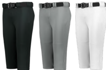
BLACK B080 GREY F489 WHITE B005