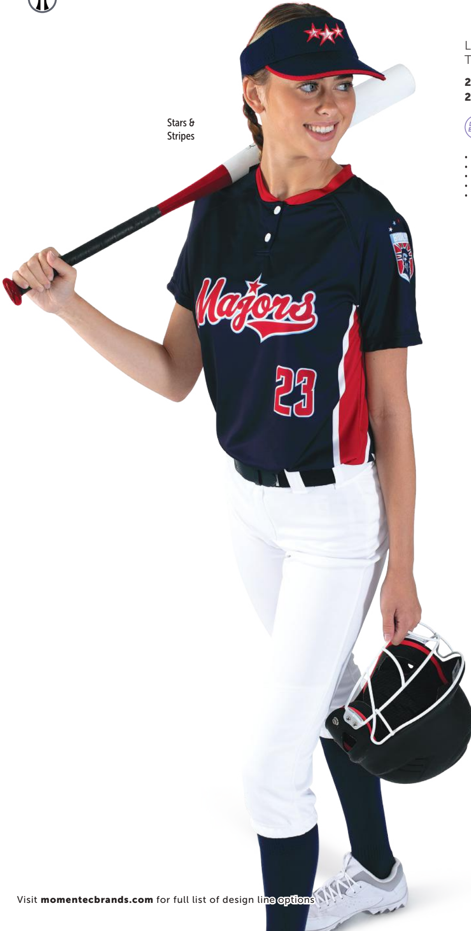
Stars & Stripes