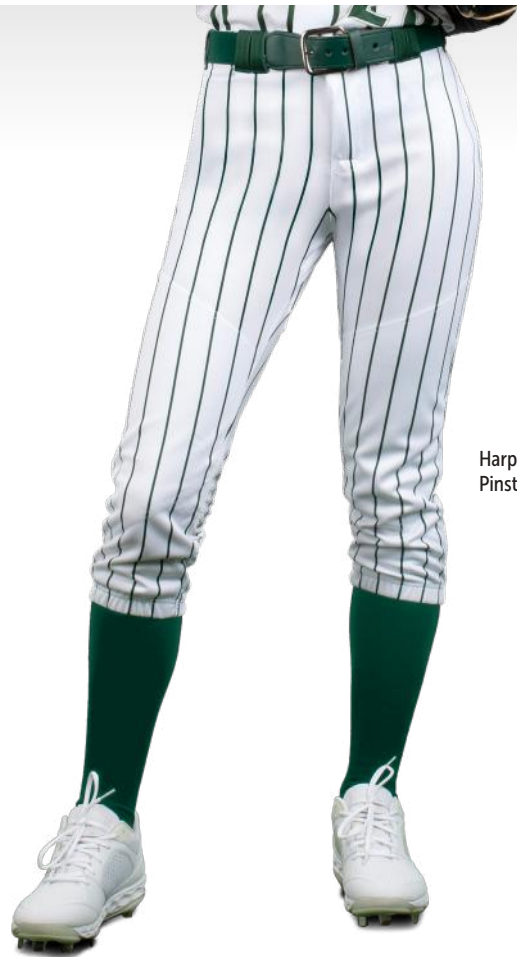
Harper Pinstripe 1