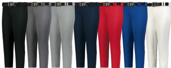
BLACK B080 CHARCOAL F488 GREY F489 NAVY F010 RED F013 ROYAL F014 WHITE B005