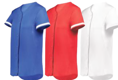
ROYAL/ WHITE 280