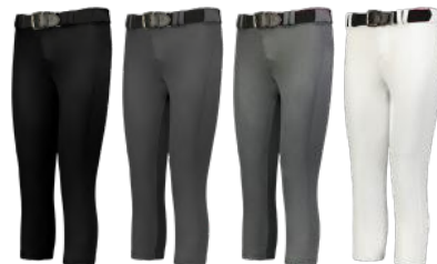
BLACK B080 CHARCOAL F488 GREY F489 WHITE B005