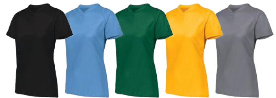
BLACK 080 COLUMBIA BLUE 089 DARK GREEN 035 GOLD 025 GRAPHITE 059