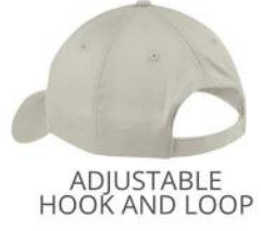
ADJUSTABLE HOOK AND LOOP