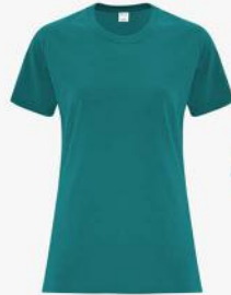
Side seamed Contoured fit Classic fit