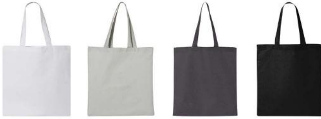
WHITE GREY CHARCOAL BLACK