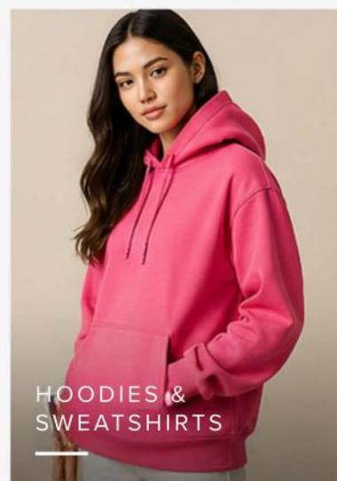
HOODIES & SWEATSHIRTS