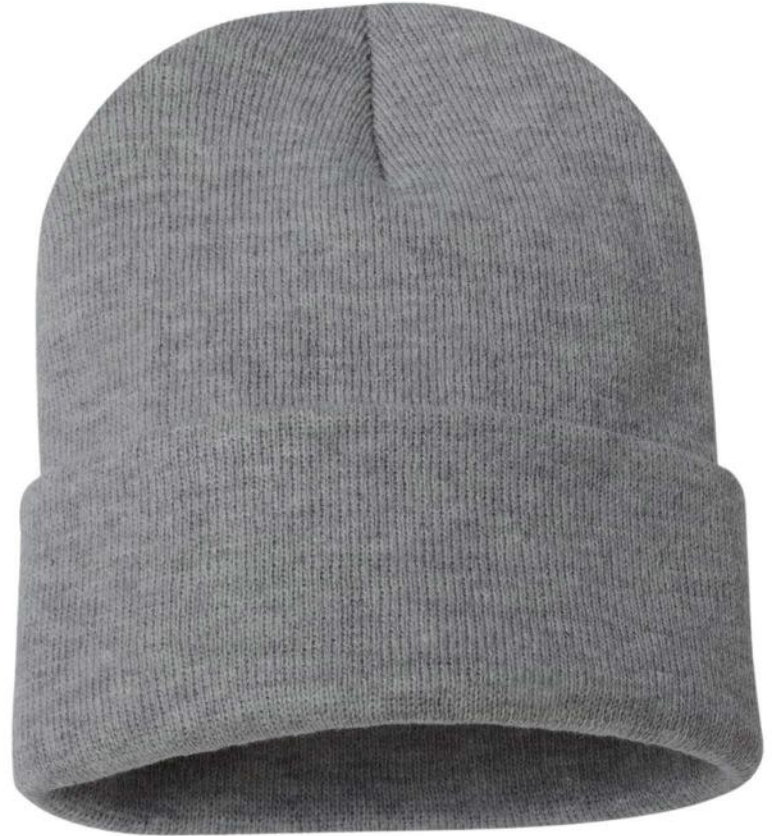
DARK HEATHER GREY