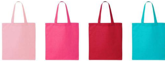
LIGHT PINK HOT PINK RED TURQUOISE