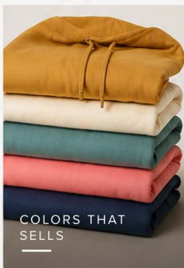
COLORS THAT SELLS