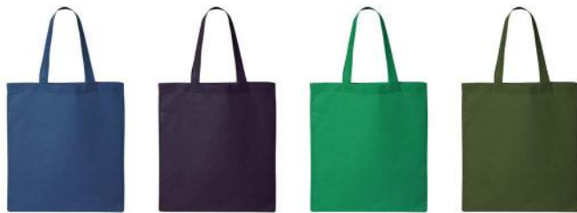
ROYAL NAVY KELLY GREEN FOREST