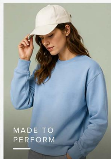
MADE TO PERFORM