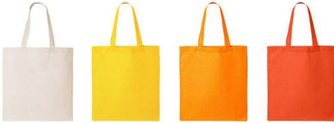
NATURAL YELLOW GOLD ORANGE