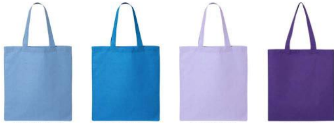
CAROLIGNA BLUE SAPPHIRE LAVENDER PURPLE