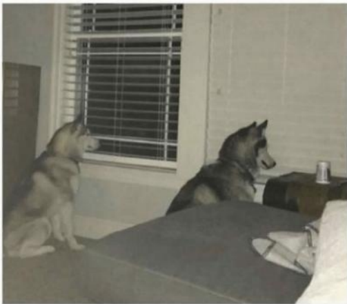
One of my dogs is smarter than the other