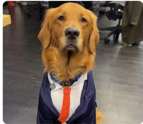
"I did the math. We can buy more treats."