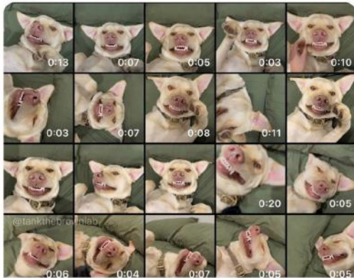
iPhone: storage is full Me: Full already? HOW?! My camera roll: