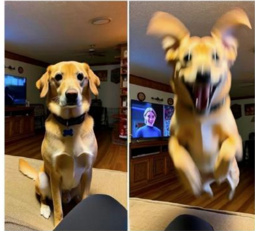
do you wanna go for a w—