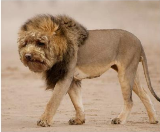
How my dog feels hunting squirrels in the backyard