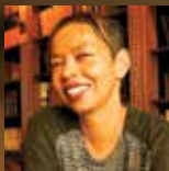
Michelle de Kretser