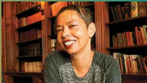
Michelle de Kretser