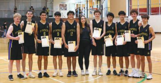
The 17 C Basketball team following their ISA win.