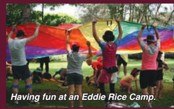
Having fun at an Eddie Rice Camp.