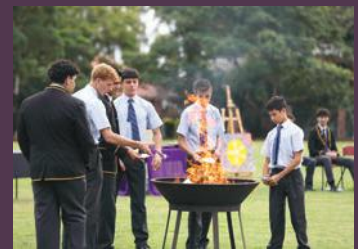
Burning our Lenten promises ready for a new start.