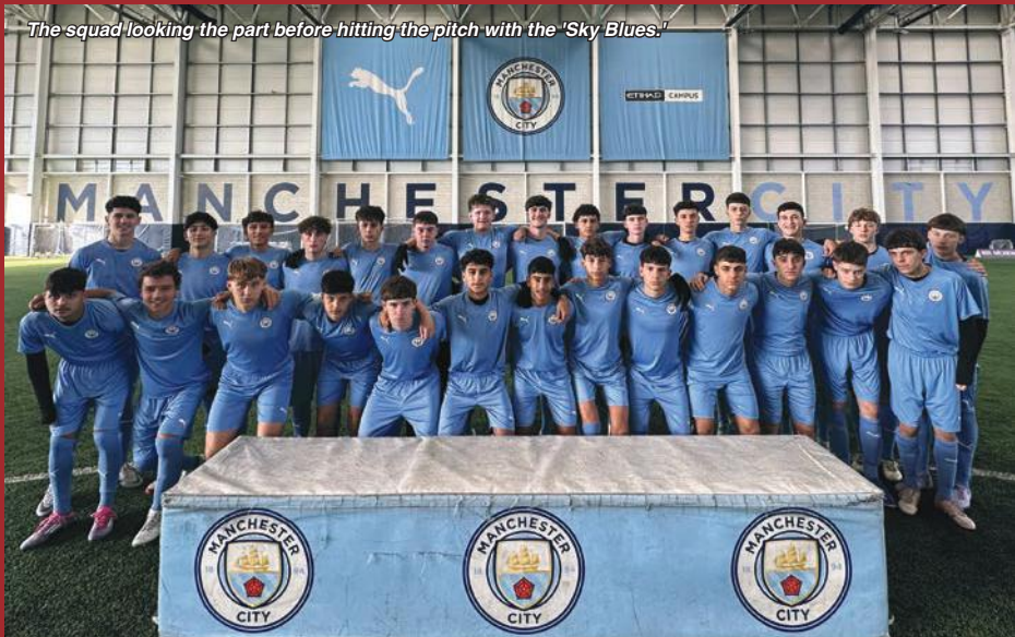
The squad looking the part before hitting the pitch with the 'Sky Blues.'