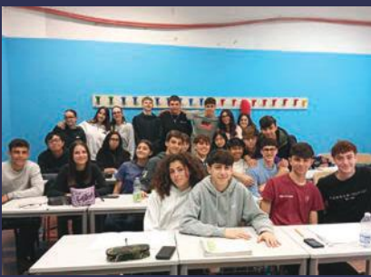
Our boys begin their immersion at school in Reggio, Calabria.