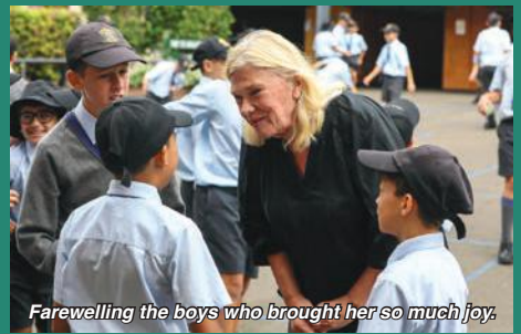
Farewelling the boys who brought her so much joy.