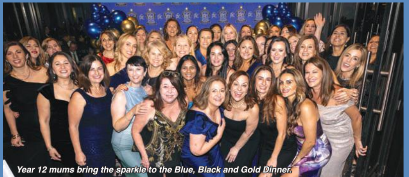
Year 12 mums bring the sparkle to the Blue, Black and Gold Dinner.