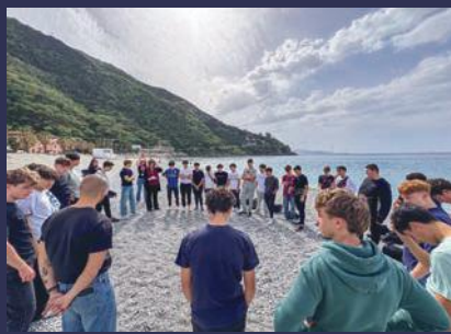
A day trip to Scilla, Calabria for an immersive language lesson.