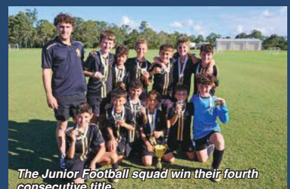
The Junior Football squad win their fourth consecutive title.