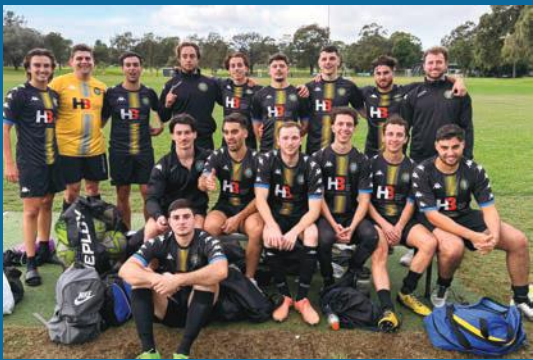
Some familiar faces in the All-Age Division 1 team.

The 2025 season marks an exciting new chapter for St Patrick's Football Club as we make our long-anticipated move to the Football Canterbury District, bringing the Club closer to home and better aligned with our geographical roots near the College in Strathfield.