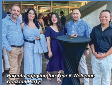
Parents enjoying the Year 5 Welcome Cocktail Party.