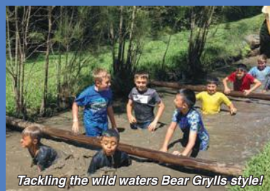
Tackling the wild waters Bear Grylls style!