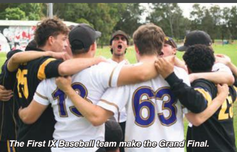
The First IX Baseball team make the Grand Final.