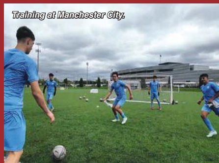
Training at Manchester City.