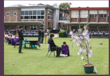
'Jesus' washes his disciples feet.