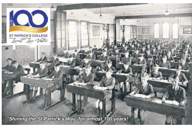
'Shining the St Patrick's Way' for almost 100 years!