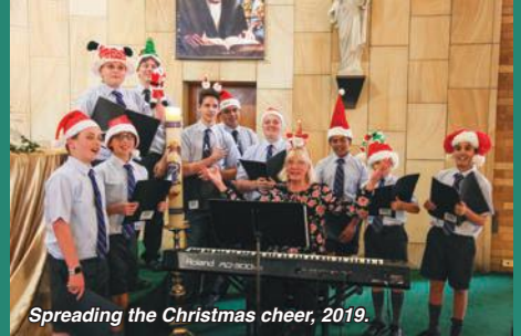
Spreading the Christmas cheer, 2019.