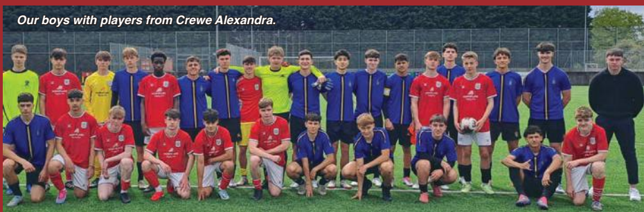
Our boys with players from Crewe Alexandra.