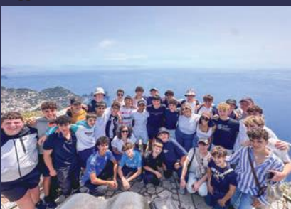
Taking in the heavenly views of Anacapri on Easter Sunday!