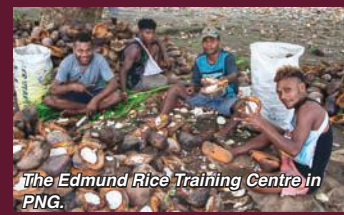
The Edmund Rice Training Centre in PNG.