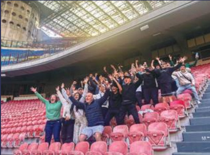
Getting into the spirit during a private tour of San Siro Stadium.