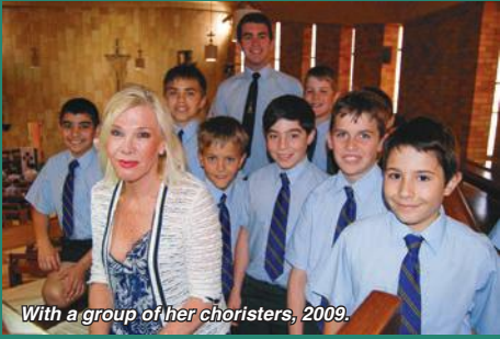
With a group of her choristers, 2009.