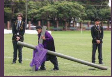
'Jesus' on the Way of the Cross.