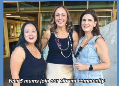
Year 5 mums join our vibrant community.