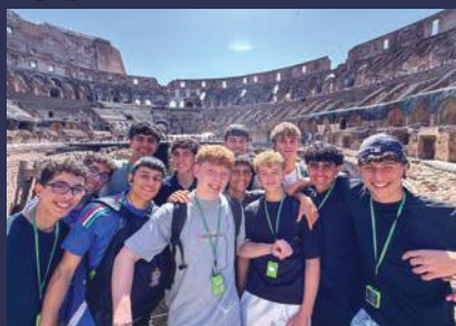
Soaking up the Roman sun inside the Colosseum.