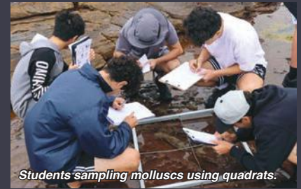
Students sampling molluscs using quadrats.