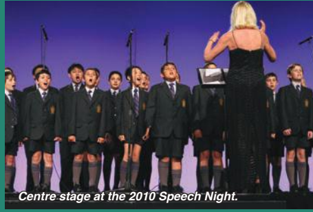
Centre stage at the 2010 Speech Night.