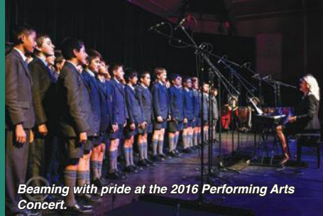
Beaming with pride at the 2016 Performing Arts Concert.