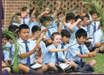
A waving of the palms symbolising Jesus' return to Jerusalem.