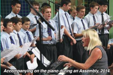
Accompanying on the piano during an Assembly, 2014.