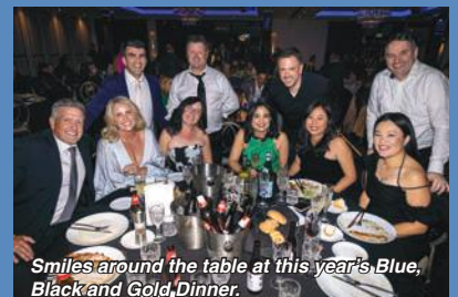
Smiles around the table at this year's Blue, Black and Gold Dinner.