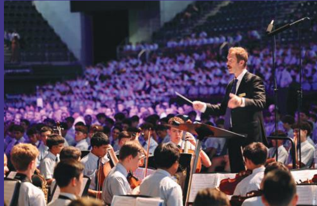
The Combined Concert Band & Orchestra brings some ceremonial flair to the High Achievers' Assembly.