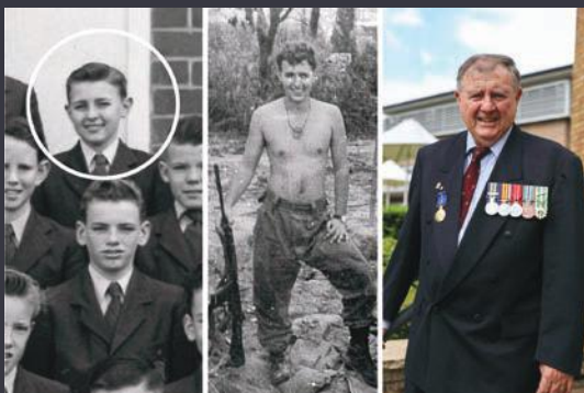
From schoolboy, to soldier, to decorated War Veteran.