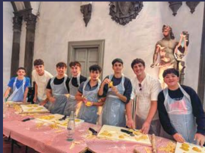
Pasta making at Rubaconte in Florence.