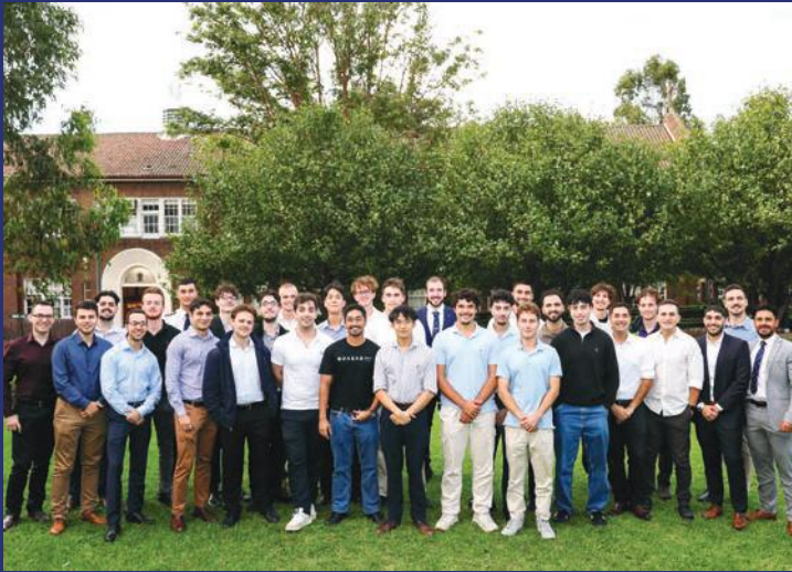
A great line-up of Old Boys shared their post-school study experiences.