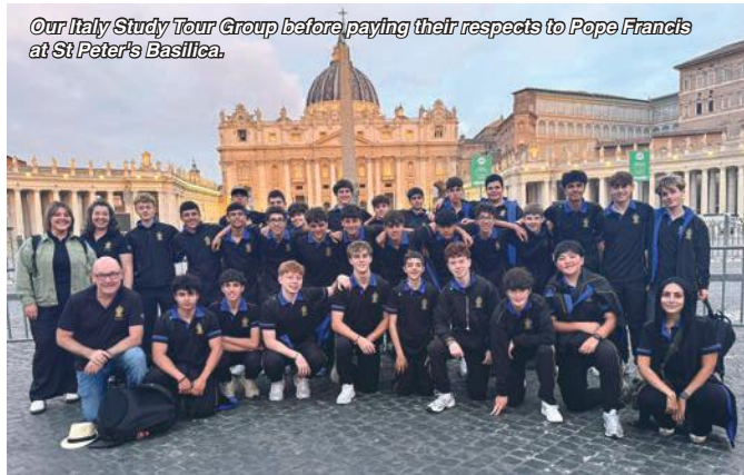
Our Italy Study Tour Group before paying their respects to Pope Francis at St Peter's Basilica.