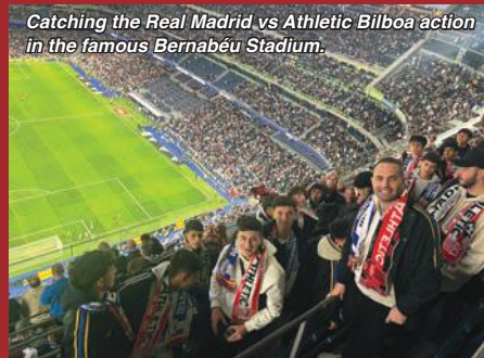
Catching the Real Madrid vs Athletic Bilbao action in the famous Bernabéu Stadium.