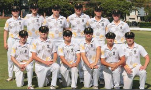
The First XI Cricket team finish the season as ISA Premiers.