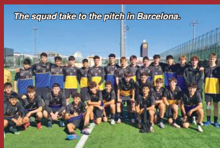
The squad take to the pitch in Barcelona.