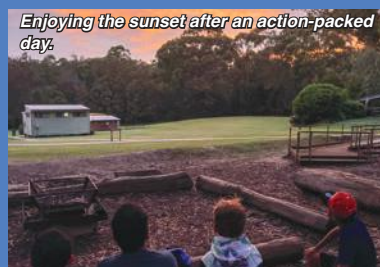
Enjoying the sunset after an action-packed day.