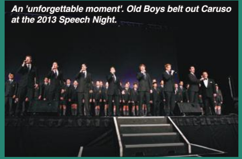
An 'unforgettable moment'. Old Boys belt out Caruso at the 2013 Speech Night.