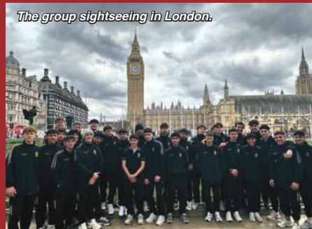
The group sightseeing in London.