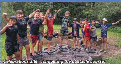
Celebrations after conquering the obstacle course!