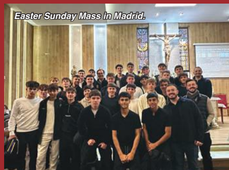
Easter Sunday Mass in Madrid.