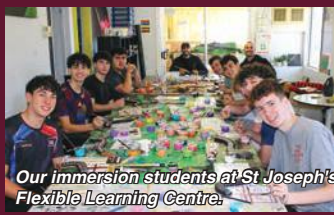
Our immersion students at St Joseph's Flexible Learning Centre.