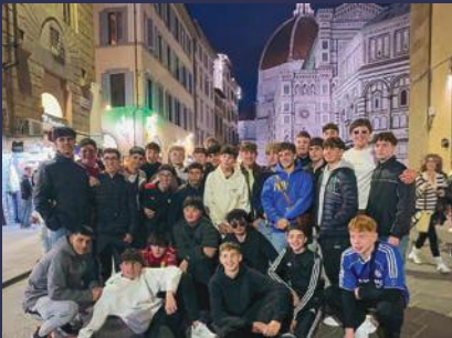
Exploring the streets of Florence by night.