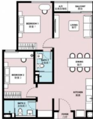
2 BEDROOMS 818 sq.ft.