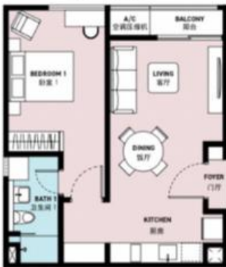
1 BEDROOM 540 sq.ft.