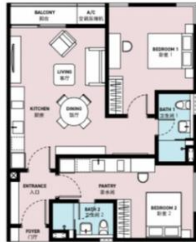
DUAL KEY 2 BEDROOMS! 861 sq.ft.