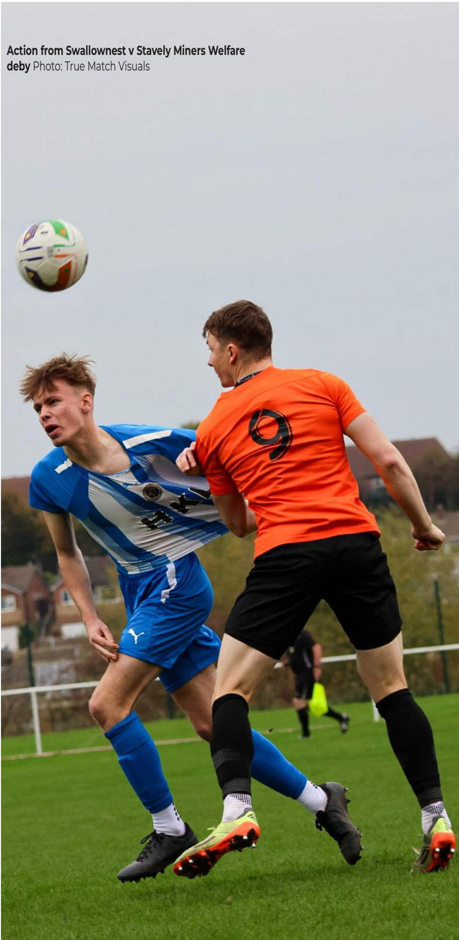
Action from Swallownest v Stavely Miners Welfare derby

Despite late changes, Dronfield never breached Ross Etheridge's goal, and the visitors comfortably saw out the game. Back-to-back home defeats now leave Town in 13th place, facing mounting pressure ahead of Saturday's trip to third-placed FCV Grace Dieu.