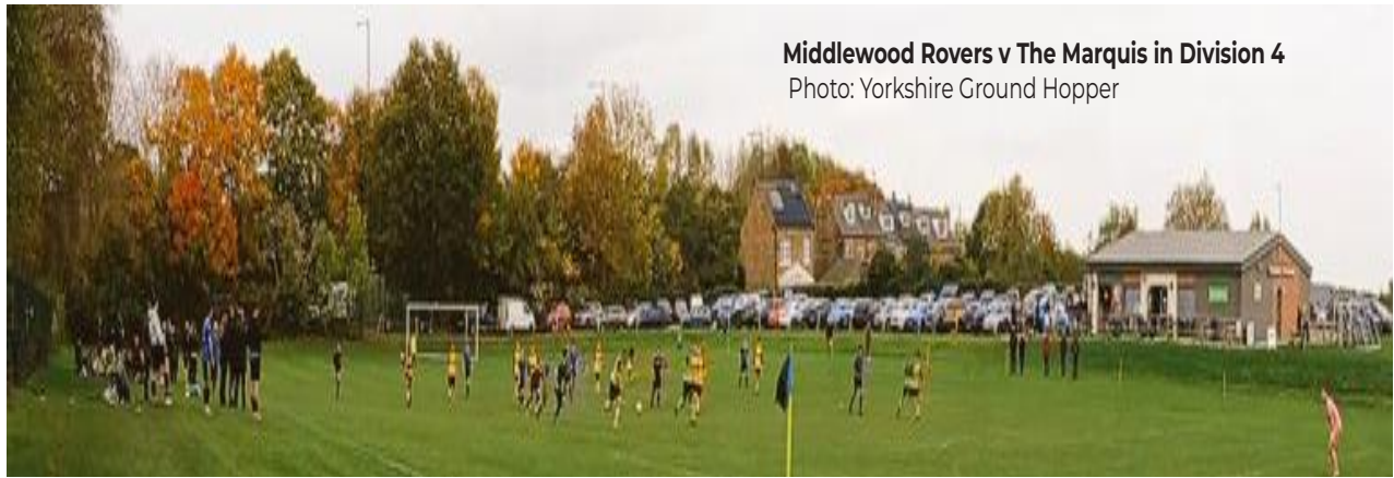
Middlewood Rovers v The Marquis in Division 4