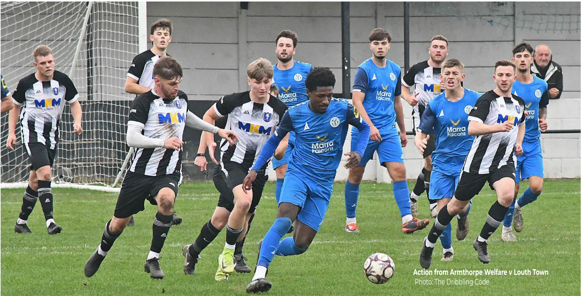
Action from Armthorpe Welfare v Louth Town