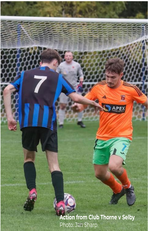
Action from Club Thorne v Selby