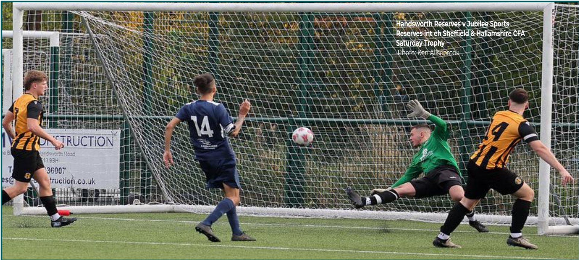
Handsworth Reserves v Jubilee Sports Reserves int eh Sheffield & Hallamshire CFA Saturday Trophy