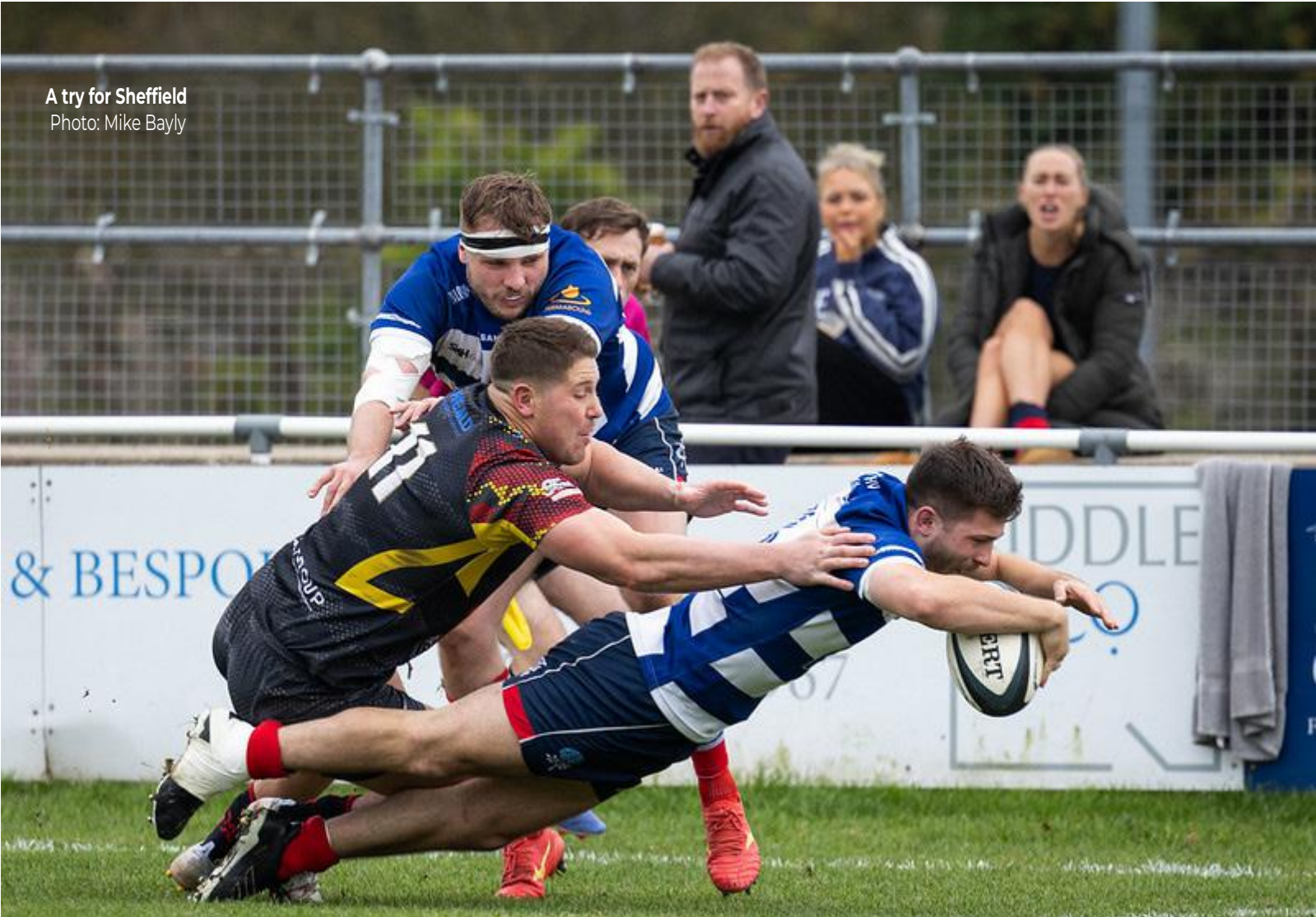
A try for Sheffield

Hull responded through Reece Dean's penalty, but Sheffield struck again when a loose clearing kick allowed