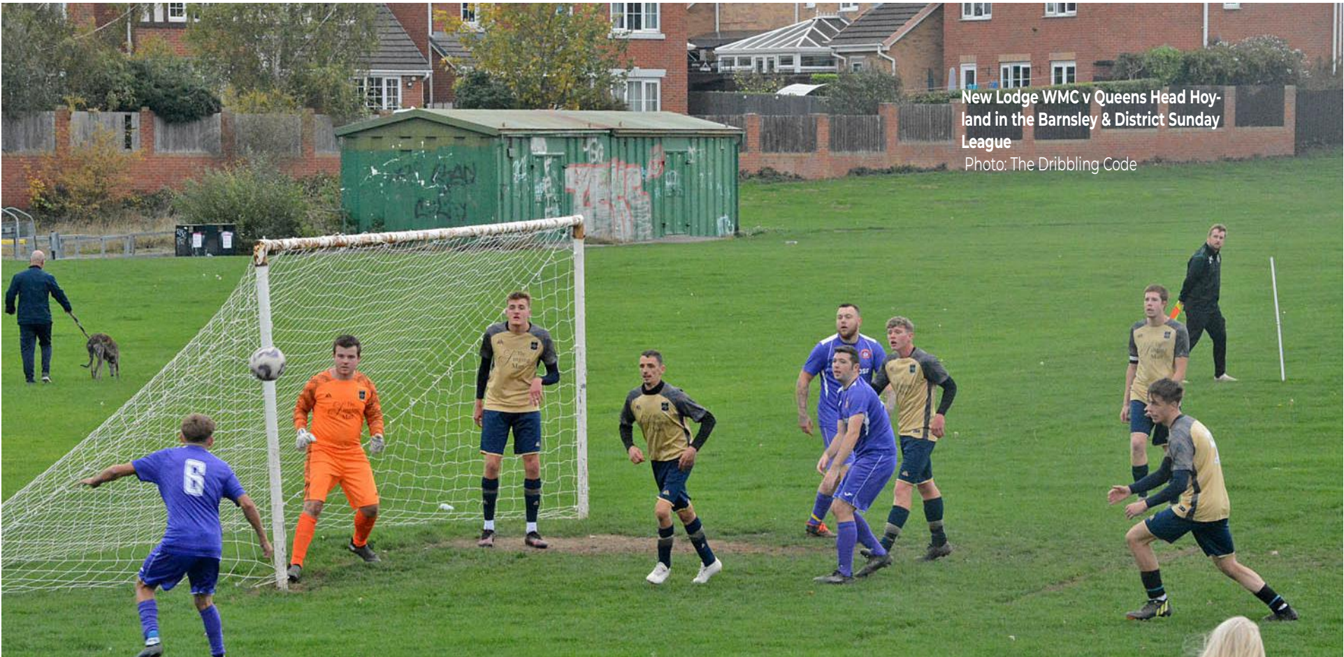
New Lodge WMC v Queens Head Hoy- land in the Barnsley & District Sunday League