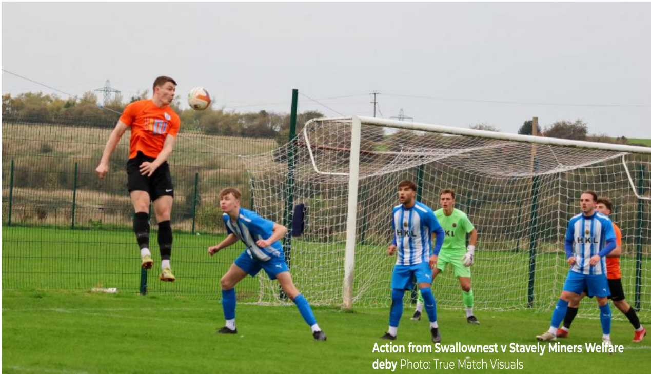
Action from Swallownest v Staveley Miners Welfare derby

On Tuesday night, South Normanton Athletic strengthened their playoff push with a ruthless first-half display,