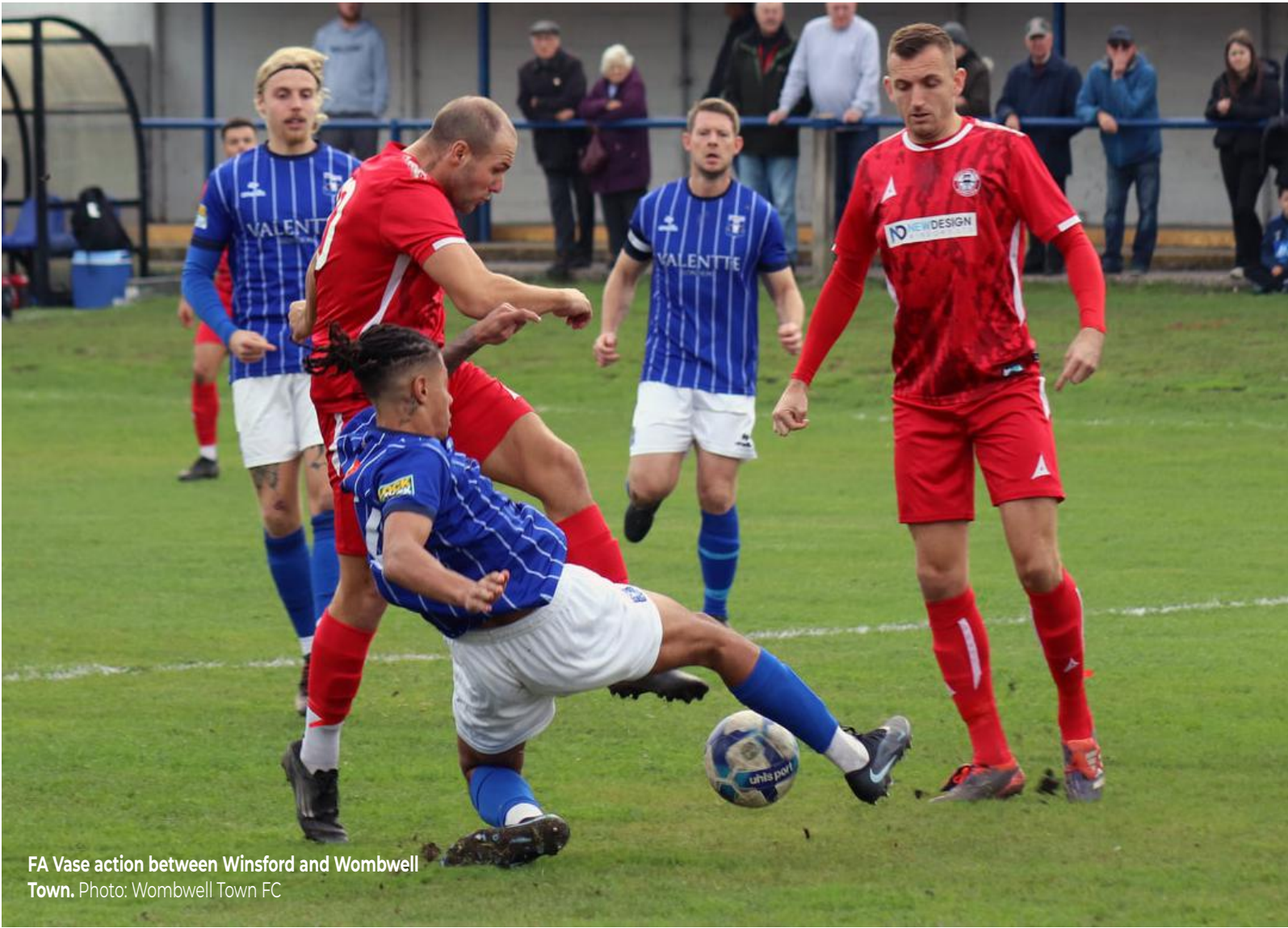
FA Vase action between Winsford and Wombwell Town.

Winterton Rangers and Ilkley Town shared the spoils in a 1-1 draw. Kevin Gonzalez gave Ilkley the lead midway through the first half, but Tom Pindar equalised from the spot after the break in a game of few clear chances.