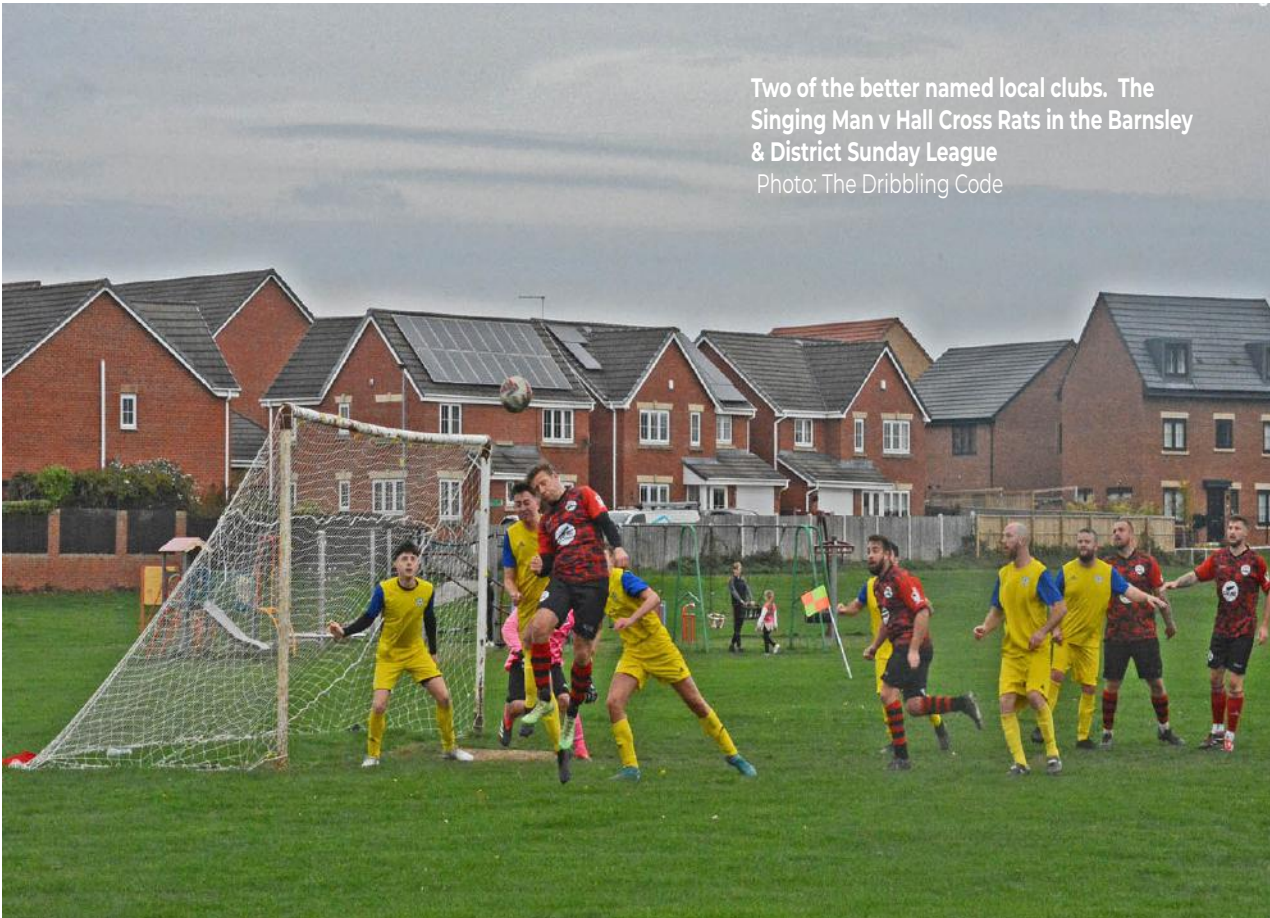
Two of the better named local clubs. The Singing Man v Hall Cross Rats in the Barnsley & District Sunday League