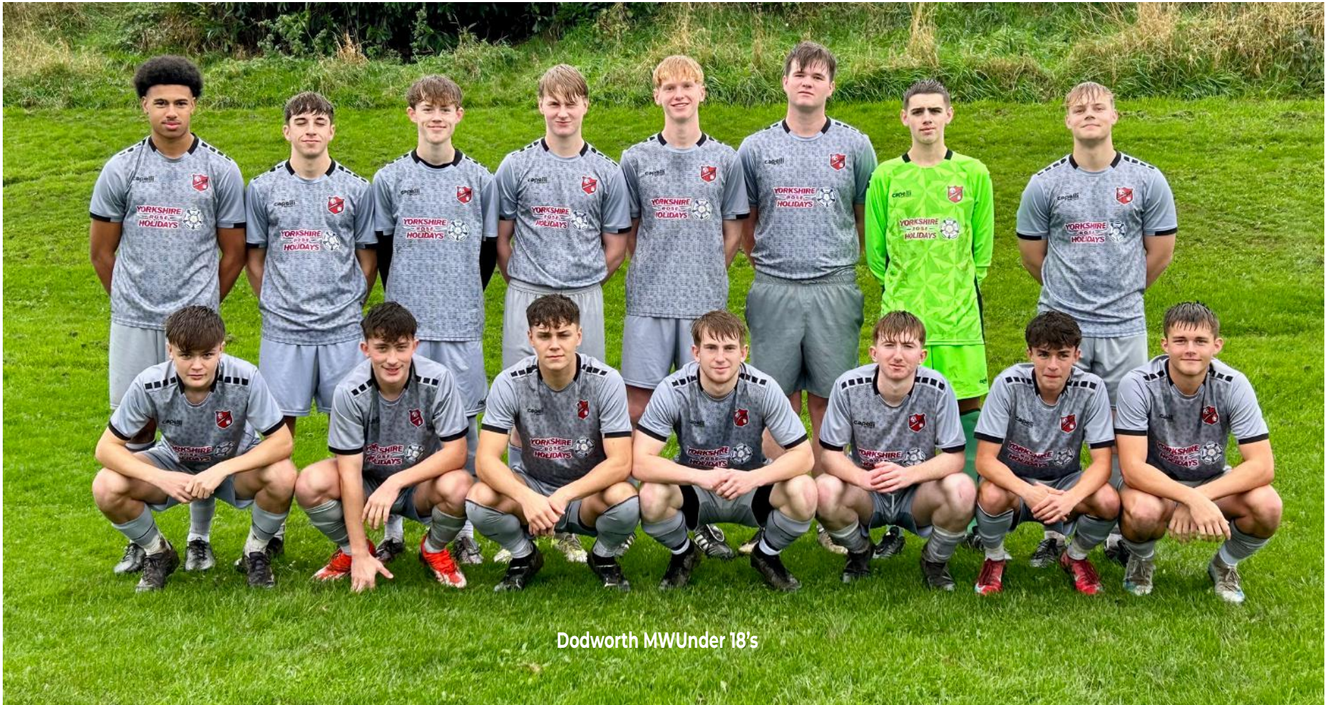
Dodworth MW Under 18's