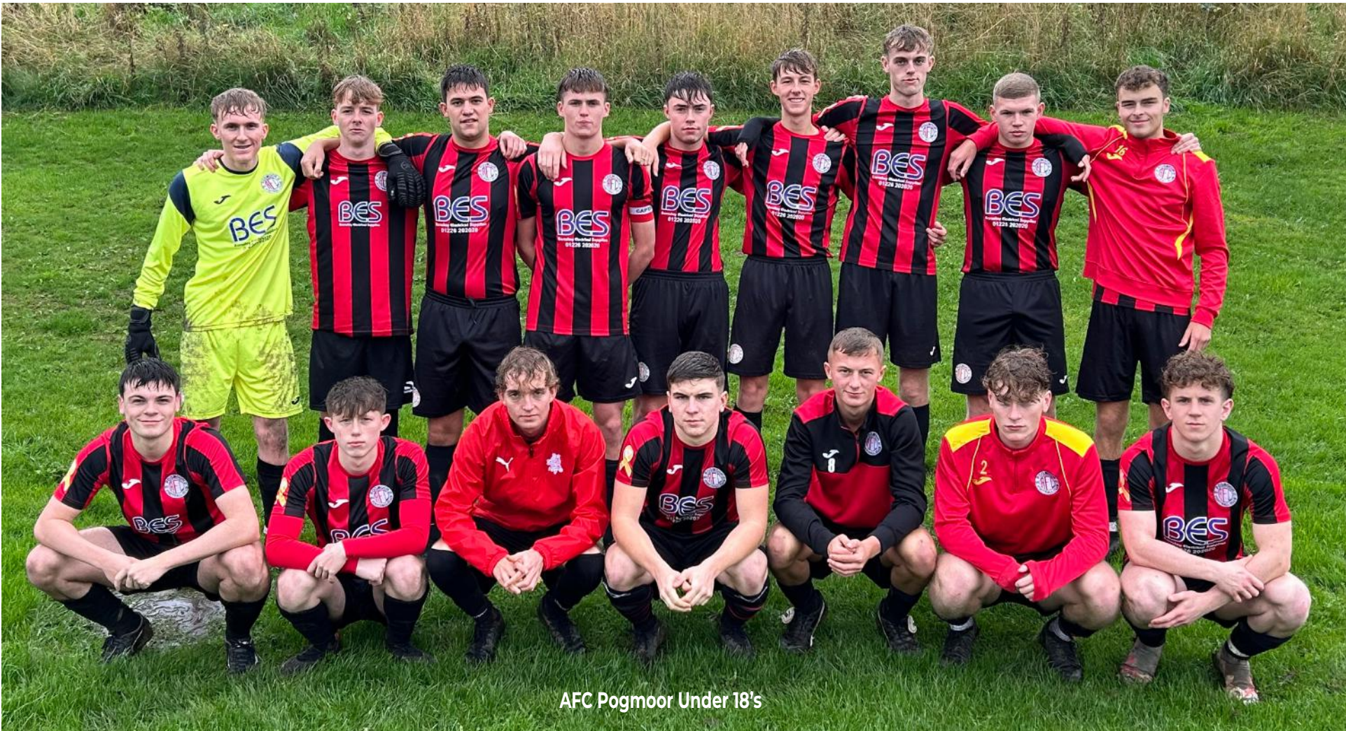
AFC Pogmoor Under 18's