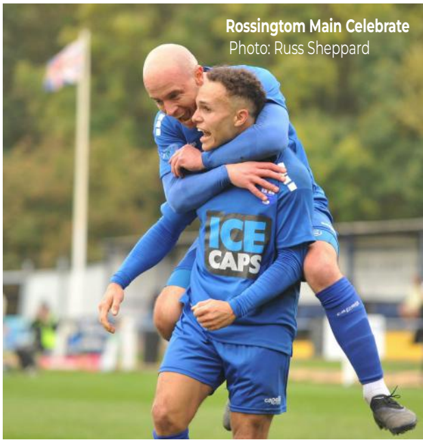
Rossington Main Celebrate

In the midweek games, Golcar United produced a dramatic late surge to claim a 3-1