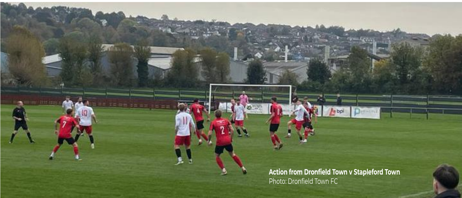
Action from Dronfield Town v Stapleford Town