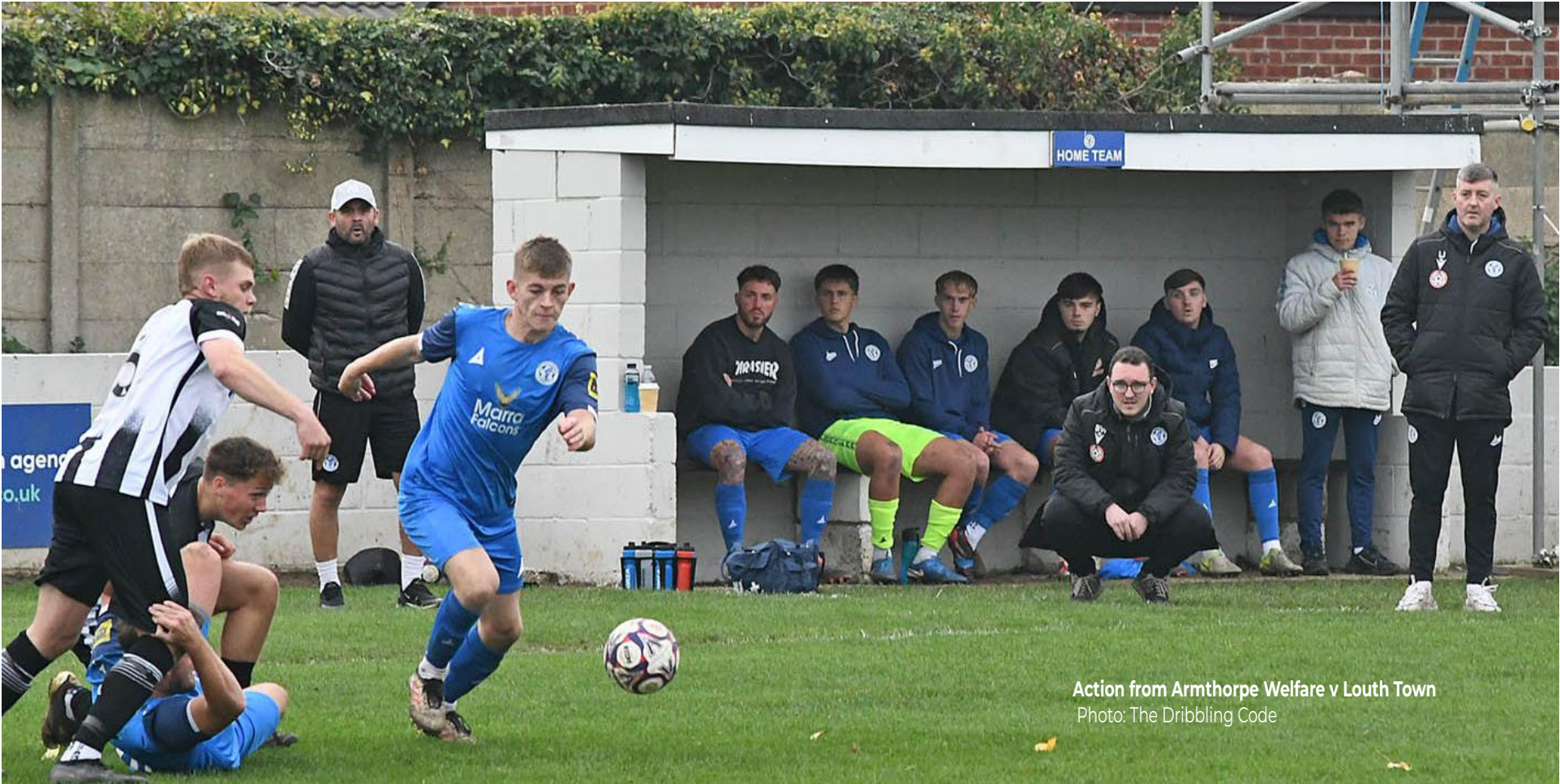
Action from Armthorpe Welfare v Louth Town