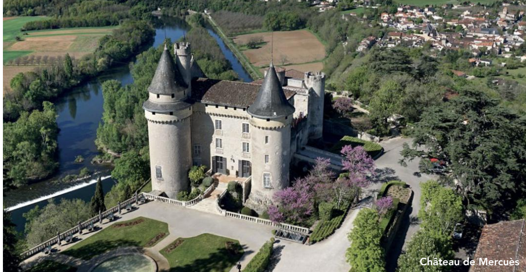
Château de Mercuès