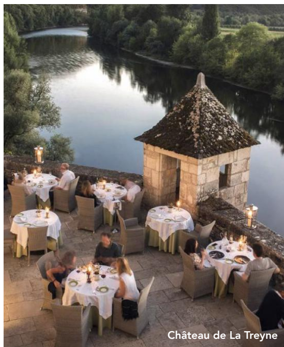
Château de La Treyne

Activity Level: Activities are generally not very strenuous, however, we expect that guests can enjoy two hours or more of walking each day, are sure-footed on cobbled and unpaved surfaces, and can walk up and down stairs without assistance. Château de Mercuès was constructed in the 13th century. Guests will find stone floors and stairways that may not have railings. The property has an elevator, but it does not access every floor.