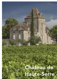
Château de Haute-Serre