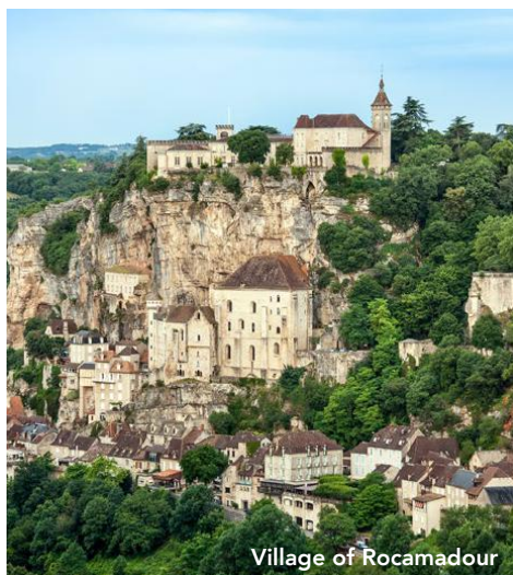
Village of Rocamadour