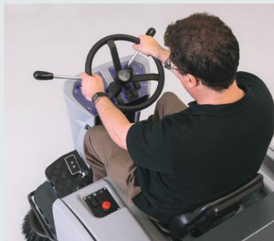
Clear-View™ enhances operator safety.