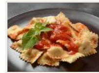
CHEESE RAVIOLI 71798 4/3 lb.