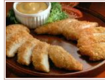
PANKO BREADED CHICKEN TENDERLOIN Select, sized, whole muscle, chicken breast tenderloins coated with a crunchy, golden brown panko breading with toasted highlights. Perfect for salads, appetizers, and entrees. Ready to cook. 68012 2/5 lb.