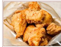
DOO-WA DITTIES BONELESS WINGS Fully cooked, whole muscle, boneless, skinless, chicken breast that have a crispy, lighter fritter coating and savory flavor. Easy to prepare with tremendous patron appeal and plenty of versatility. 68050 2/5 lb.