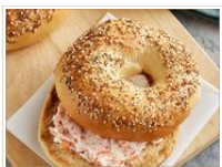
EVERYTHING 62358 45/5 oz.