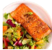
SKINLESS SALMON FILET 8 oz: 70640 20/8 oz. 6 oz: 70644 26/6 oz.