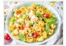
5-CHEESE TORTELLINI 71843 3/4 lb.