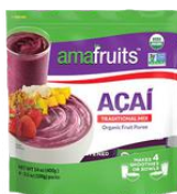
ORGANIC ACAI TRADITIONAL MIX 74452 32/3.5 oz.