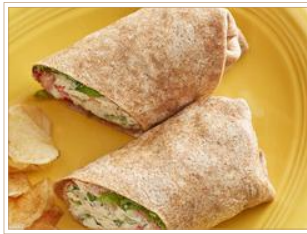
12" WHEAT WRAP 72716 6/12 ct.