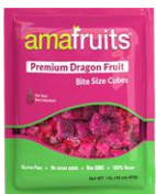
DRAGON FRUIT PITAYA CUBES 74456 8/16 oz.