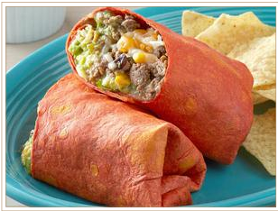
SUNDRIED TOMATO WRAP 72712 6/12 ct.