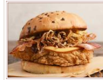
SIGNATURE CLASSIC BREADED CRISPY CHICKEN FILLET Non-fritter and par fried with a scratch-made, hand-breaded appearance. Well balanced between buttermilk batter with country-style coating. Crispy, crunchy yet juicy. 68048 28/5.7 oz.