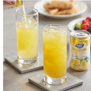
PINEAPPLE JUICE Can: 30110 24/7.2 oz. PET: 29570 8/48 oz.

Ruby Kist meets the needs of many use occasions with a broad assortment built on quality, consistency, and value.