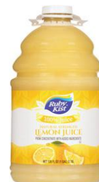
LEMON JUICE PLASTIC BOTTLE 29366 4/1 gl. | 1/1 gl.