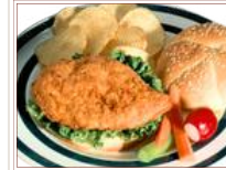
GOLD'N'SPICE® BREADED BREAST CUTLETS Fully cooked, 3.7 oz. shaped, all breast meat cutlets have a natural, whole muscle appearance and are breaded with our signature Gold'N'Spice® breading characterized by its golden brown color with black pepper flakes. 68070 43/3.7 oz.