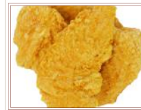
ORIGINAL BREADED CHICKEN TENDERLOIN Select, line flow, whole muscle chicken breast tenderloins are coated with our Original wheat flour-based breading with mild seasonings. 68014 2/5 lb.