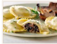
WILD MUSHROOM RAVIOLI 71726 2/3 lb.