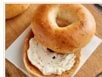
SESAME 62416 45/5 oz.