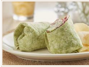
12" SPINACH WRAP 72706 6/12 ct.