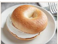
PLAIN 62378 45/5 oz.