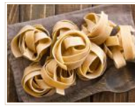
PAPPARDELLE EGG NEST 71652 6/2.5 lb.