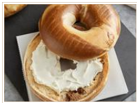
MARBLE 62390 45/5 oz.