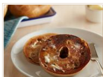
CINNAMON RAISIN 62409 45/5 oz.