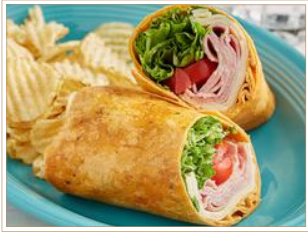
12" JALAPENO & CHEDDAR WRAP 72708 6/12 ct.