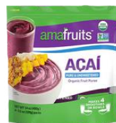
PURE UNSWEETENED ACAI 74450 32/3.5 oz.