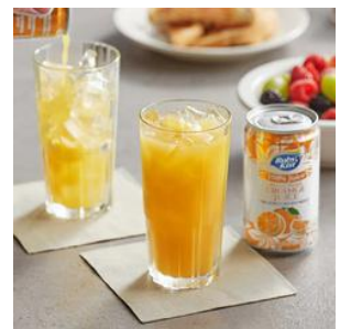
ORANGE JUICE Can: 29900 24/7.2 oz. PET: 29431 8/48 oz. 29901 24/10 oz.