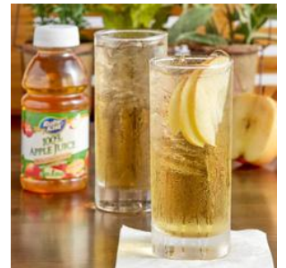
APPLE JUICE Can: 29902 24/7.2 oz. PET: 29120 8/48 oz. 29903 24/10 oz.