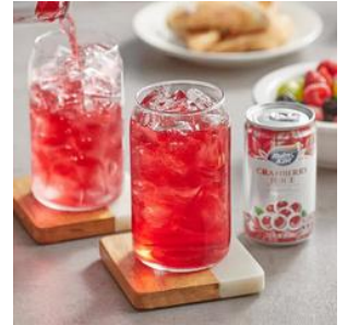
CRANBERRY JUICE COCKTAIL Can: 29260 24/7.2 oz. PET: 29261 24/10 oz.