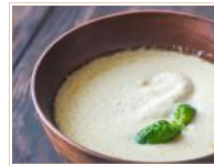
ALFREDO SAUCE 71948 3/5 lb.