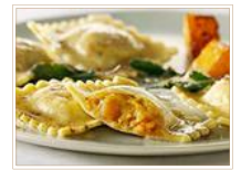
BUTTERNUT SQUASH RAVIOLI 71674 2/3 lb.