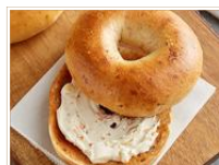
ONION 62364 45/5 oz.