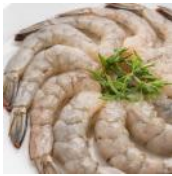
IQF RAW PEELED & DEVEINED TAIL-ON WHITE SHRIMP 26/30: 71512 5/2 lb. 8/12: 71510 5/2 lb. | 1/2 lb. 13-15: 71468 5/2 lb. | 1/2 lb.