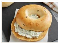
JALAPENO 62362 45/5 oz.