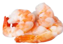
TAIL ON COOKED SHRIMP 16/20 71462 5/2 lb. | 1/2 lb.