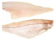
IQF HADDOCK FILET 8/10 oz.: 70662 1/10 lb. 12 & up: 70666 1/10 lb.