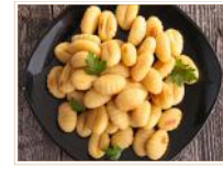
GNOCCHI 71654 3/4 lb.