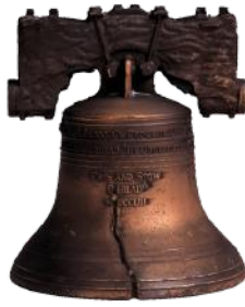
Independence National Historic Park - June 2020

Though it's iconic today, the Liberty Bell was a lot less famous in the 1700s, when it was just a big, fancy bell in the Pennsylvania State House in Philadelphia. Later, the State House became Independence Hall, and the bell's home turf became famous as the place where both the Declaration of Independence was drafted and the United States Constitution was debated and adopted. But the bell itself still wasn't famous, and it remained relatively obscure until abolitionist groups in the 1800s began using it as a symbol of the movement to end slavery. They gave the bell its current name, the Liberty Bell, in the 1830s. In the nearly two centuries since then, the bell has been used for various other movements as well, including women's suffrage and civil rights.