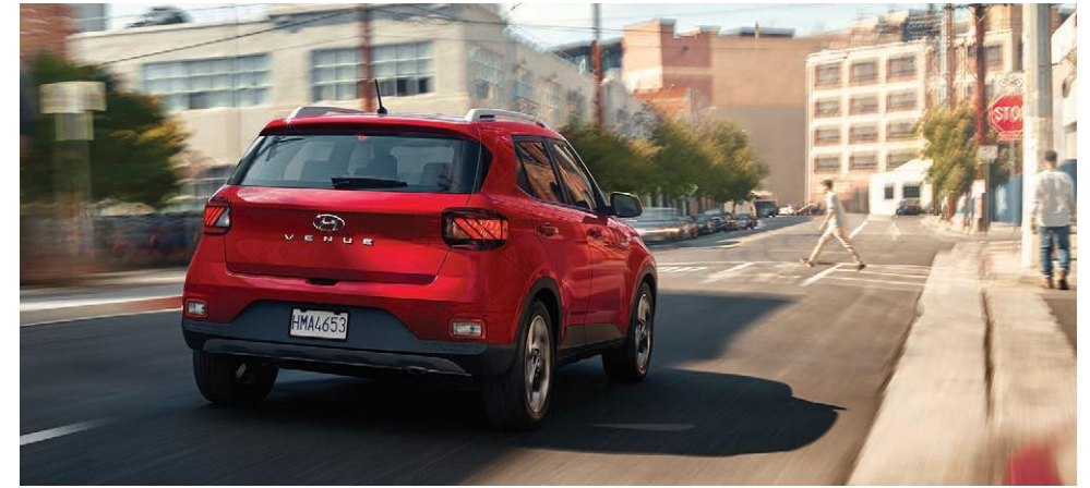
Forward Collision-Avoidance Assist with Pedestrian Detection

Even as you exit your vehicle, Venue looks after your family's safety with a standard Rear Occupant Alert feature that reminds you to check the rear seats before leaving. 9