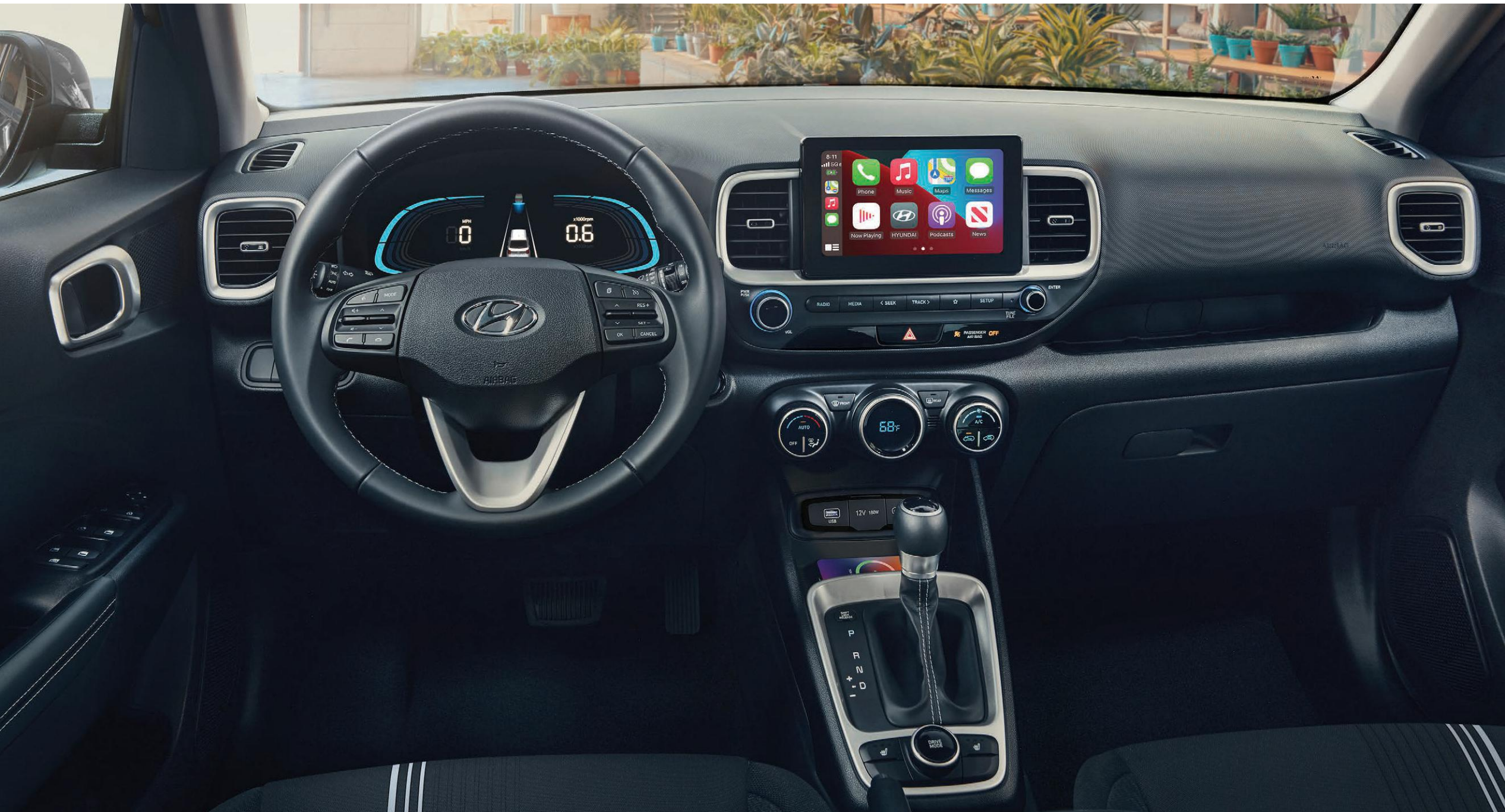
VENUE SEL with Two-tone Roof in Black Cloth/H-Tex™ combination