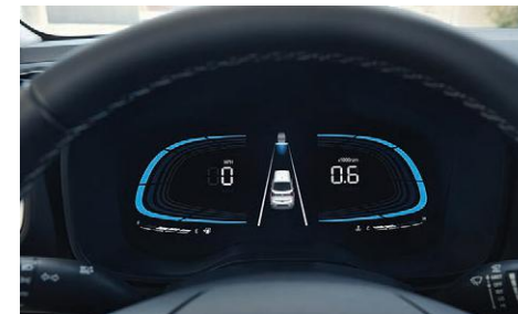
4.2" digital instrument cluster