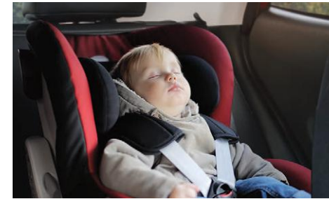
Rear Occupant Alert