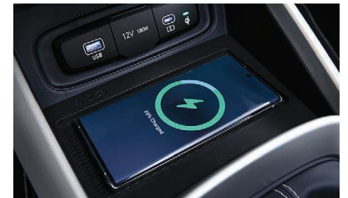
Wireless phone charger and dual USB ports