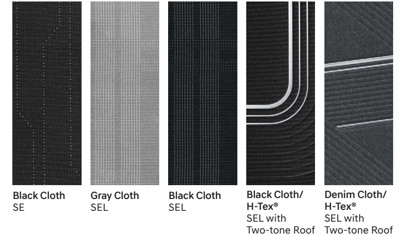
Black Cloth SE