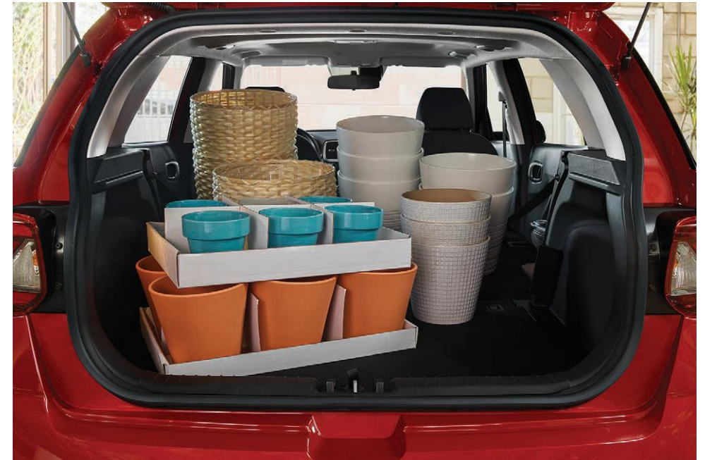
Versatile cargo area

Like you, Venue knows how to be comfortable in different situations. Whether it's hot or cold outside, an available automatic temperature control maintains preset temperatures inside the cabin. Heated front seats are also available to take the chill off. And like you, Venue is totally plugged in. Front-seat passengers can charge their devices using dual USB ports or a 12-volt power outlet. On SEL trims, friends in the rear seat can stay charged with dual rear USB ports.