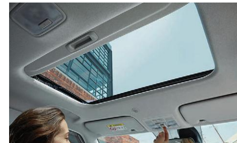
Power tilt-and-slide sunroof