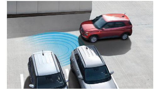
Rear Cross-Traffic Collision Warning