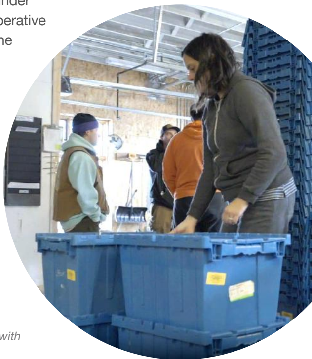
PHOTO: Western Montana Growers Cooperative staff pack veggie boxes with locally sourced food from their 40+ producer-members

310 : Cooperative jobs were : created or saved over : the past year