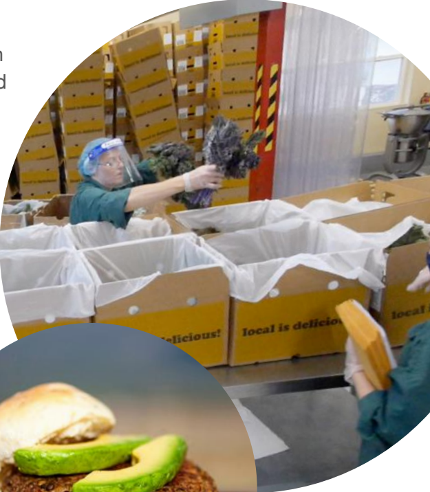
PHOTOS: Top - Packing Farmers to Families Food Boxes; Bottom - Montana Lentil Burger

Montana Lentil Burger: The Montana Lentil Burger has seen a surge of popularity in local markets, such as Xanterra, who are serving the burger in their dining services. Look for our new Lentil Burger packaging in the upcoming year.