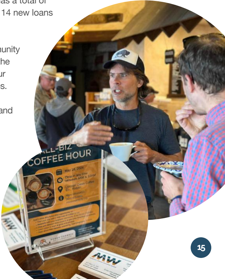
PHOTOS: Mission West staff meet with business owners at a ‘Coffee Hour’ in Ronan

Workshops: Mission West facilitates small business workshops designed to provide local entrepreneurs with the resources they need to develop, sustain, and grow their business. In the last year, MWCDP facilitated 21 workshops that 99 people attended