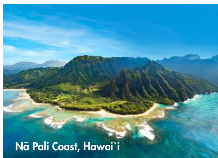
Nā Pali Coast, Hawai`i