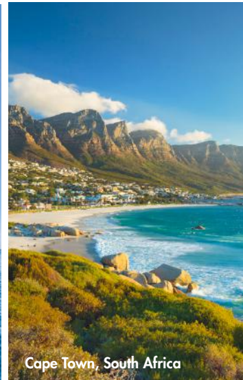
Cape Town, South Africa