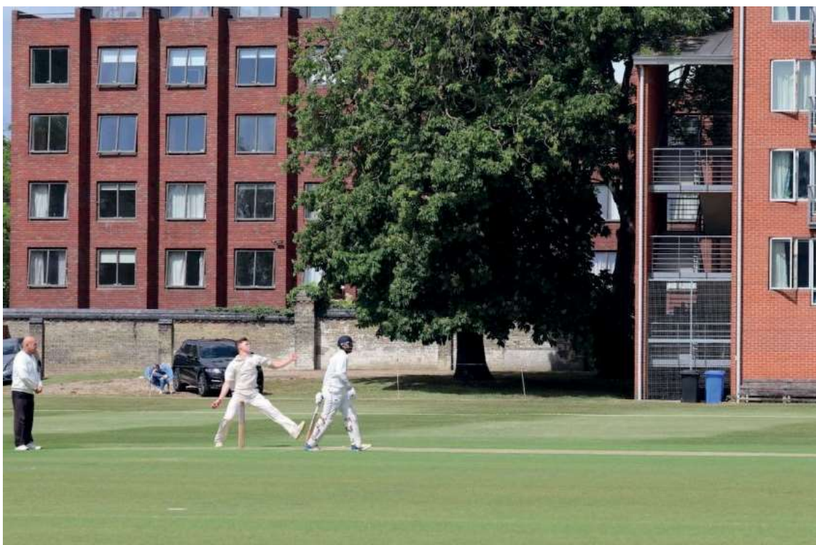
Oliver Wood “side on” bowling from the “Hughes Hall Accommodation end”.