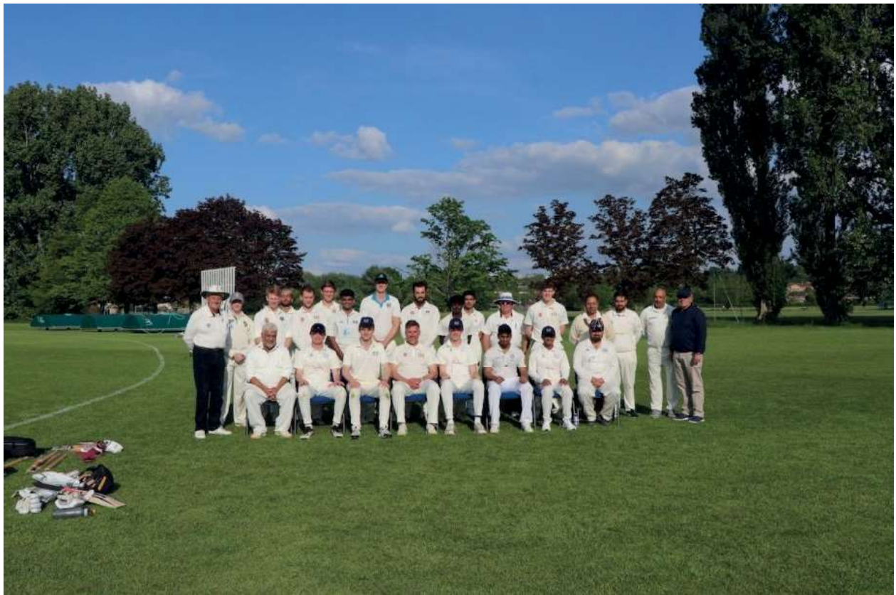
Combined Oxford University and Incogniti CC team photo at Marston Sports and Social Club