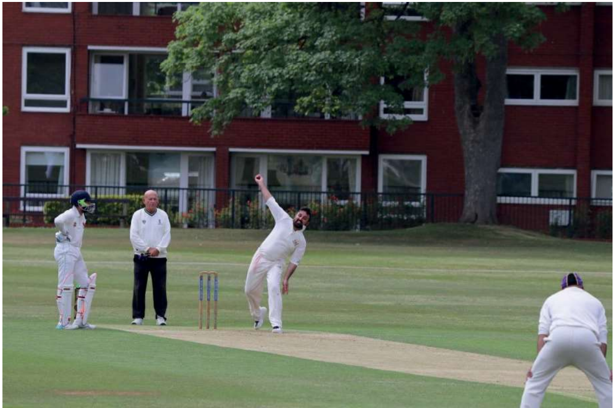
Imran Khan bowling from the Hughes Hall end.