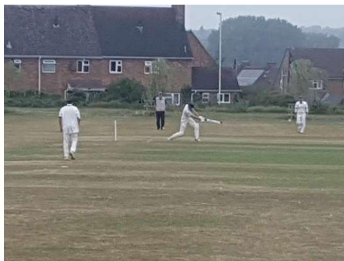
Action at Trowbridge