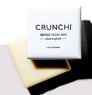
Gentle Facial Bar