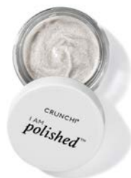
I AM Polished® Facial Exfoliator

Exfoliate every other day or as tolerated. Use after cleansing and before using toner.