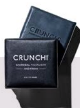
Charcoal Facial Bar