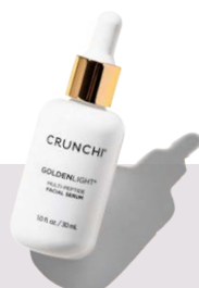
Goldenlight® Multi-Peptide Facial Serum