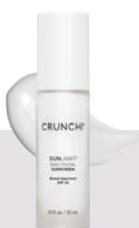
Sunlight® Facial Sunscreen SPF 30