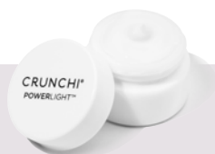
Powerlight® Eye Cream