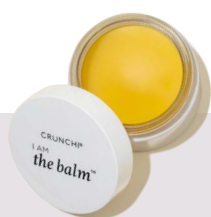
I AM The Balm Makeup Cleaning Balm