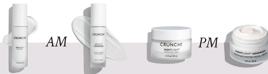
Daylight® Facial Cream