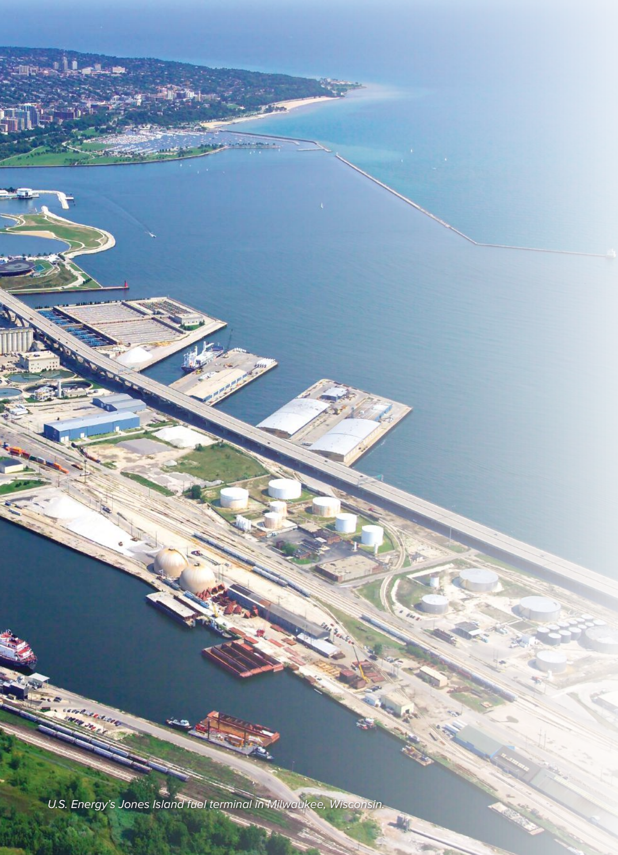
U.S. Energy's Jones Island fuel terminal in Milwaukee, Wisconsin.