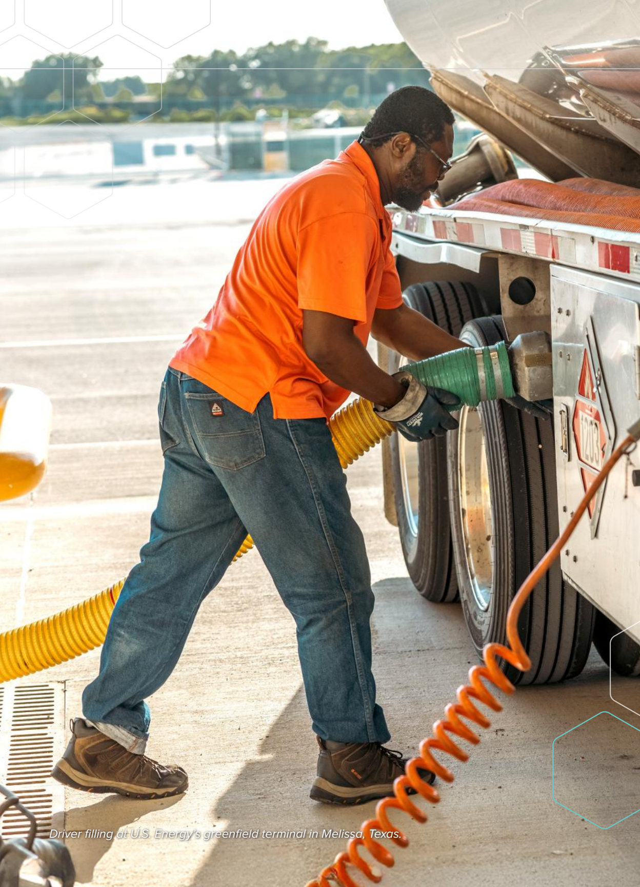
Driver filling at U.S. Energy's greenfield terminal in Melissa, Texas.