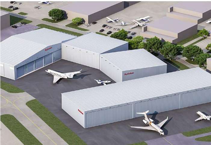
SKY HARBOUR ADS ADDISON, TEXAS