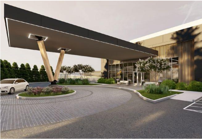
FTY CORPORATE FLIGHT DEPARTMENT ATLANTA, GEORGIA