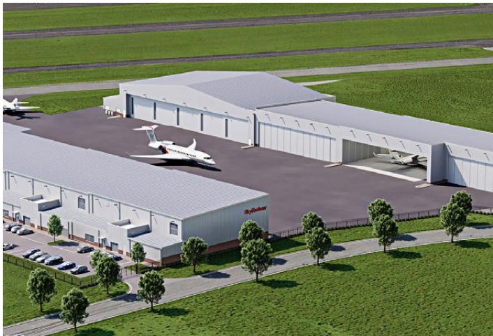
SKY HARBOUR APA CENTENNIAL, COLORADO