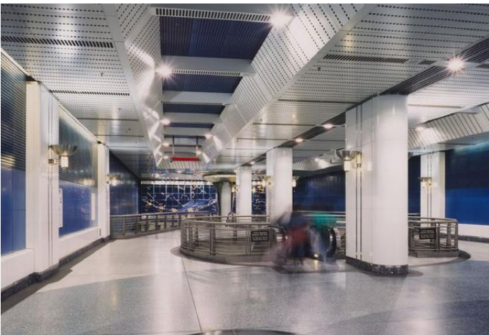
VERMONT / SUNSET STATION LOS ANGELES, CALIFORNIA