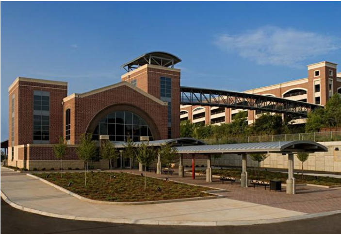
ATHENS MULTIMODAL TRANSPORTATION CENTER ATLANTA, GEORGIA