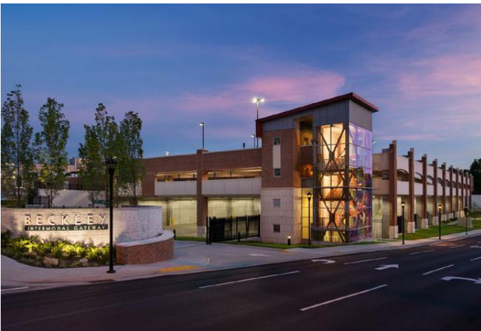
BECKLEY INTERMODAL GATEWAY BECKLEY, WEST VIRGINIA