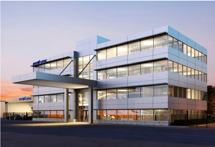
ATLANTIC AVIATION BCT BOCA RATON, FLORIDA