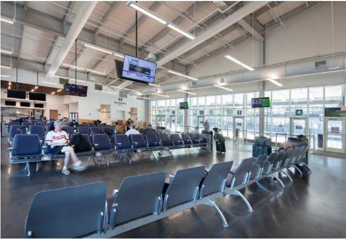
GREYHOUND ATLANTA TERMINAL ATLANTA, GEORGIA