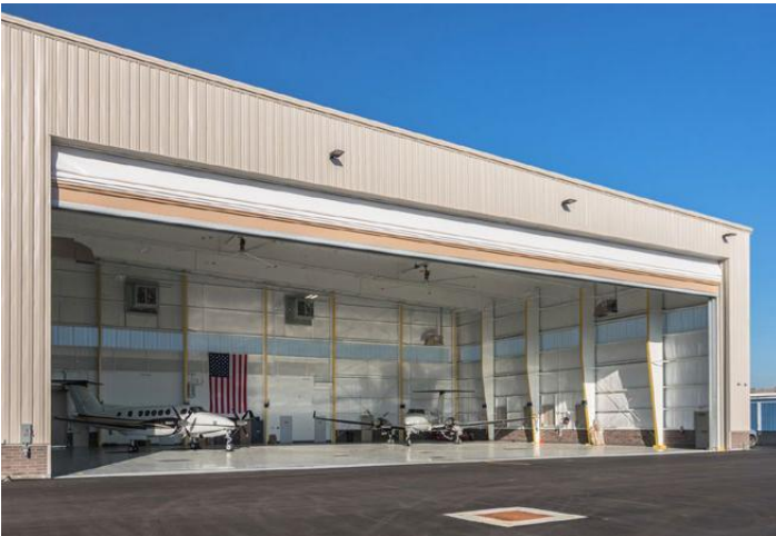
PDK CORPORATE HANGAR CHAMBLEE, GEORGIA