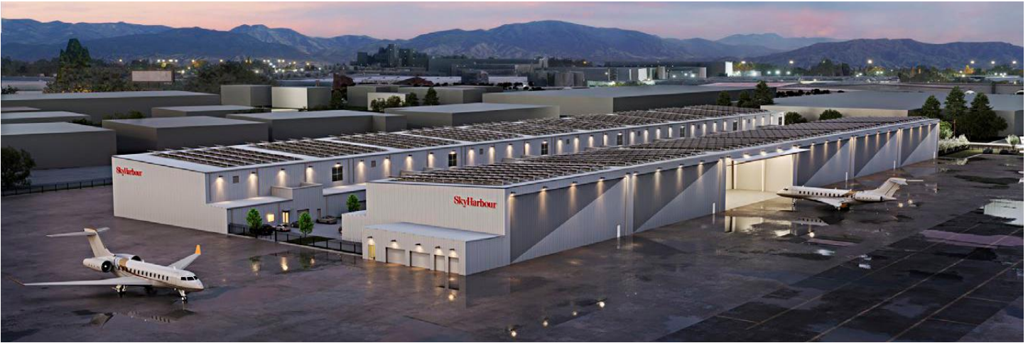
SKY HARBOUR NATIONAL PROTOTYPE MULTIPLE LOCATIONS NATIONALLY