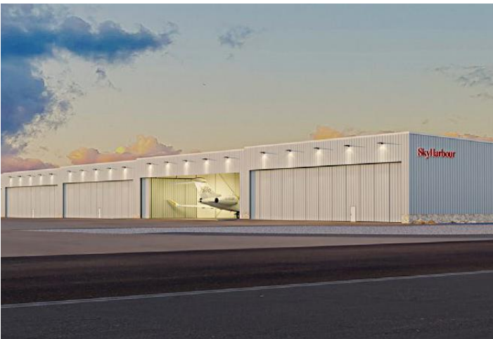
SKY HARBOUR DVT PHOENIX, ARIZONA