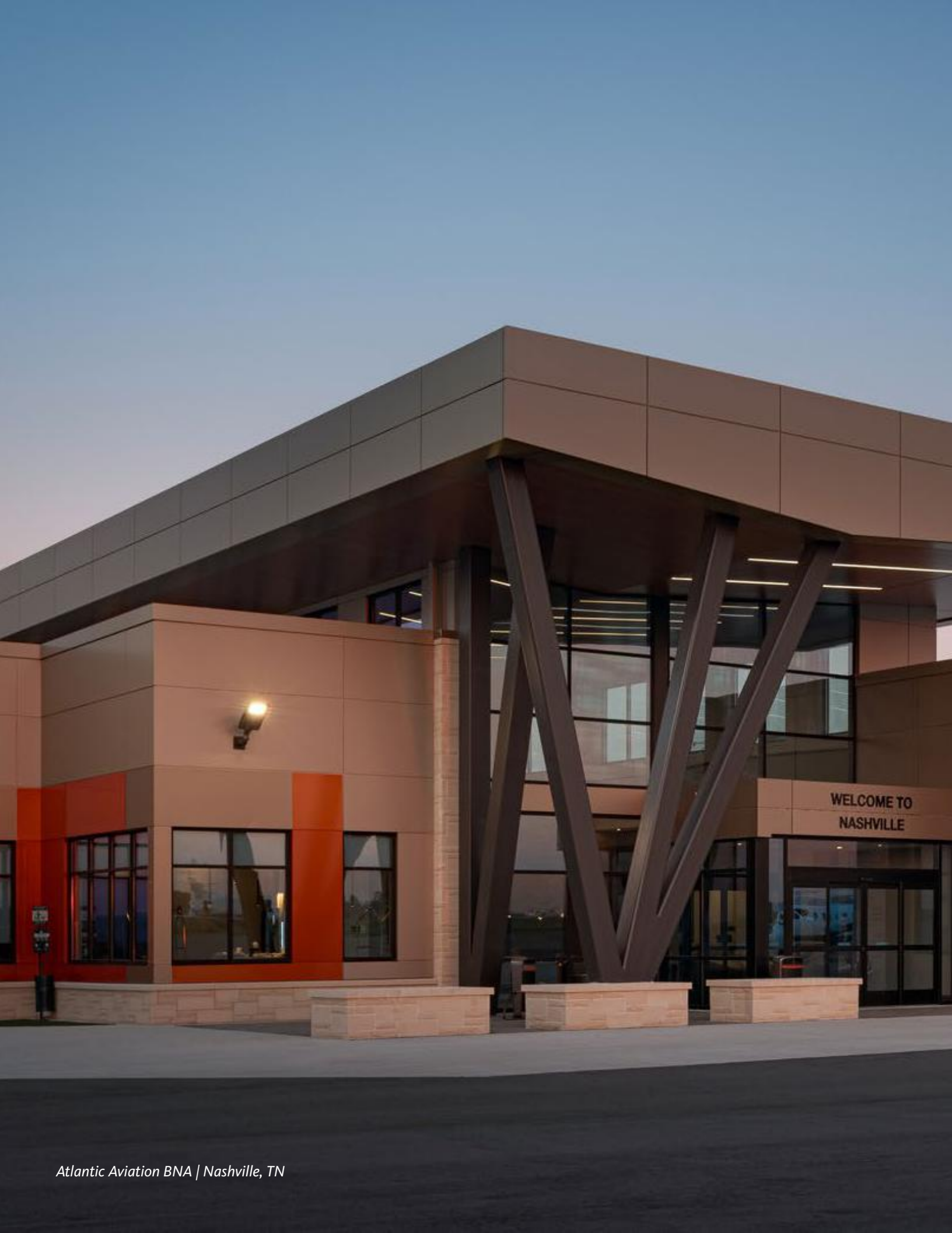
Atlantic Aviation BNA | Nashville, TN