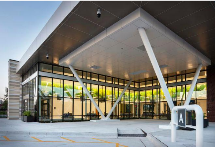
ALBANY TRANSPORTATION CENTER ALBANY, GEORGIA