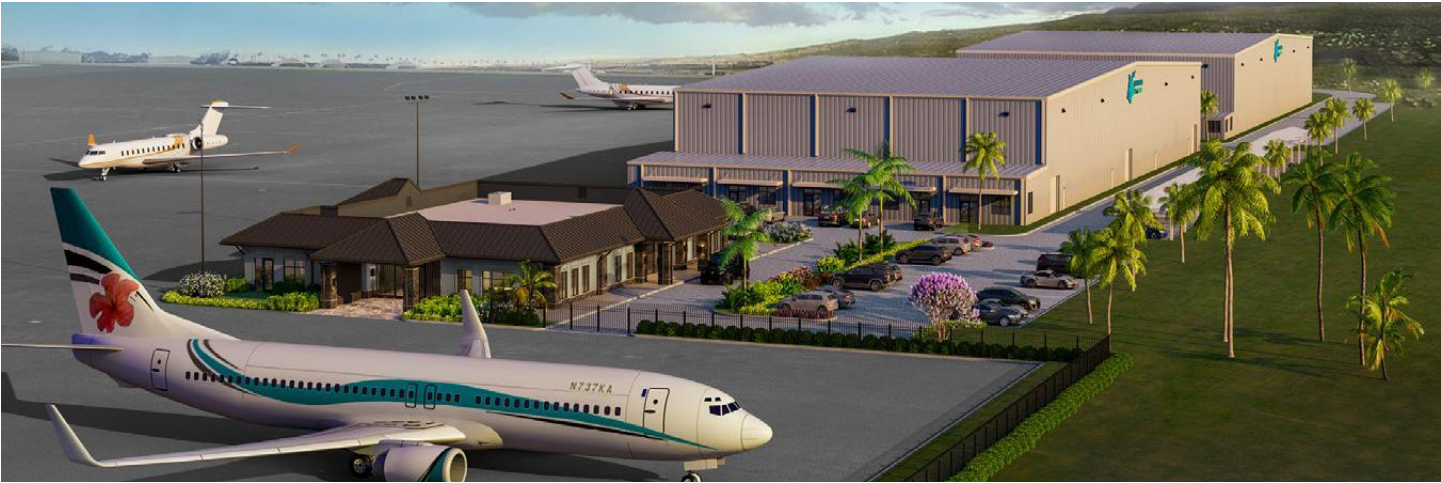
BIG ISLAND JET CENTER NORTH KONA, HAWAII