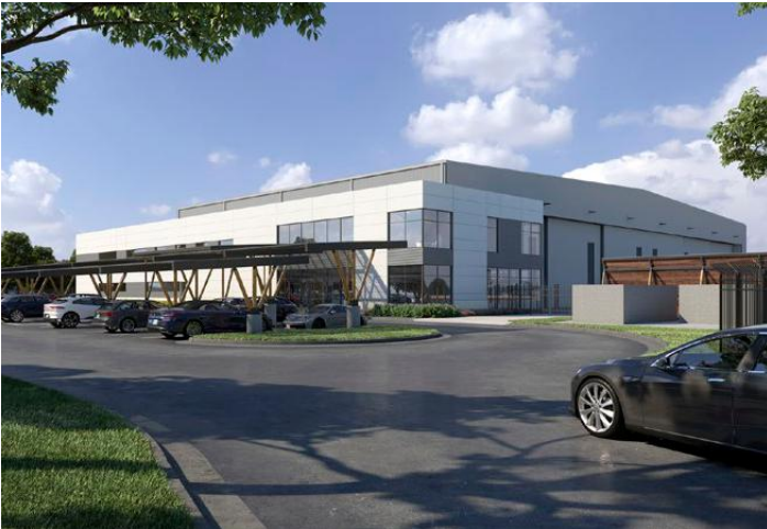
CORPORATE FLIGHT DEPARTMENT ATLANTA, GEORGIA