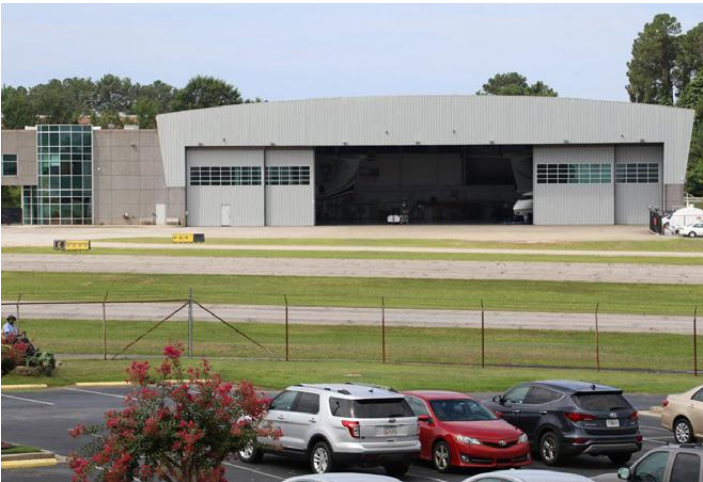
FTY CORPORATE HANGAR ATLANTA, GEORGIA