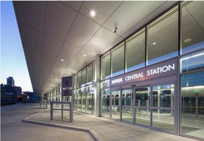
BIRMINGHAM INTERMODAL FACILITY BIRMINGHAM, ALABAMA