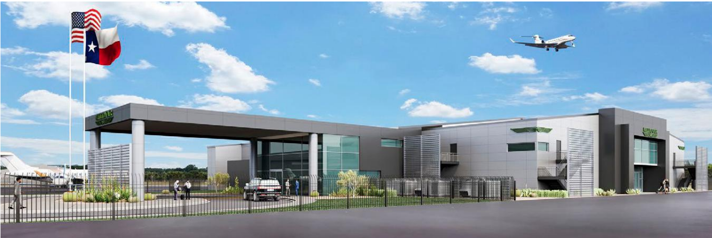
FRANKLIN MOUNTAIN AVIATION MAF MIDLAND, TEXAS