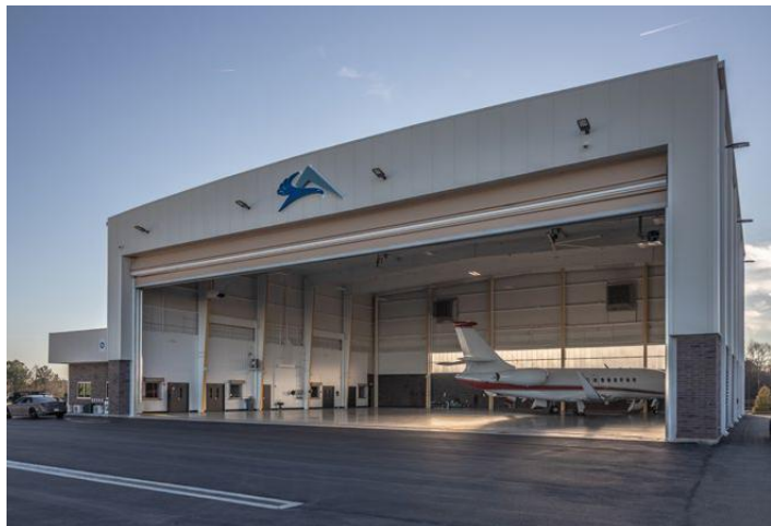
ATLANTIC AVIATION PDK - HANGAR O CHAMBLEE, GEORGIA