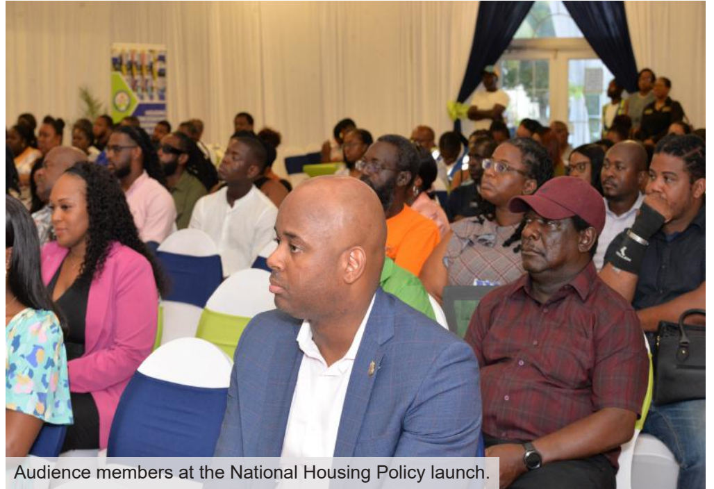
Audience members at the National Housing Policy launch.

The National Housing Policy and Programs was launched on 27, at Brayton Hall, Venetian Road, Providenciales.