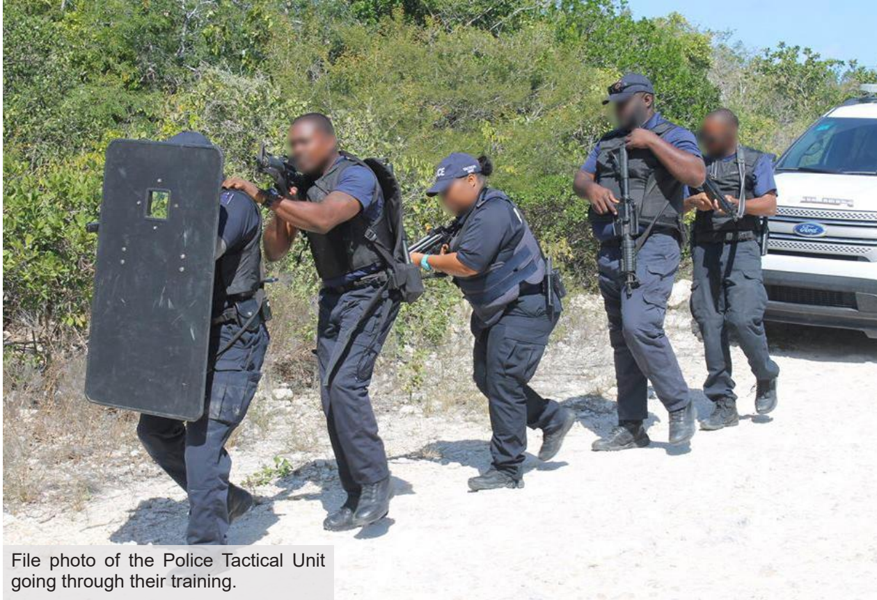
File photo of the Police Tactical Unit going through their training.

Commissioner of Police Trevor Botting is informing the public that the Royal Turks and Caicos Islands Police Force have been put on high alert following the daring daylight gun-slaying of a man in the country's tourist belt – Grace Bay – and the trading of bullets between RTCIPF members and heavily armed men in the tough community of Dock Yard, on Wednesday, August 2.