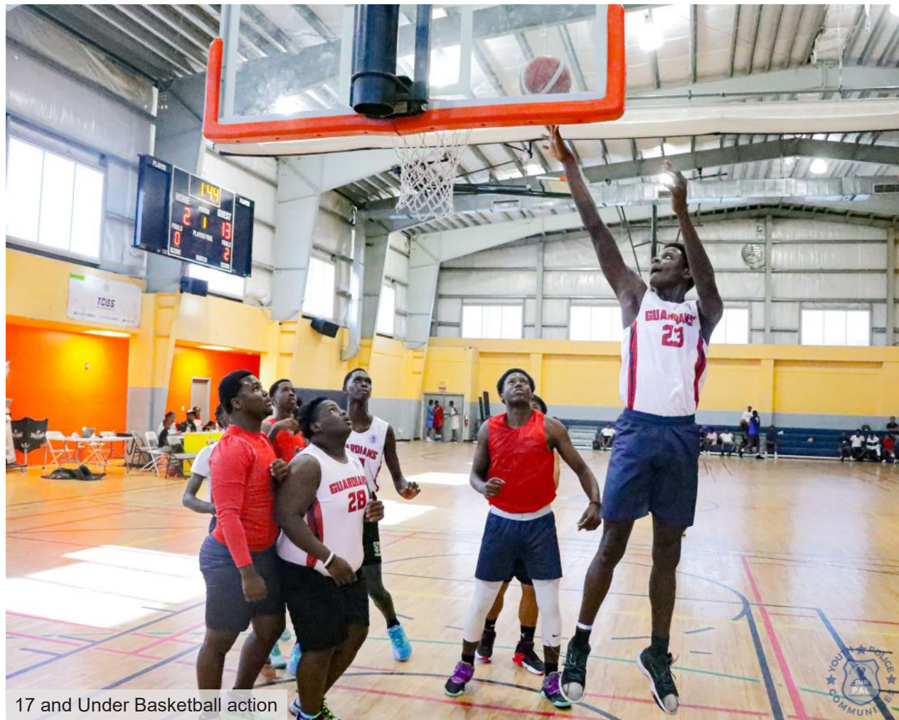
17 and Under Basketball action