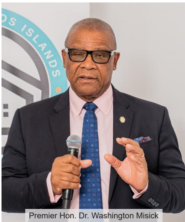
Premier Hon. Dr. Washington Misick