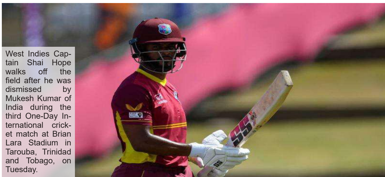
West Indies Captain Shai Hope walks off the field after he was dismissed by Mukesh Kumar of India during the third One-Day International cricket match at Brian Lara Stadium in Tarouba, Trinidad and Tobago, on Tuesday.

India swiftly erased the memory of a poor second match to annihilate the West Indies by 200 runs in the decisive third and final one-day international (ODI) at the Brian Lara Stadium on Tuesday. Even with senior players in captain Rohit Sharma and