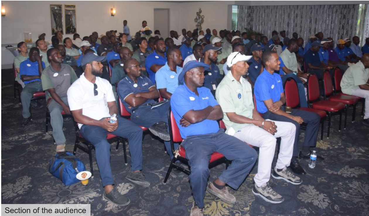
Section of the audience