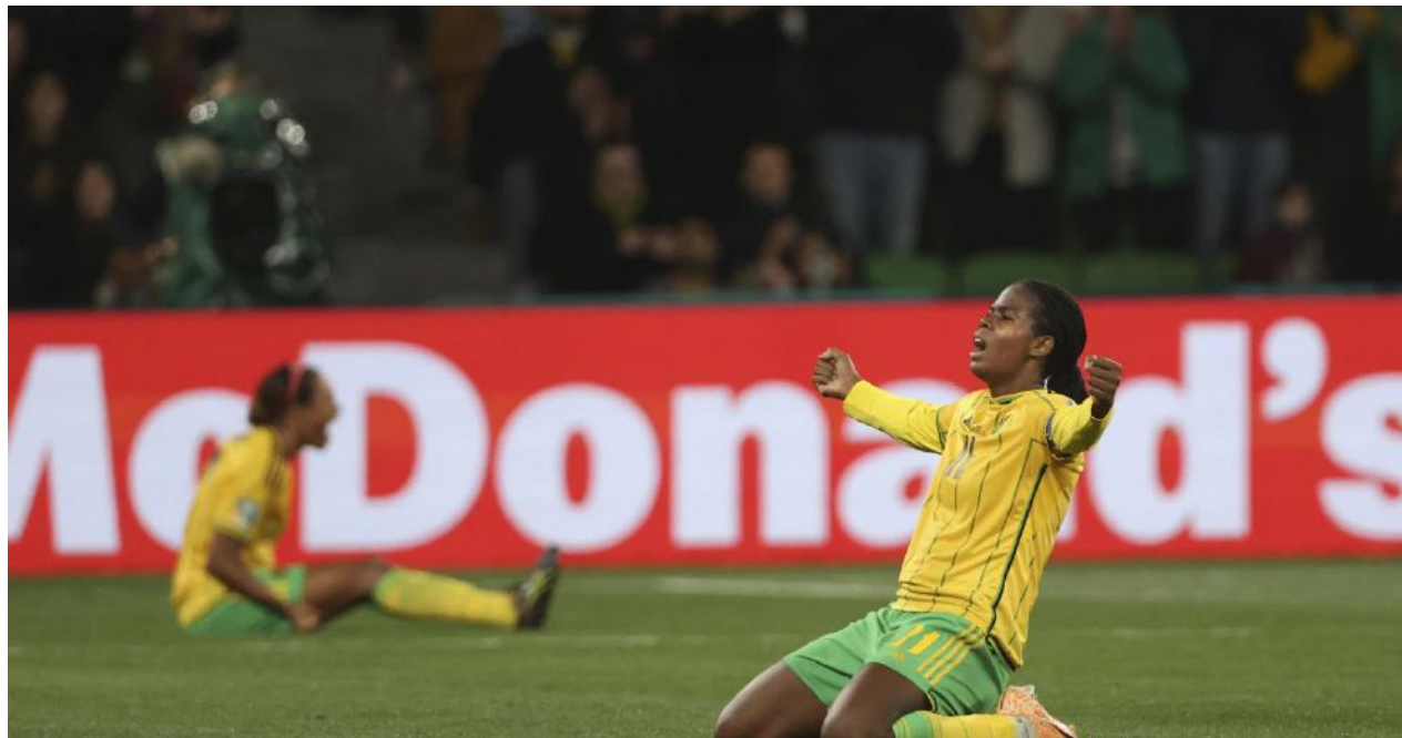
Jamaica's Khadija Shaw (right) celebrates after the Women's World Cup Group F soccer match between Jamaica and Brazil in Melbourne, Australia, Wednesday, August 2.

Jamaica advanced to the knockout round for the first time following a 0-0 draw Wednesday that ended Brazil's run in the group stage for the first time since 1995 at the Women's World Cup.