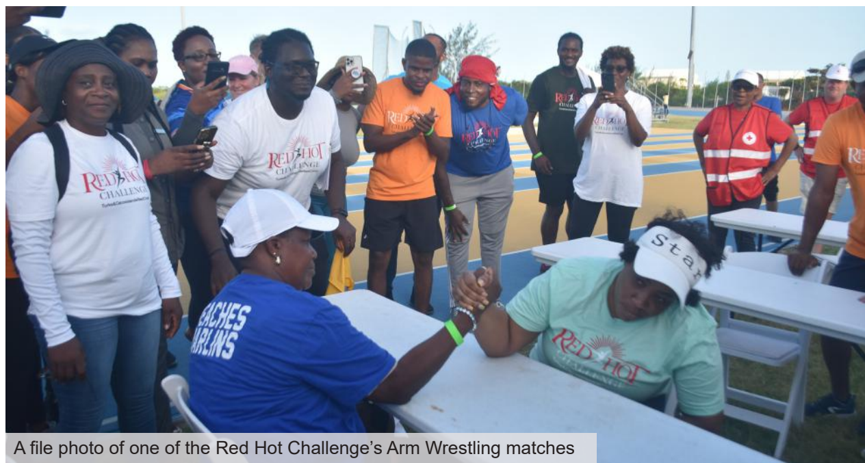
A file photo of one of the Red Hot Challenge's Arm Wrestling matches

Coming off of a smashing success in its second staging despite at least two postponements due to inclement weather this year, the 2024 date for the Turks and Caicos Islands Red Cross Red Hot Challenge Sports Extravaganza has been set.