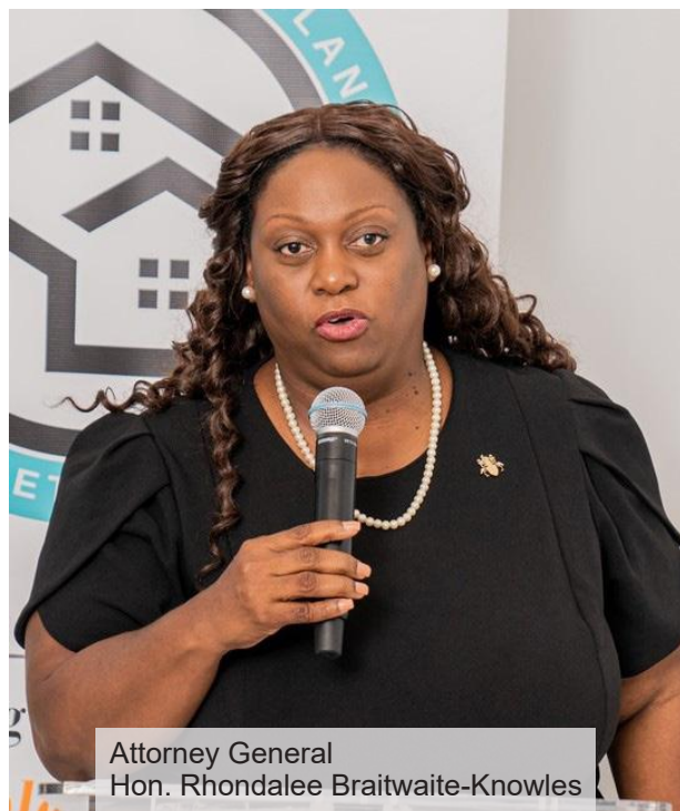
Attorney General Hon. Rhondalee Braitwaite-Knowles