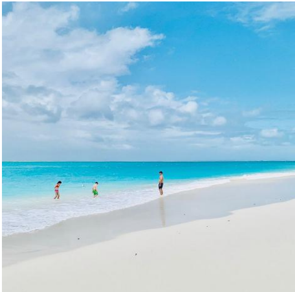
The TCI is the perennial winner of not only the Best Beach in the Region but also the best Beach in the World.

The World Travel Awards Caribbean and Americas Gala Ceremony 2023 is scheduled for Sandals Grande St. Lucian, Saint Lucia on Saturday 26 August, and the Turks and Caicos Islands is well represented.