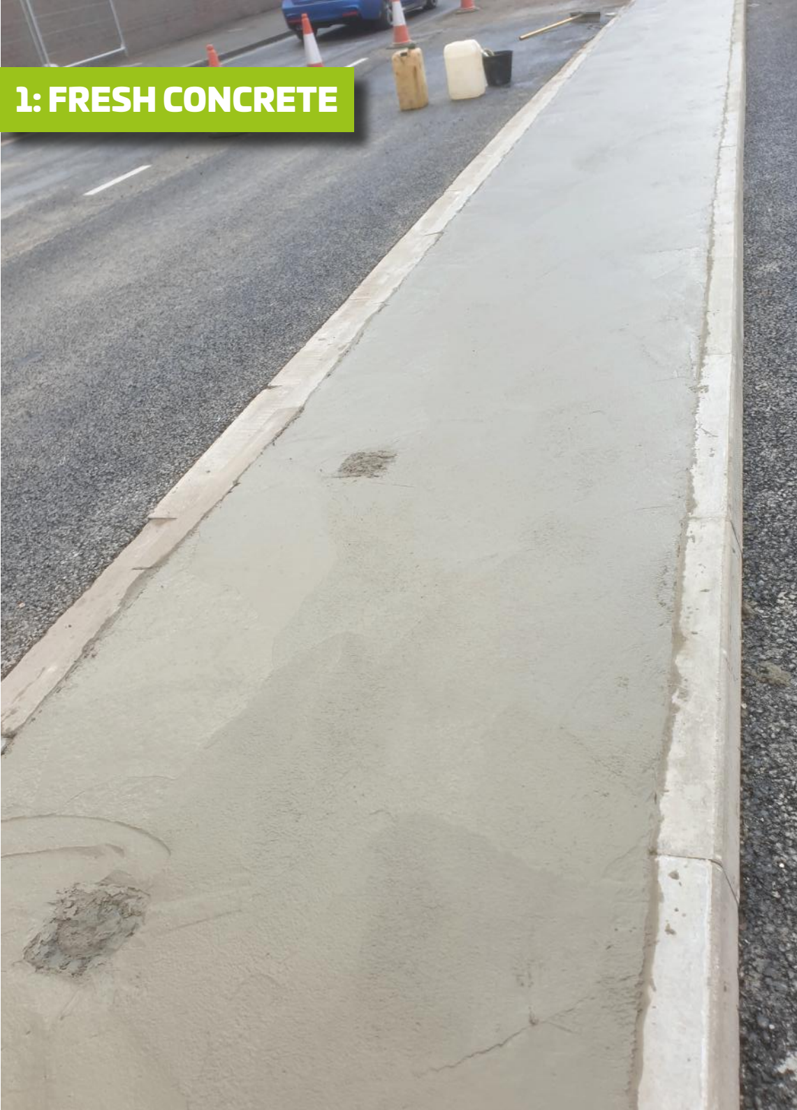
1: FRESH CONCRETE