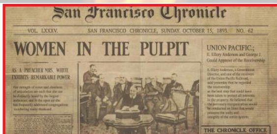
A newspaper article about Ellen G. White preaching in October 1893

The second focus of Ellen White's life was the Bible. The Bible played a foundational role in her personal experience and in her ministry. Her writings are full of Scripture. Her prophetic ministry was to uplift the Word of God. Mrs. White wrote, "You are not familiar with the Scriptures. If you had made God's word your study, with a desire to reach the Bible standard and attain to Christian perfection, you would not have needed the testimonies. It is because you have neglected to acquaint yourselves with God's inspired Book that He has sought to reach you by simple direct testimonies...The written testimonies are not to give a new light, but to impress vividly upon the heart the truths of inspiration already revealed." She also wrote this, "Let all prove their positions from the Scriptures and substantiate every point they claim as truth from the revealed Word of God..." Testimonies for the Church 2, 605; Evangelism, 256 In her last message to the entire Seventh-day Adventist Church at the General Conference Session in 1909 she held up her Bible and stated, "Brethren and sisters, I commend unto you this Book."