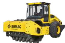
Padfoot Rollers 5-20 Tonne