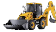
Backhoes 9 Tonne