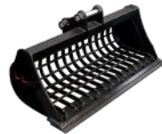
Sieve Buckets 2.5-35 Tonne