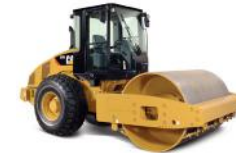
Smooth Drum Rollers 5-20 Tonne Single Drum 9-24 Tonne Multi Wheel