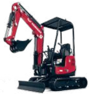
Mini Excavators 1.7-8 Tonne