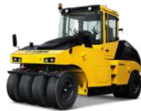
Multi Wheel Rollers 9-23 Tonne