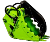
Grapple Buckets 3.5-35 Tonne