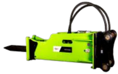
Breakers 1-45 Tonne