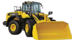
Wheel Loaders 6-30 Tonne