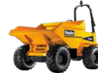
Site Dumpers 3-9 Tonne