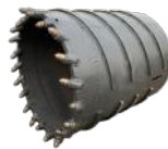
Core Barrels 450mm-900mm