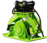
Vibration Plates 3.5-35 Tonne