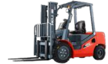
All Terrain Forklifts 2.5-3 Tonne