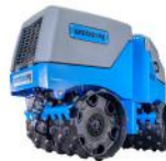
Remote Trench Rollers 1.5 Tonne