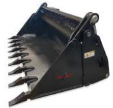
4 in 1 Buckets