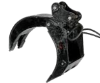
5 Finger Grabs