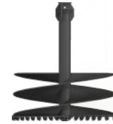
Auger Bits 200mm-1200mm