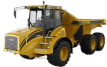
Hydrema 12/22 Tonne