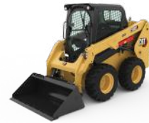
Skid Steers 45-70hp