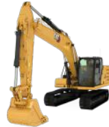
Excavators 10-40 Tonne