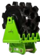
Compaction Wheels 5-35 Tonne