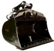
Tilt Mud Buckets 5-35 Tonne