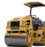
Twin Drum Rollers 1.5-10 Tonne