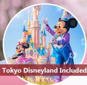
Tokyo Disneyland Included

TRAVEL DATE: MAR.12-17/ MAR.29-APR.03 APR.13-18+USD 150/PAX