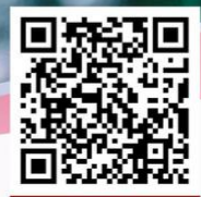
SCAN FOR DETAILED ITINERARY