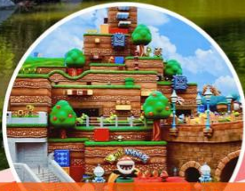
UNIVERSAL STUDIO OPTIONAL TOUR